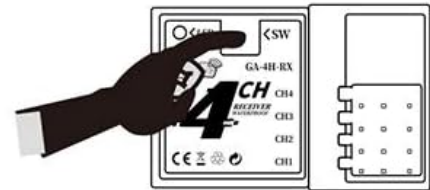
Figure 6: Visual guide for setting and clearing receiver runaway protection.

Press and hold the code key to power on for 3 seconds to clear out of control protection