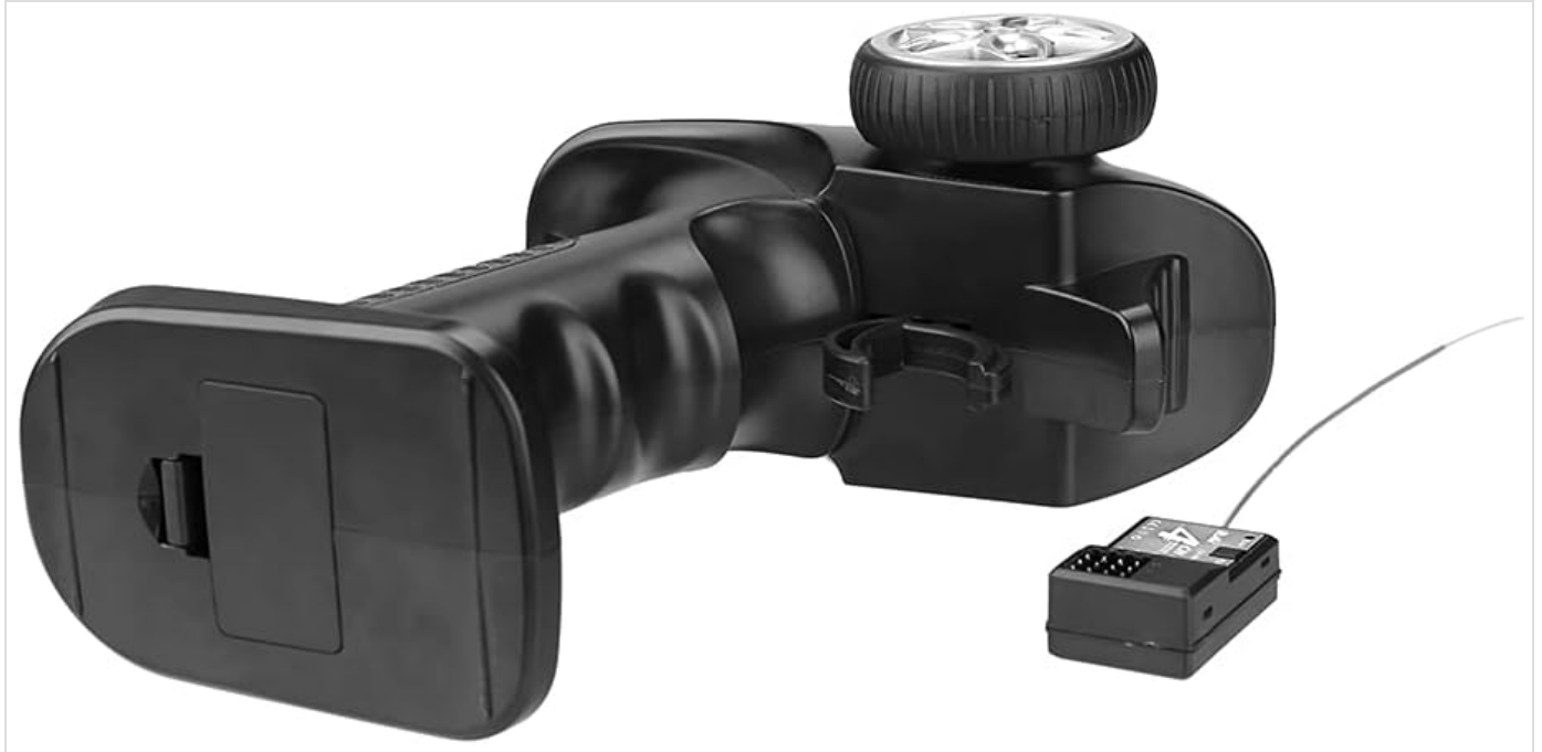
Figure 3: Transmitter bottom view, showing the battery compartment and the included receiver.