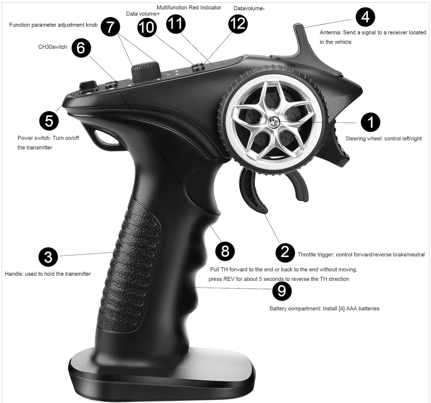
Figure 2: Detailed view of the GA-4H-TX Transmitter with numbered components.