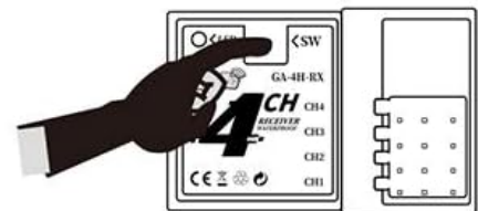
Figure 4: Step-by-step visual guide for pairing the transmitter and receiver.

Press and hold the code key to power on for 3 seconds to clear out of control protection