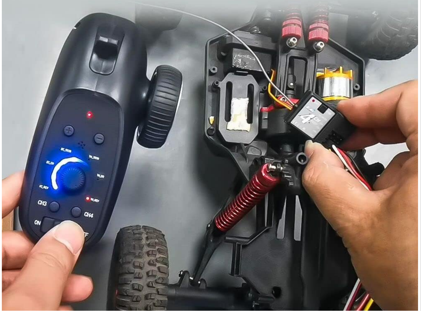
Figure 5: Practical illustration of binding the transmitter (TX) and receiver (RX).

if the remote can't work , pls try to bing the remote and the receiver first.