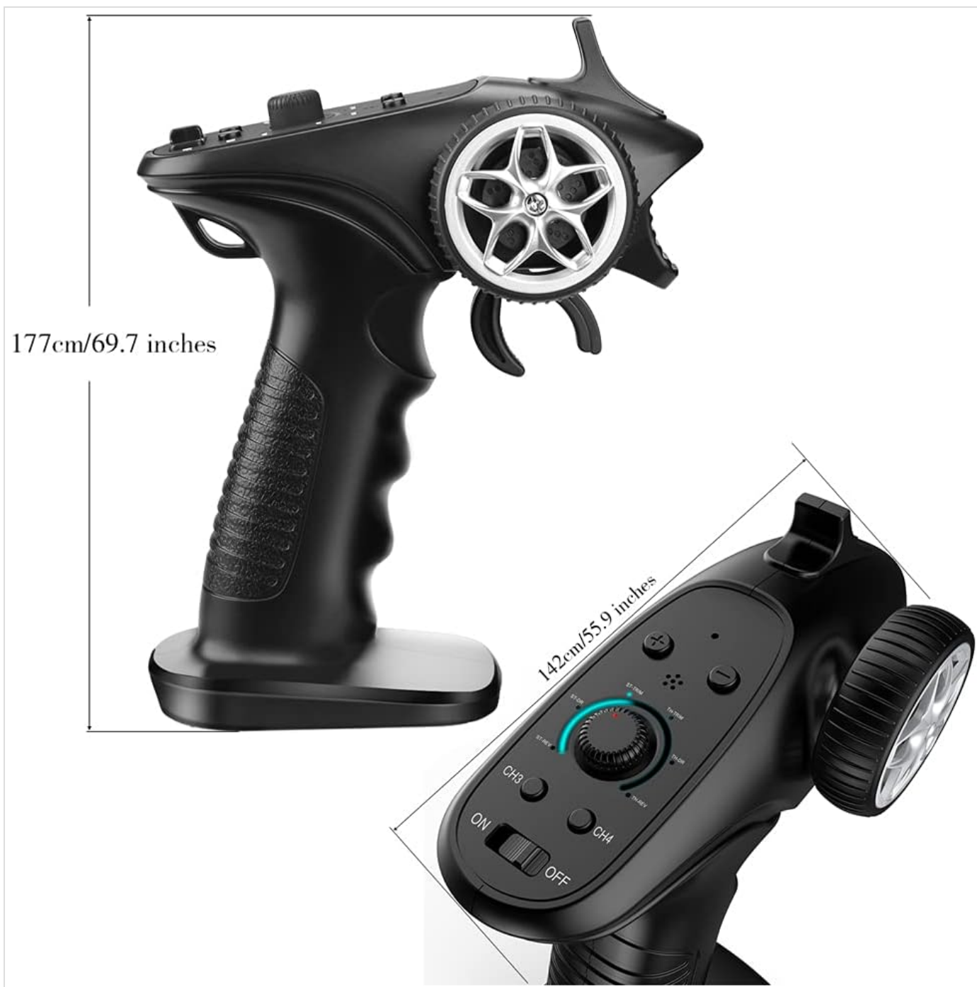
Figure 7: Dimensions of the GA-4H-TX Transmitter.