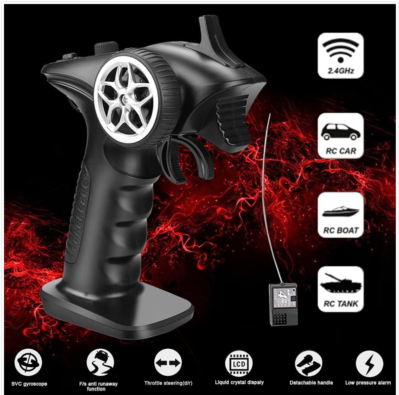
Figure 1: Havcybin GA-4H-TX Transmitter highlighting key features and compatible RC vehicle types (car, boat, tank).