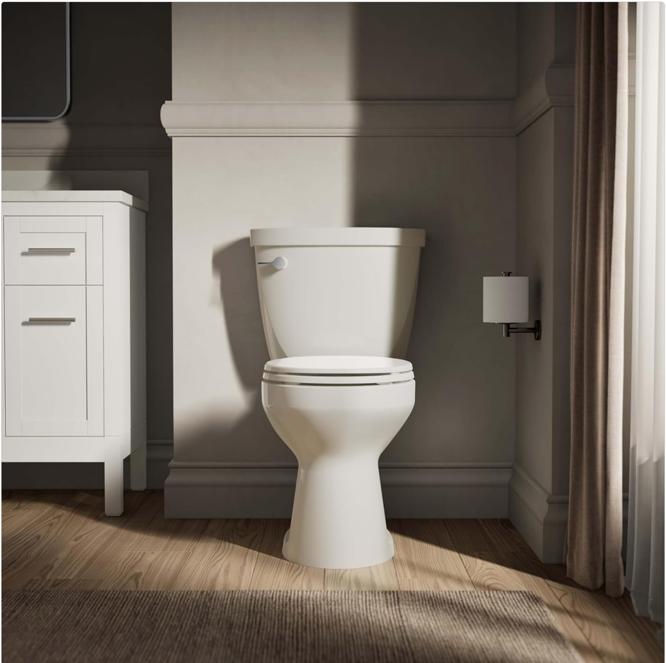
Figure 8: This toilet meets EPA WaterSense criteria for water conservation.