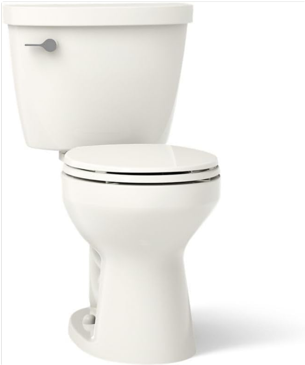
Figure 1: Front view of the KOHLER Cimarron Comfort Height Two-Piece Round-Front Toilet.