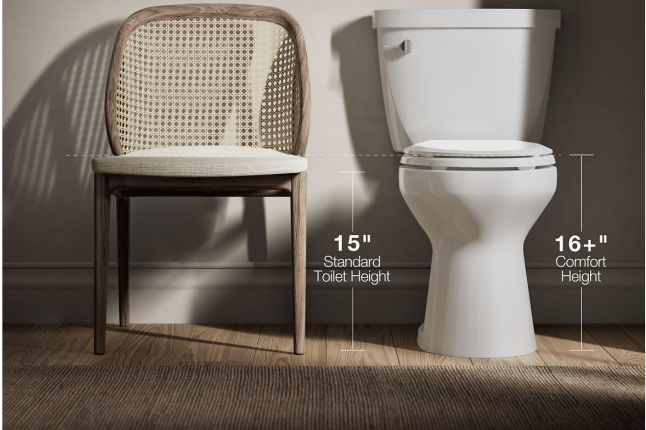
Figure 4: The round-front bowl design is suitable for smaller spaces.