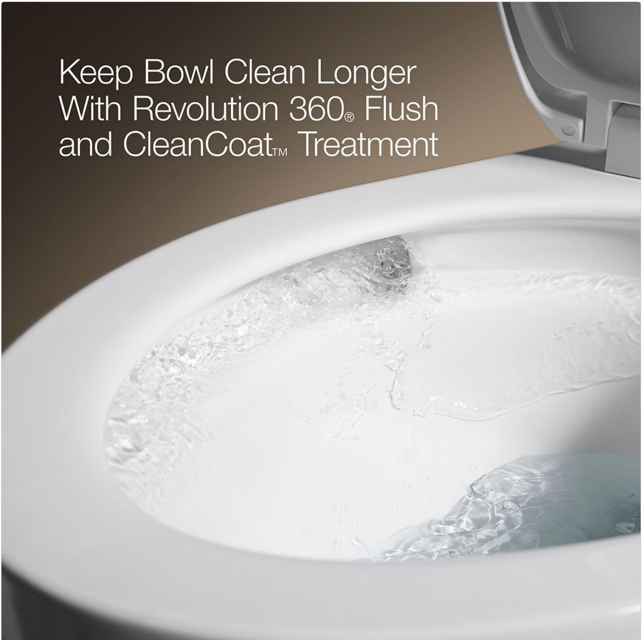
Figure 5: AquaPiston Technology delivers a powerful and effective flush.

Keep Bowl Clean Longer With Revolution 360 ® Flush and CleanCoat ™ Treatment