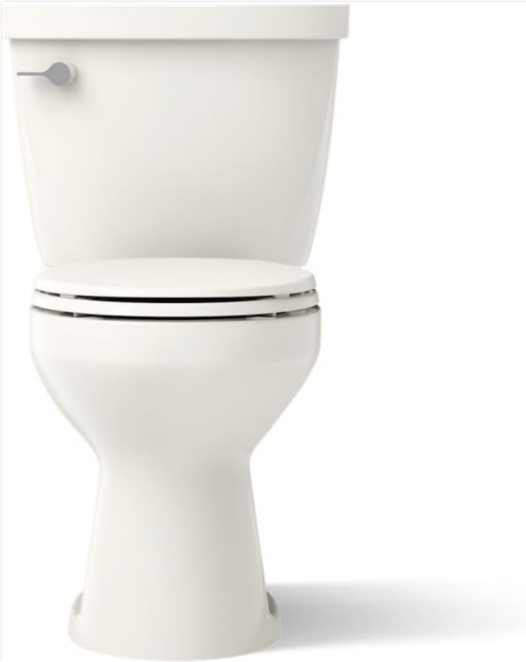
Figure 2: The two-bolt system facilitates fast, easy, and level tank-to-bowl installation.