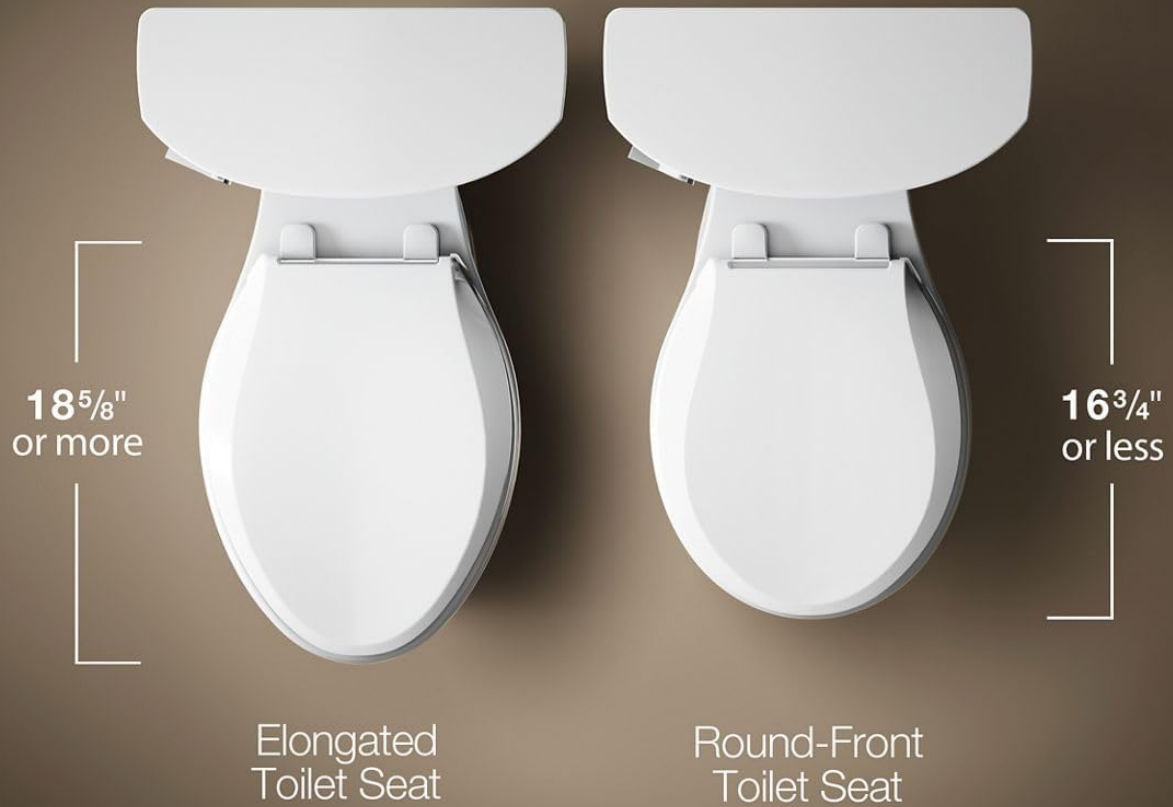
Figure 3: Key dimensions for installation planning.

Toilet bowls come in two shapes. Round-front bowls require less space, while elongated bowls provide added room and comfort.