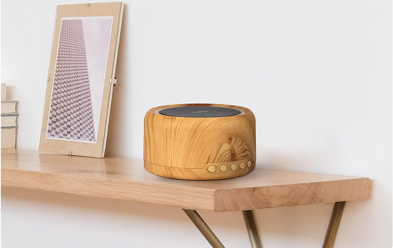
Image: The Lulia White Noise Machine on a shelf, illustrating the six main categories of soothing sounds available.