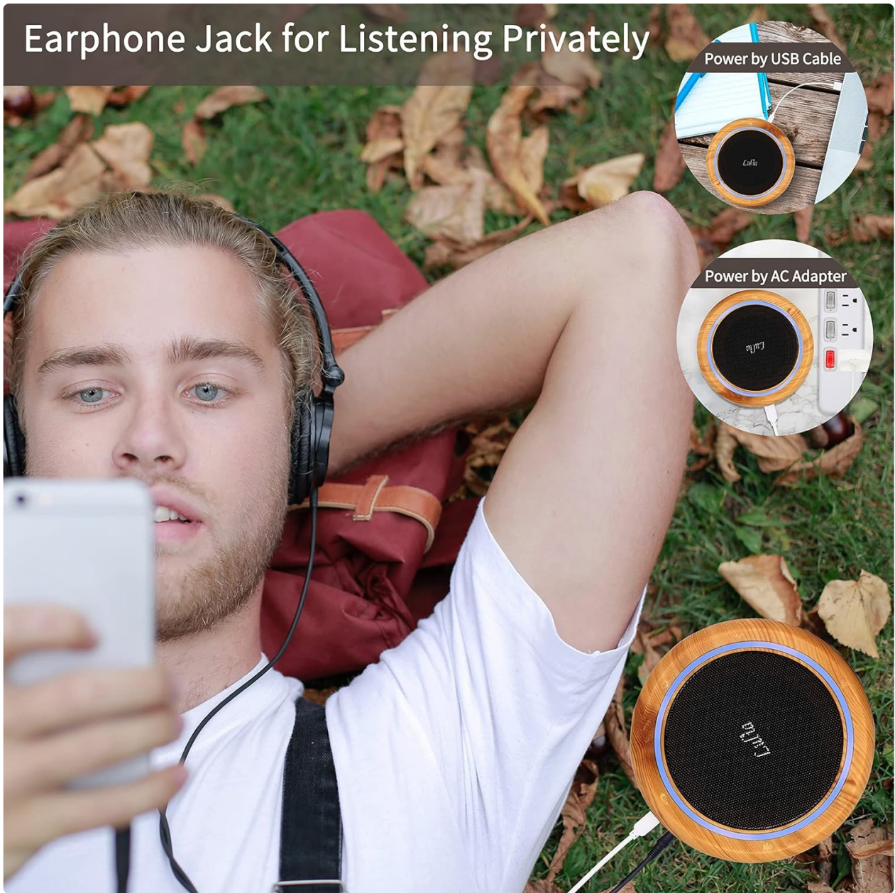
Image: Rear view of the Lulia White Noise Machine showing the DC Input and 3.5mm headphone output ports, along with power options via USB cable or AC adapter.