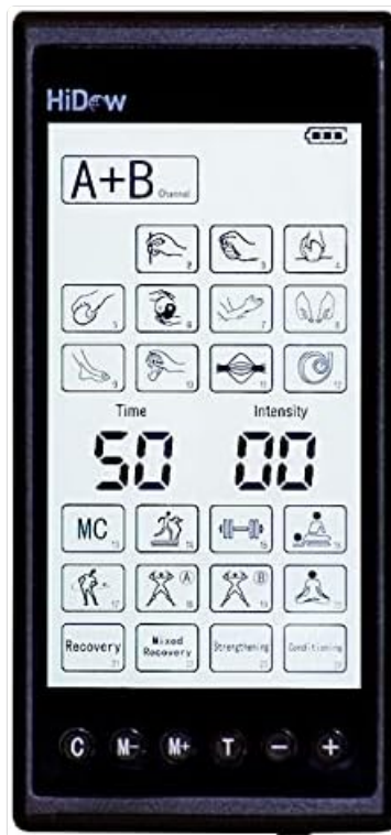
Figure 2: Close-up view of the HiDow XPDS 4|24 LCD screen and control buttons.