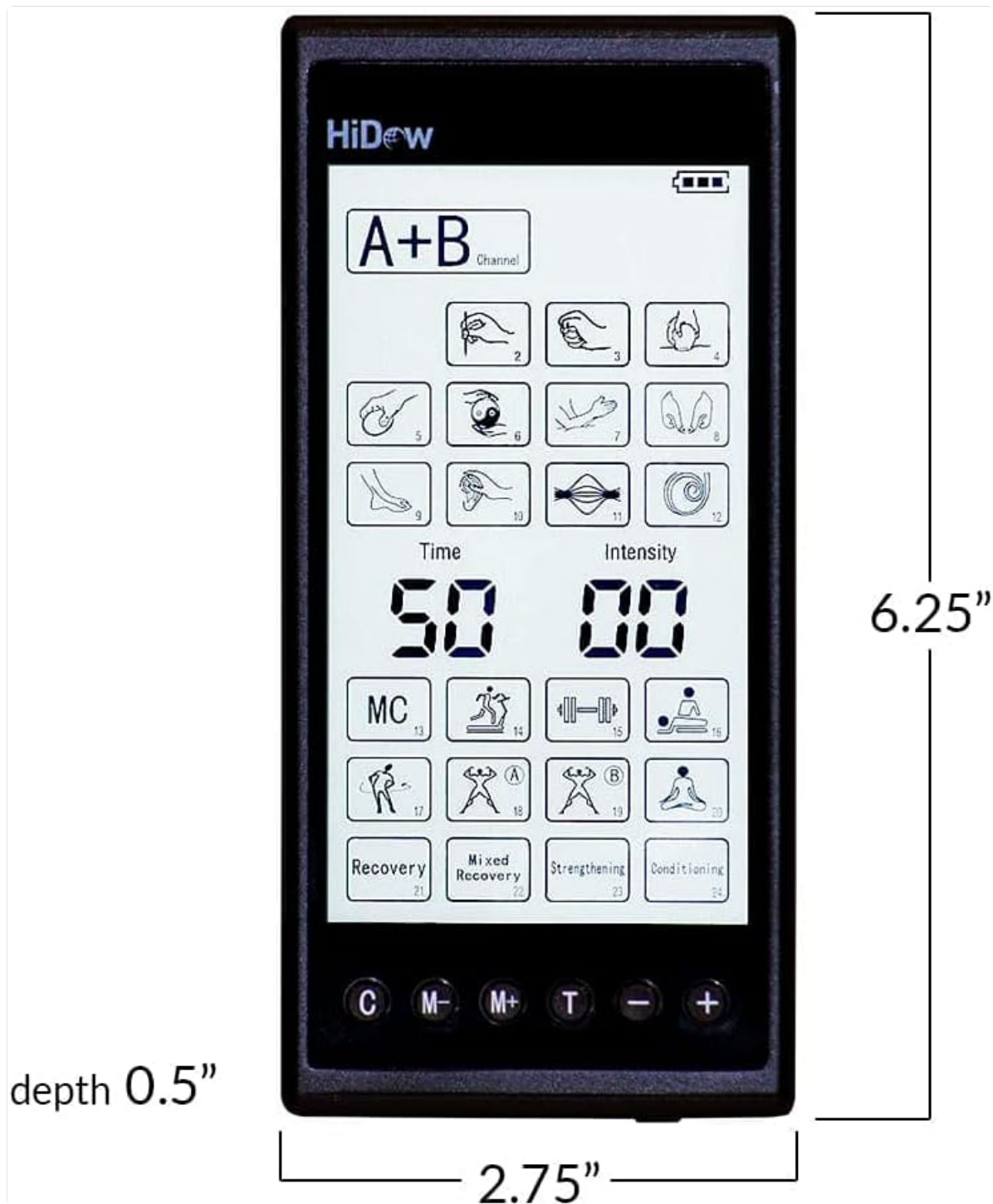
Figure 3: Physical dimensions of the HiDow XPDS 4|24 unit.