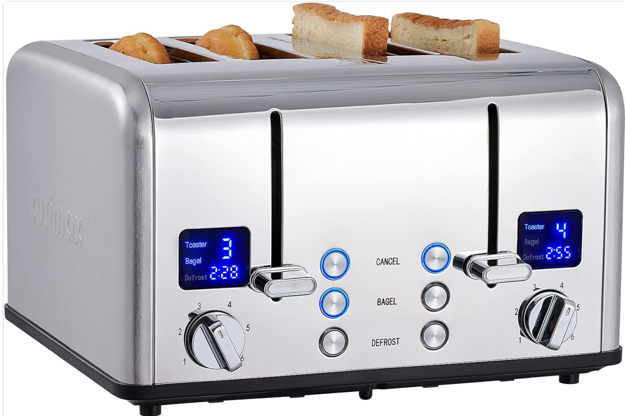
Image: Front view of the CUSIMAX 4-Slice Toaster, showing its stainless steel finish, four slots, dual control panels, and LED displays.

The CUSIMAX 4-Slice Toaster (Model: 8250ES) is designed for efficient and convenient toasting of various bread types. It features dual independent control panels, extra-wide slots, and multiple functions for optimal results.