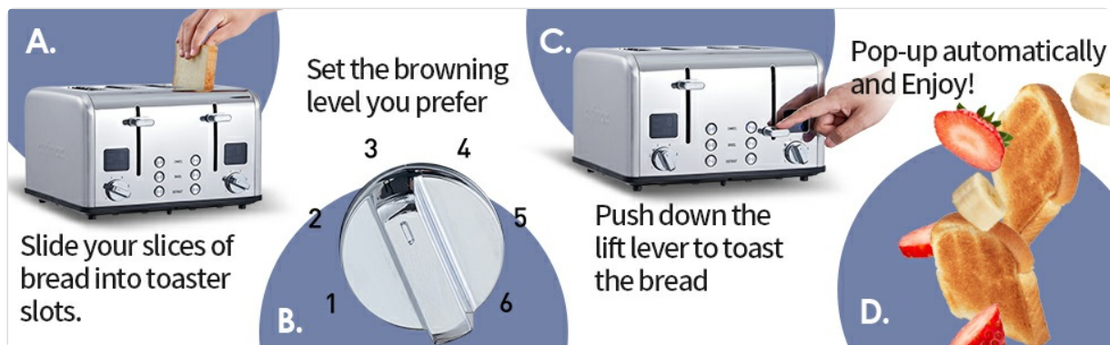
Image: Step-by-step visual guide on how to use the toaster, including inserting bread, setting browning level, pushing down the lever, and toast popping up.