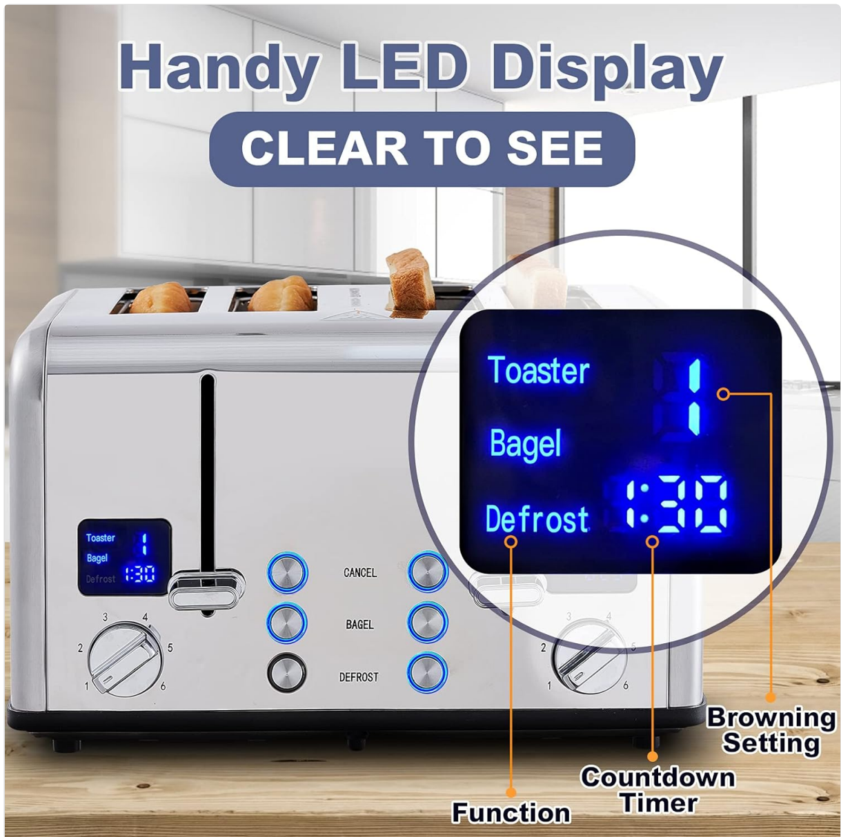
Image: Close-up of the toaster's LED display, showing the browning setting, function (Toaster, Bagel, Defrost), and countdown timer.