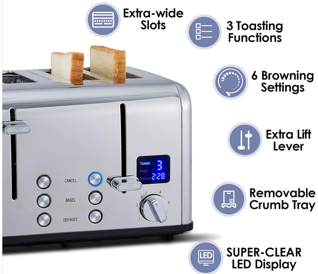
Image: Diagram highlighting key features of the toaster, including extra-wide slots, 3 toasting functions, 6 browning settings, extra lift lever, removable crumb tray, and LED display.