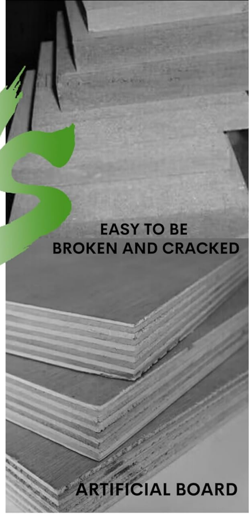
Image 2.1: Illustration comparing the natural solid hardwood construction of the LZRS gate with artificial board materials, emphasizing durability.