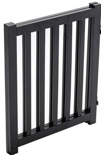
Image 6.1: The gate folds flat for convenient storage when not in use.