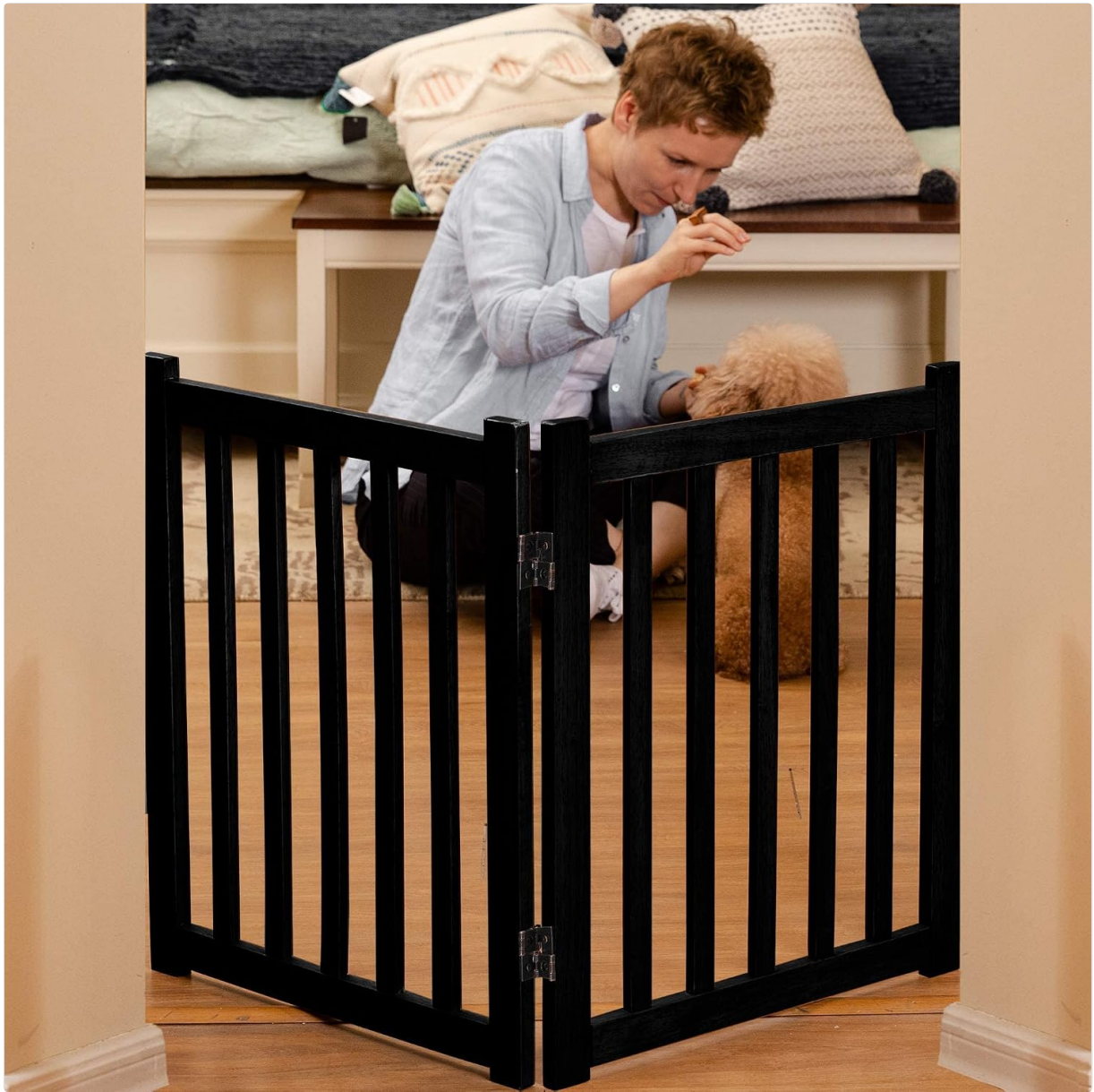
Image 2.2: Detail of the durable 360-degree double-open hinges, allowing for versatile gate configurations.