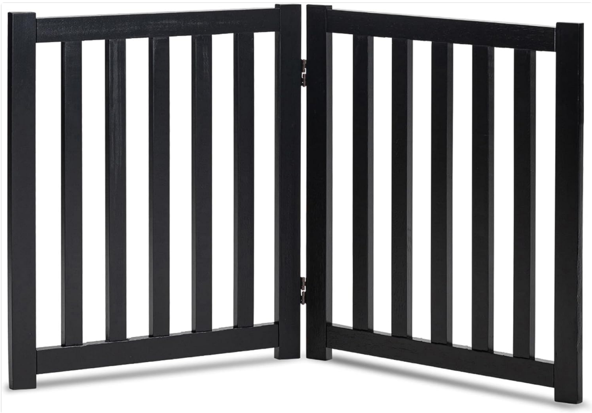
Image 1.1: The LZRS 2-Panel Wooden Freestanding Dog Gate in its open, ready-to-use configuration.