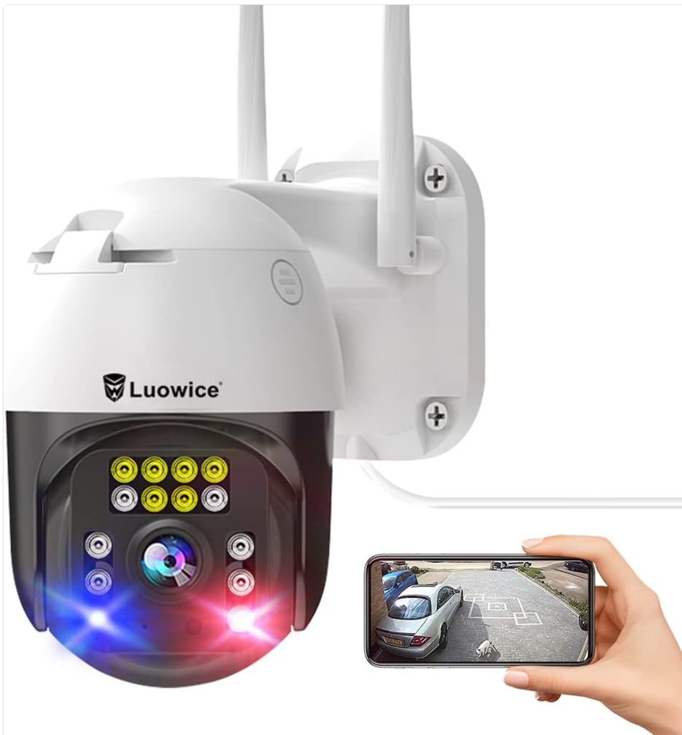
Figure 1: Luowice 5MP PTZ Security Camera with live view on a smartphone.