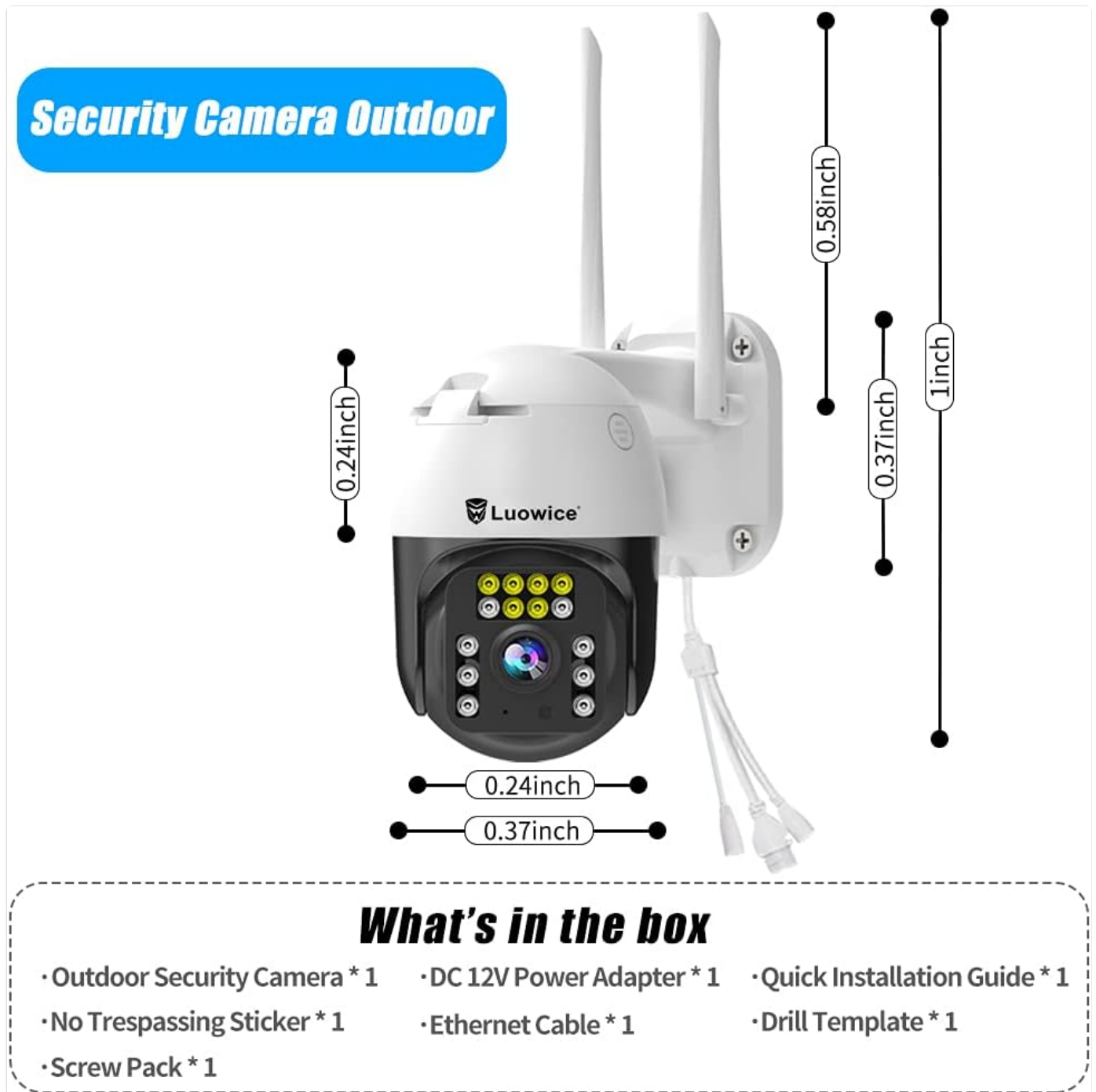
Figure 2: Included components of the Luowice 5MP PTZ Security Camera package.