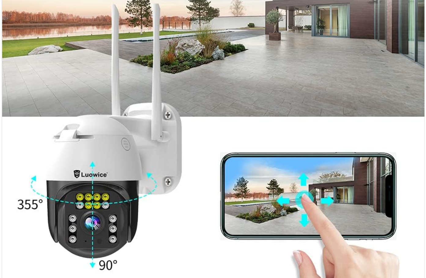
Figure 3: Example of the security camera mounted on an exterior wall.

Remotely Pan & Tilt, Wide Area Monitoring