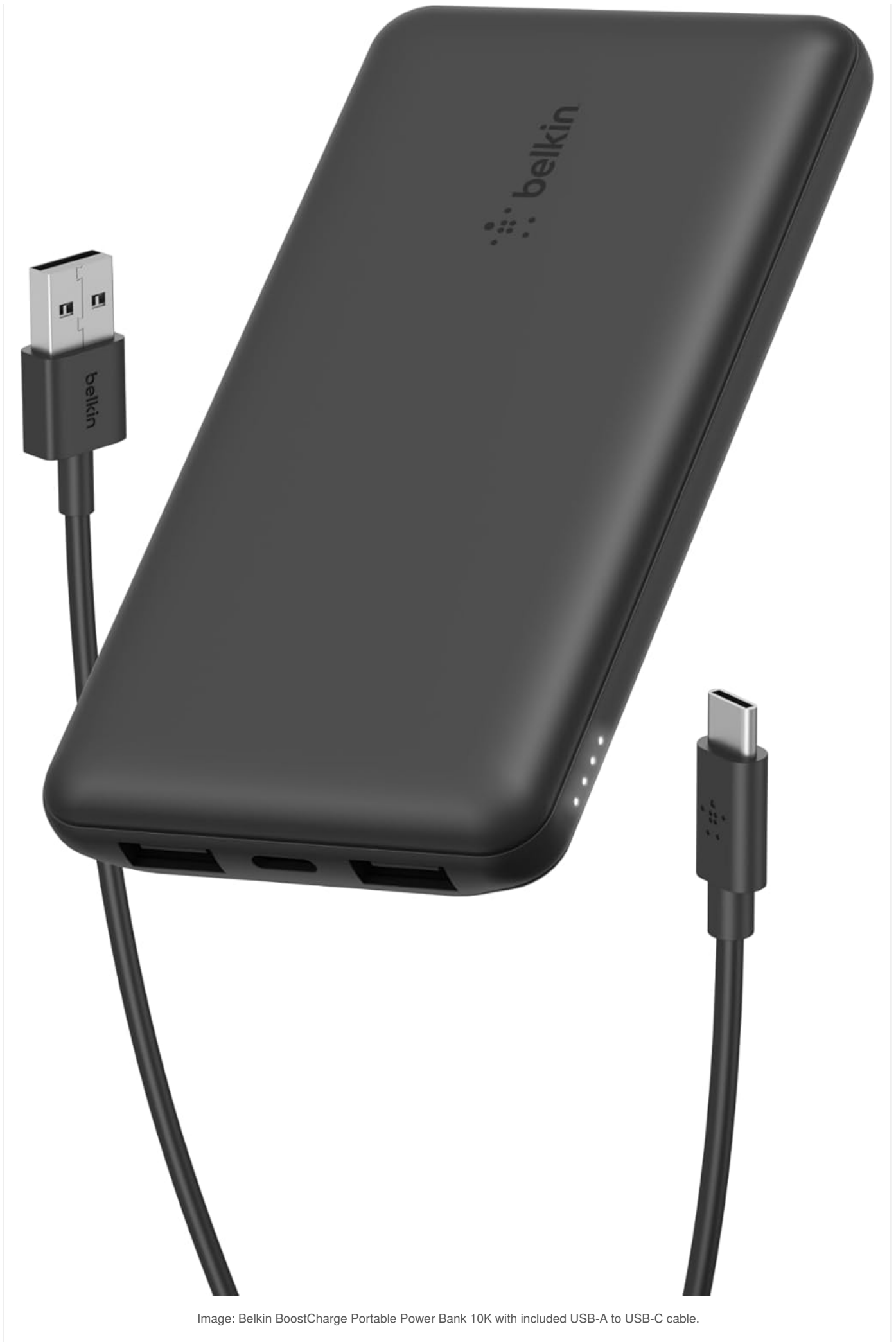
Image: Belkin BoostCharge Portable Power Bank 10K with included USB-A to USB-C cable.