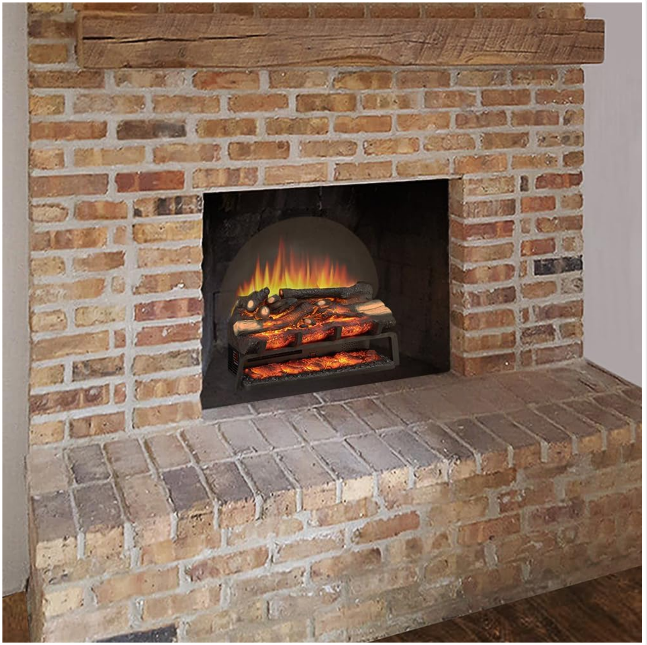
Figure 2: The electric fireplace log set placed inside a traditional brick fireplace opening, demonstrating its free-standing installation.