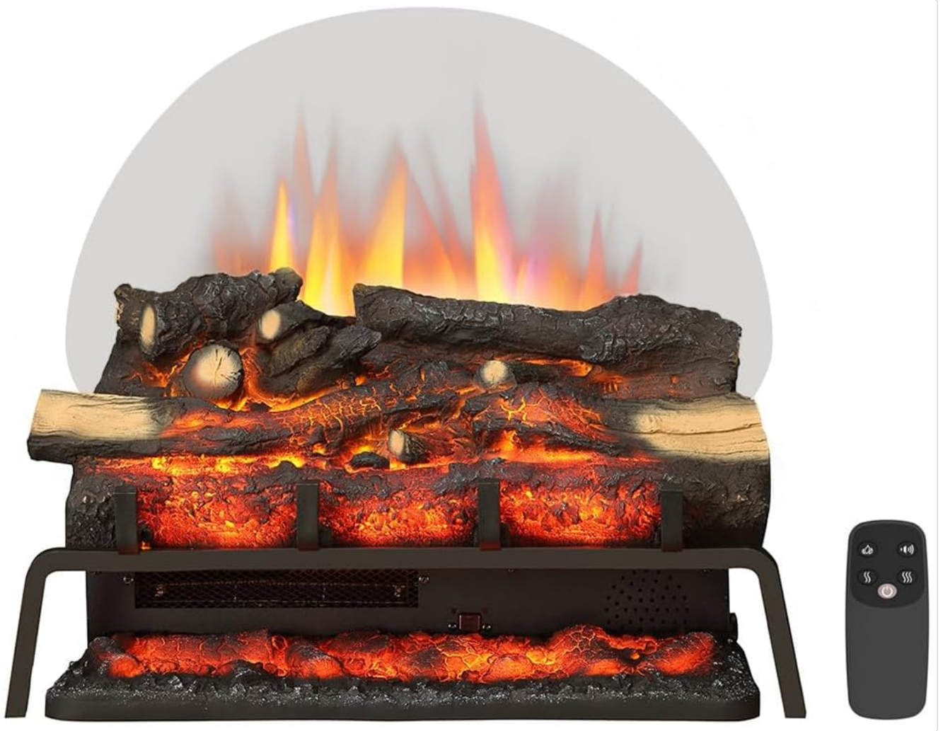
Figure 1: The LegendFlame 23" Electric Fireplace Log Set with its remote control. The unit features realistic logs and an ember bed.