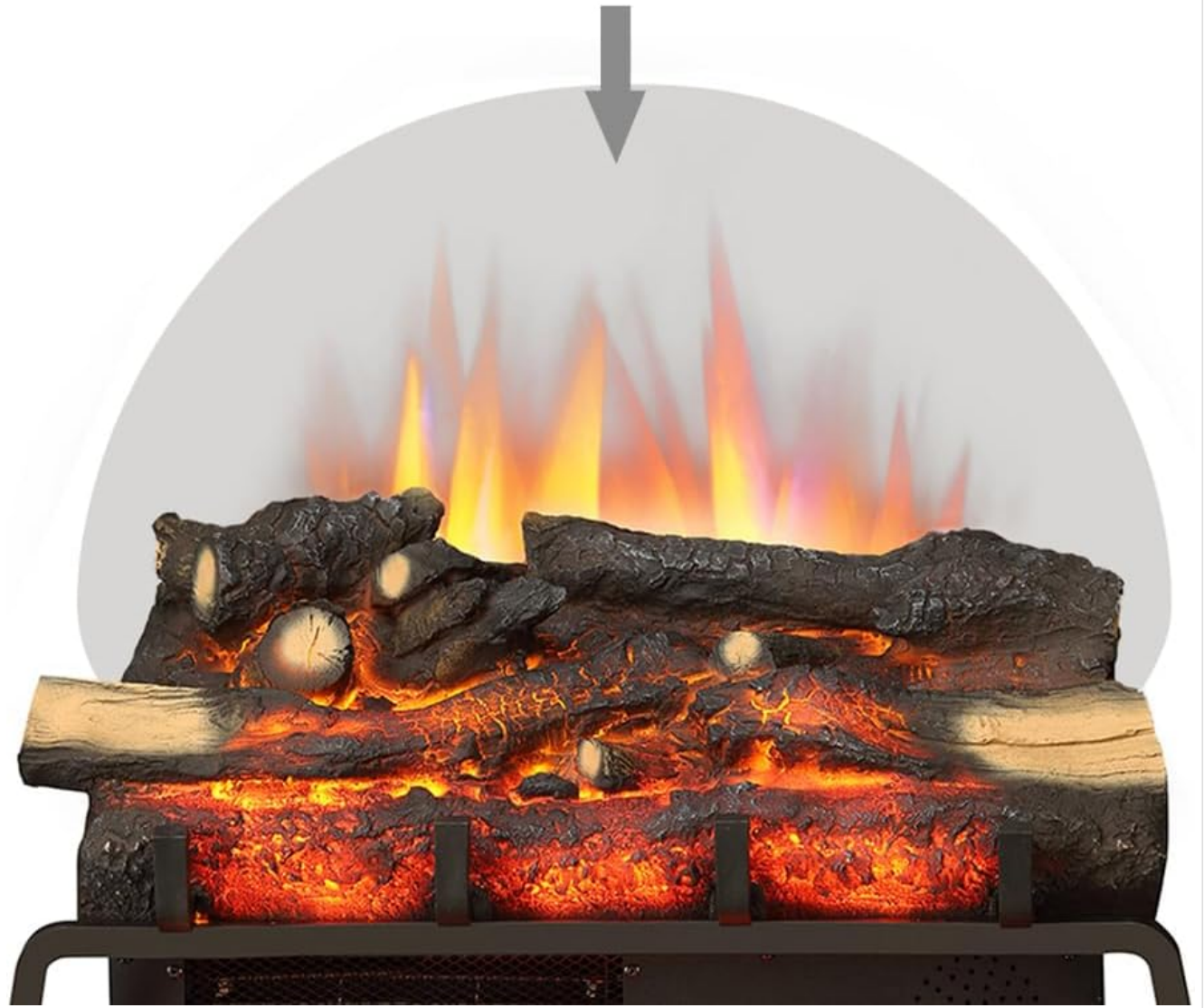
Figure 6: The matte flame screen ensures real and bright flame effects without reflecting ambient light.

Keep the real and bright flame effects and does NOT reflect light or anything in the room.