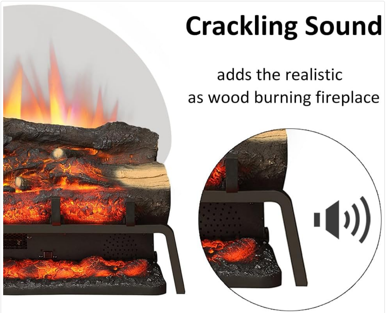
Figure 5: The unit features realistic logs with an ember bed and an adjustable crackling sound effect for an enhanced ambiance.

The stunning flame effect rises from realistic resin logs and an ember bed. The 100% energy-saving LED technology allows you to enjoy the beautiful flame effect with or without the heater, year-round. The crackling sound feature adds to the realistic experience and can be adjusted to your preference.