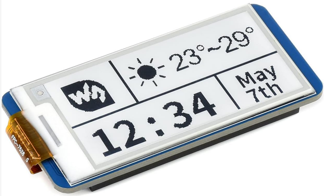
Image 5.2: Example content displayed on the 2.13 inch E-Paper, demonstrating its clarity.