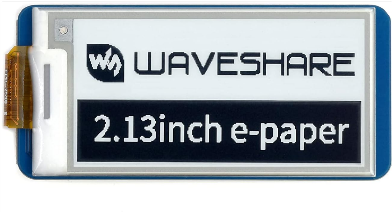
Image 5.1: The 2.13 inch E-Paper Display showing its branding and size.