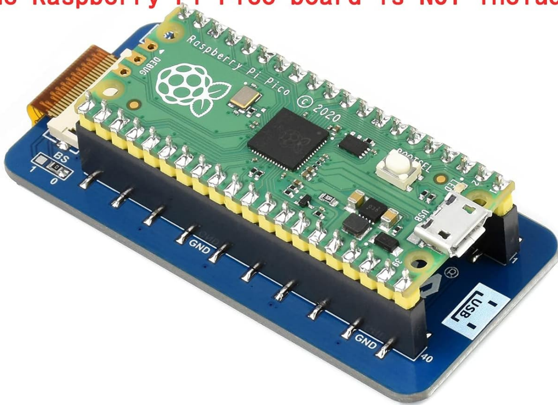
Image 1.1: The 2.13 inch E-Paper Display Module with a Raspberry Pi Pico board. Please note, the Raspberry Pi Pico board is sold separately.

The Raspberry Pi Pico board is NOT included.