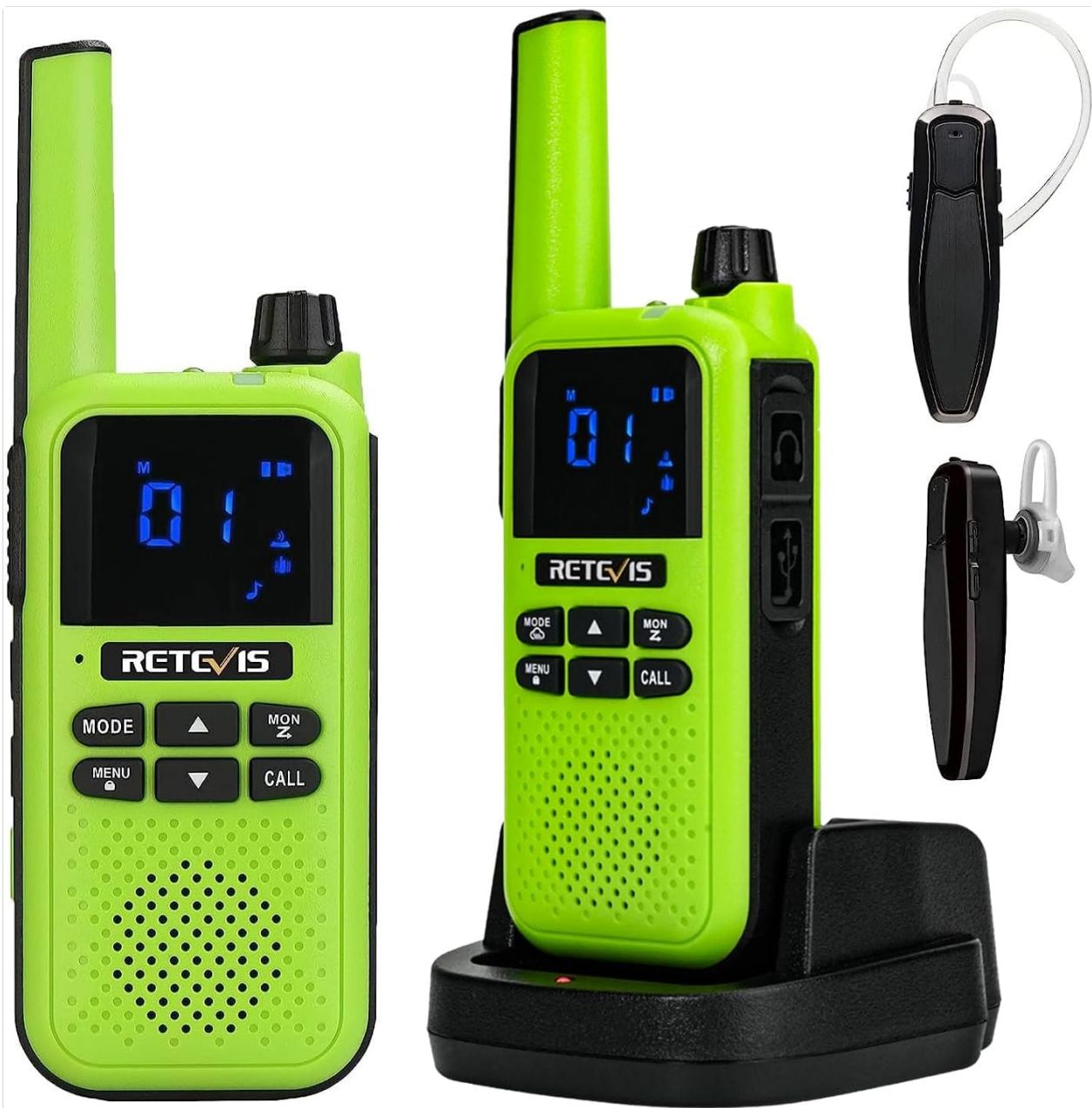
Image 1.1: The Retevis RA619 walkie talkie with its included Bluetooth headset, showcasing its compact design and accessories.