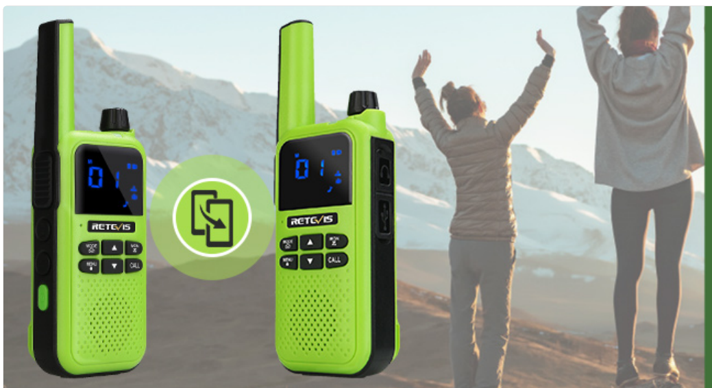
Image 5.10: Two RA619 walkie talkies demonstrating the wireless copy feature, simplifying setup for multiple devices.