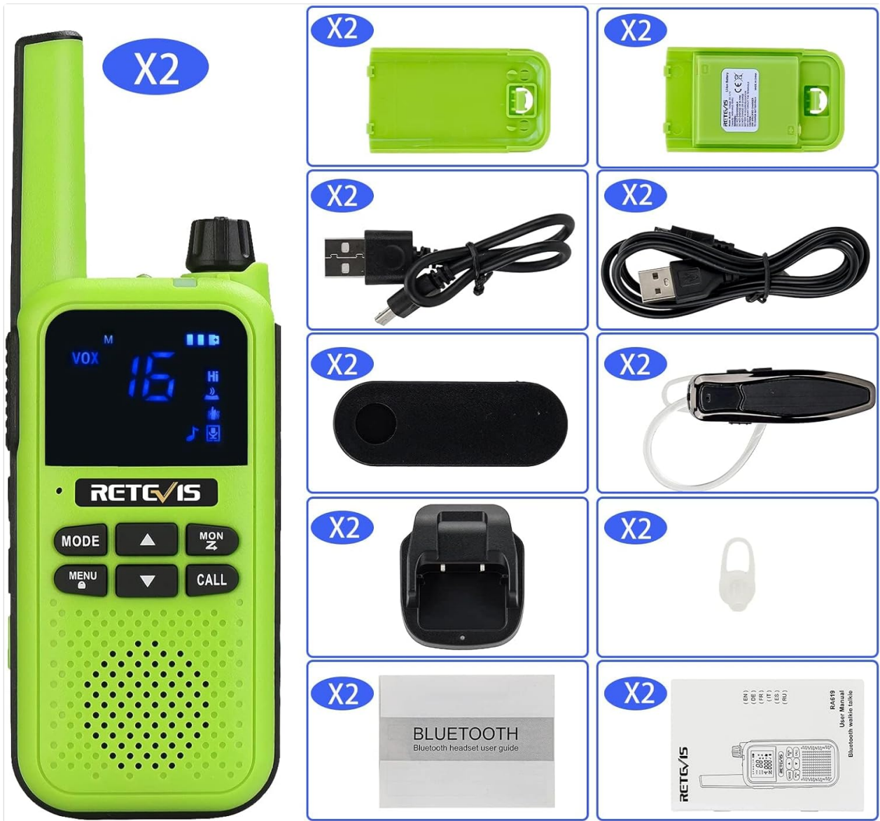
Image 2.1: A visual representation of all components included in the Retevis RA619 walkie talkie package.