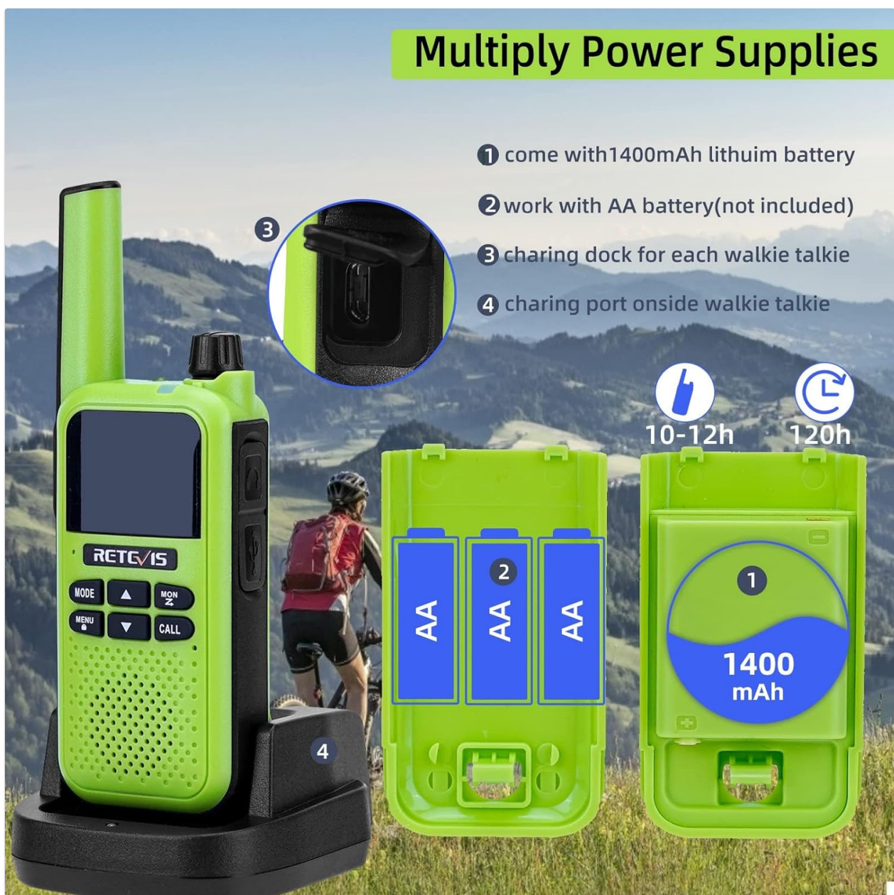
Image 4.1: Illustration of the various power supply methods for the RA619, including the 1400mAh lithium battery, AA battery compartment, charging dock, and micro USB port.

The RA619 walkie talkie offers flexible power options, including a rechargeable lithium-ion battery and compatibility with AA batteries.