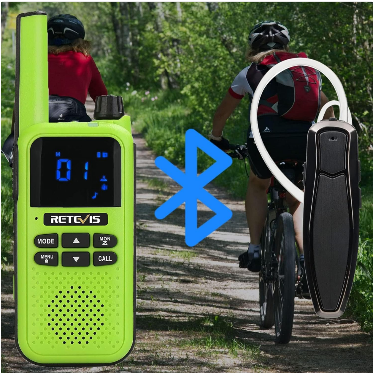
Image 5.2: A Retevis RA619 walkie talkie and its Bluetooth headset, with a background depicting outdoor activity, highlighting its hands-free capability.