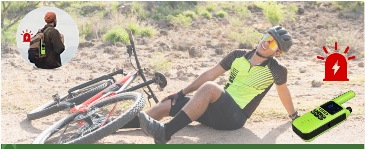
Image 5.7: A scenario depicting the use of the RA619's SOS emergency function after an accident, highlighting its safety utility.

Press and hold the dedicated SOS button to activate the emergency alarm. This will transmit an alert signal to other radios on the same channel.