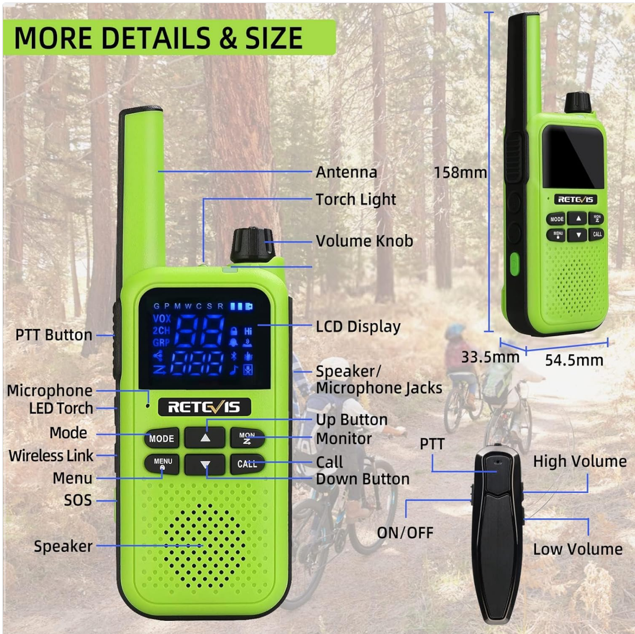
Image 3.1: Detailed diagram illustrating the physical components and control buttons of the RA619 walkie talkie and its Bluetooth headset.