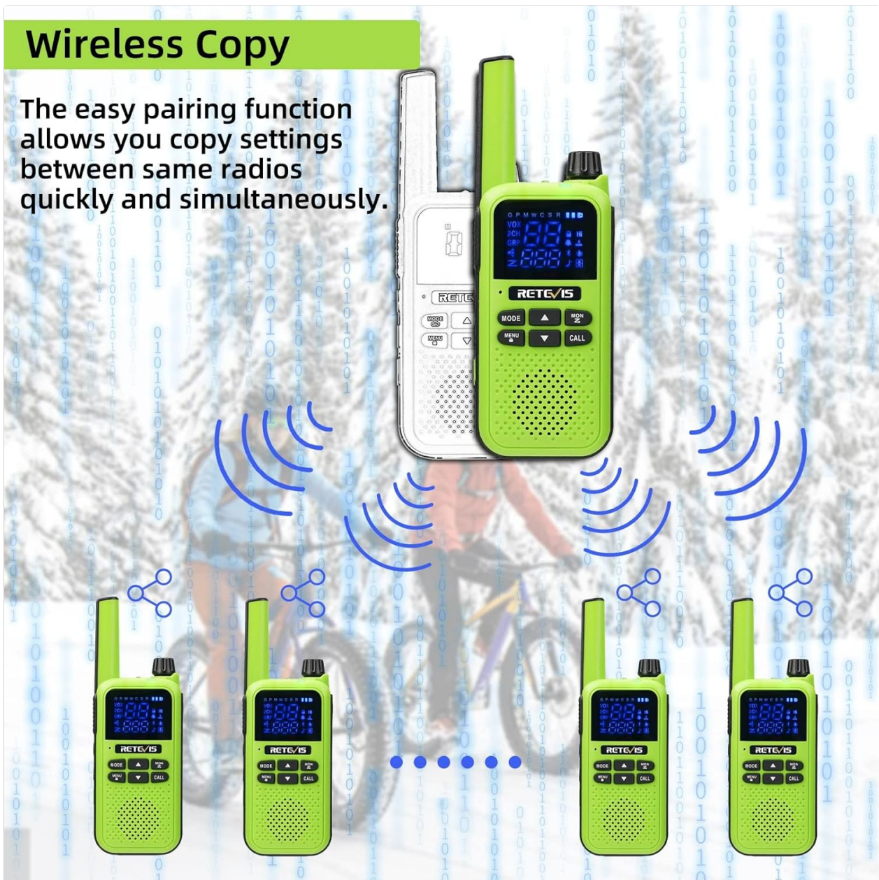
Image 5.9: Diagram illustrating the wireless copy function, enabling quick synchronization of settings across multiple RA619 units.

The easy pairing function allows you copy settings between same radios quickly and simultaneously.