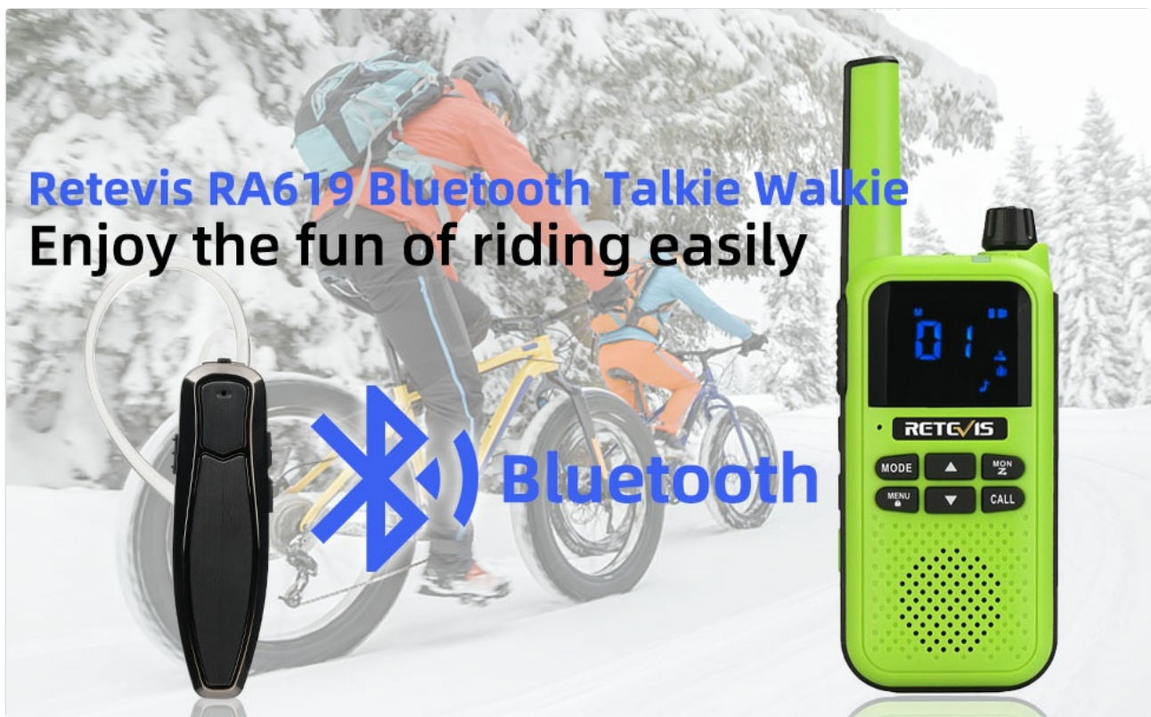
Image: The Retevis RA619 walkie talkie shown with a Bluetooth headset, illustrating its wireless intercom capability for easy pairing within 10 meters.

Note: For optimal performance, use the provided Bluetooth headset. Compatibility with other Bluetooth headsets may vary.