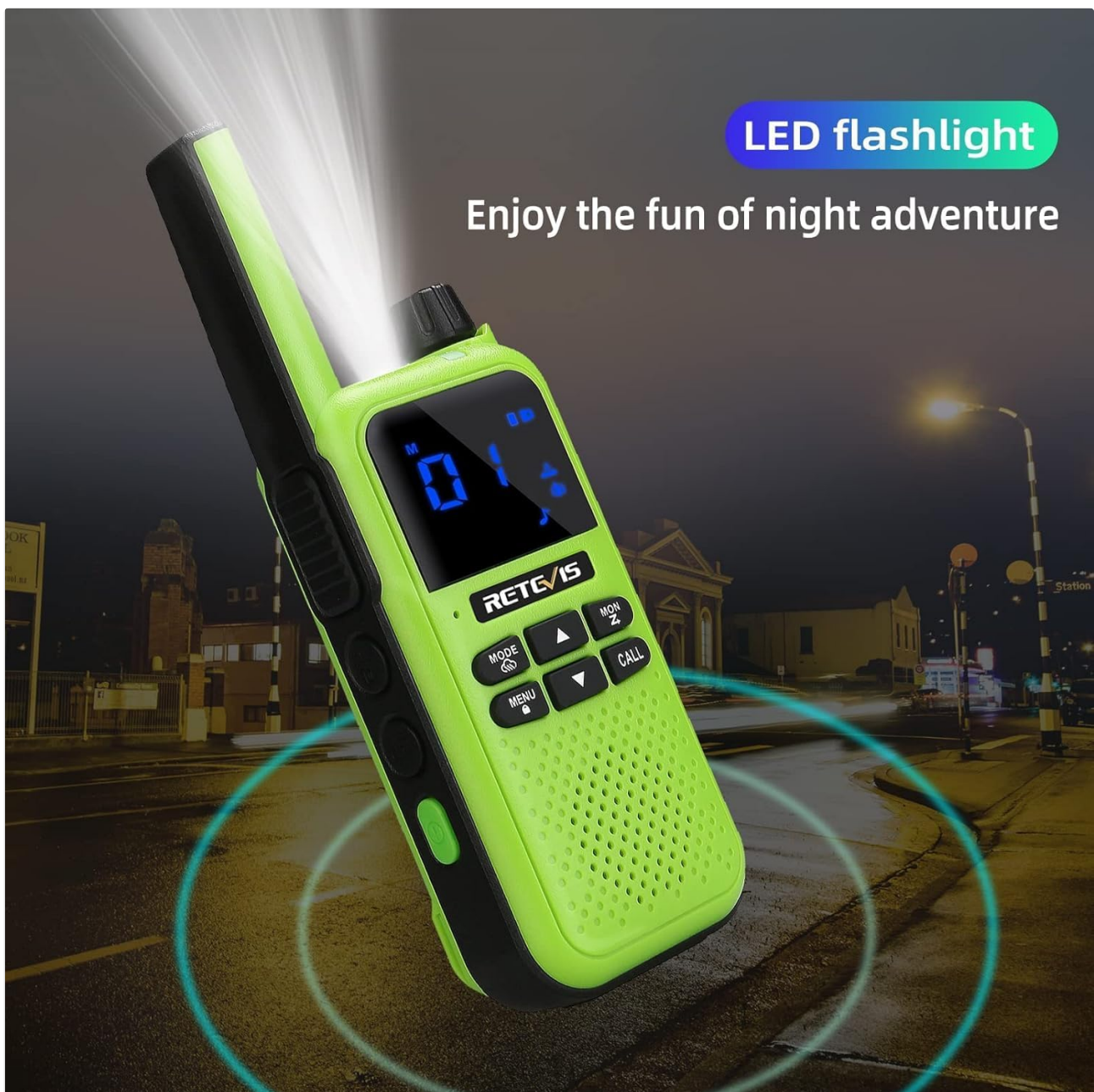
Image: The Retevis RA619 walkie talkie with its LED flashlight activated, providing illumination in a dark outdoor setting.