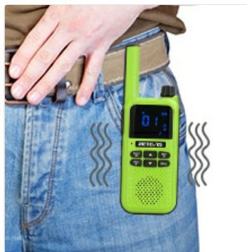
Image: A Retevis RA619 walkie talkie attached to a belt, with wavy lines indicating its vibration alert feature.

The vibration function provides discreet alerts for incoming transmissions, useful in noisy environments or when silence is preferred. This feature ensures you receive information without audible disturbance.