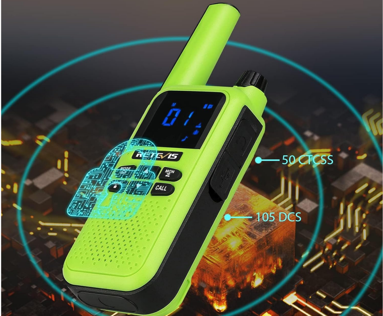
Image: The Retevis RA619 walkie talkie screen showing channel information along with indicators for 50 CTCSS and 105 DCS codes, ensuring secure communication.