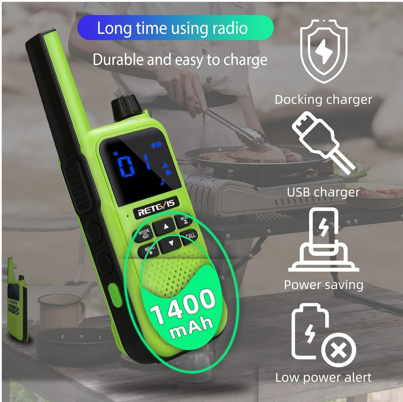
Image: The Retevis RA619 highlighting its 1400mAh battery and various charging methods, including a docking charger and USB cable.