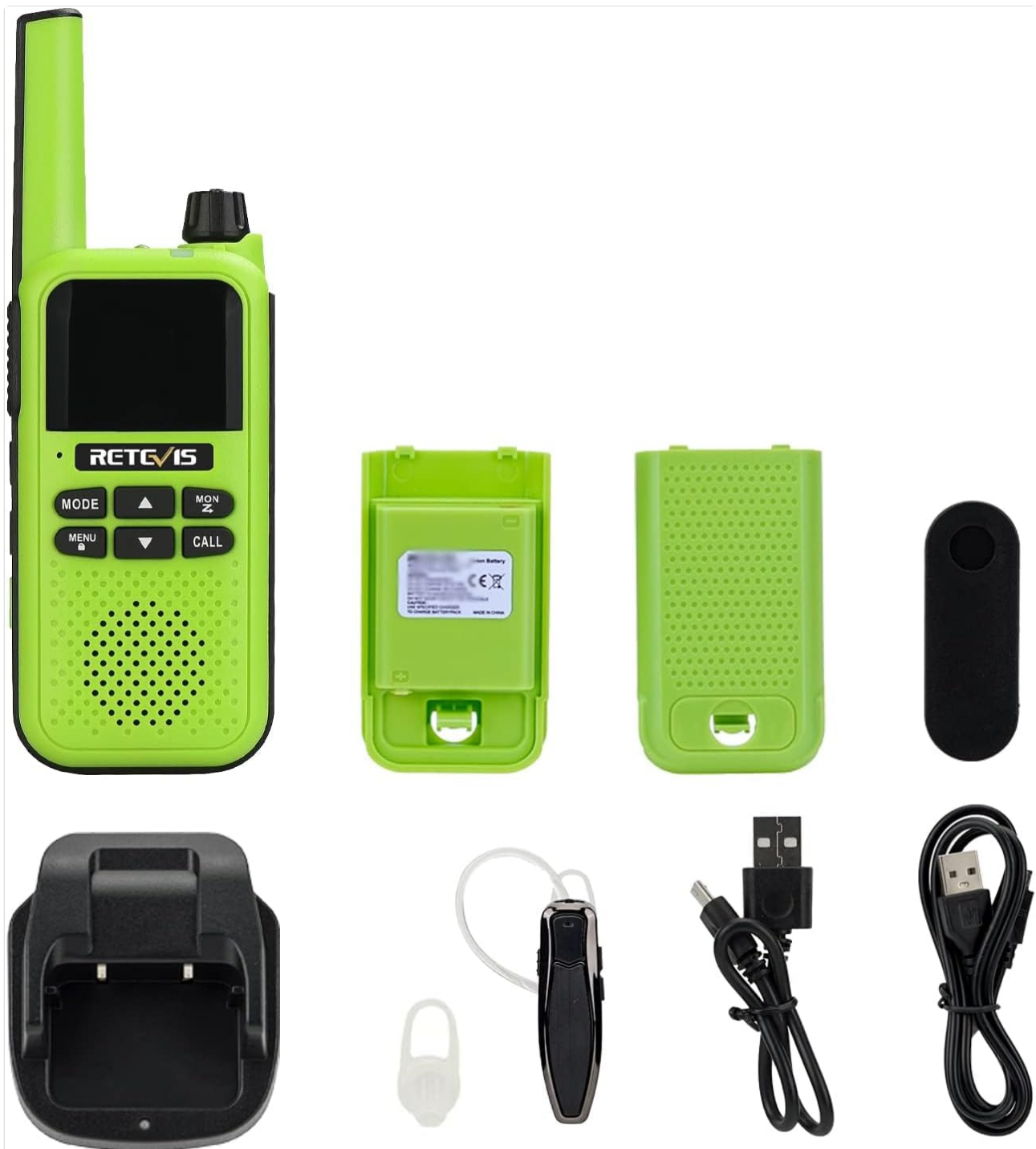
Image: Contents of the Retevis RA619 package, including the walkie talkie, battery, charging base, USB cable, and Bluetooth headset.