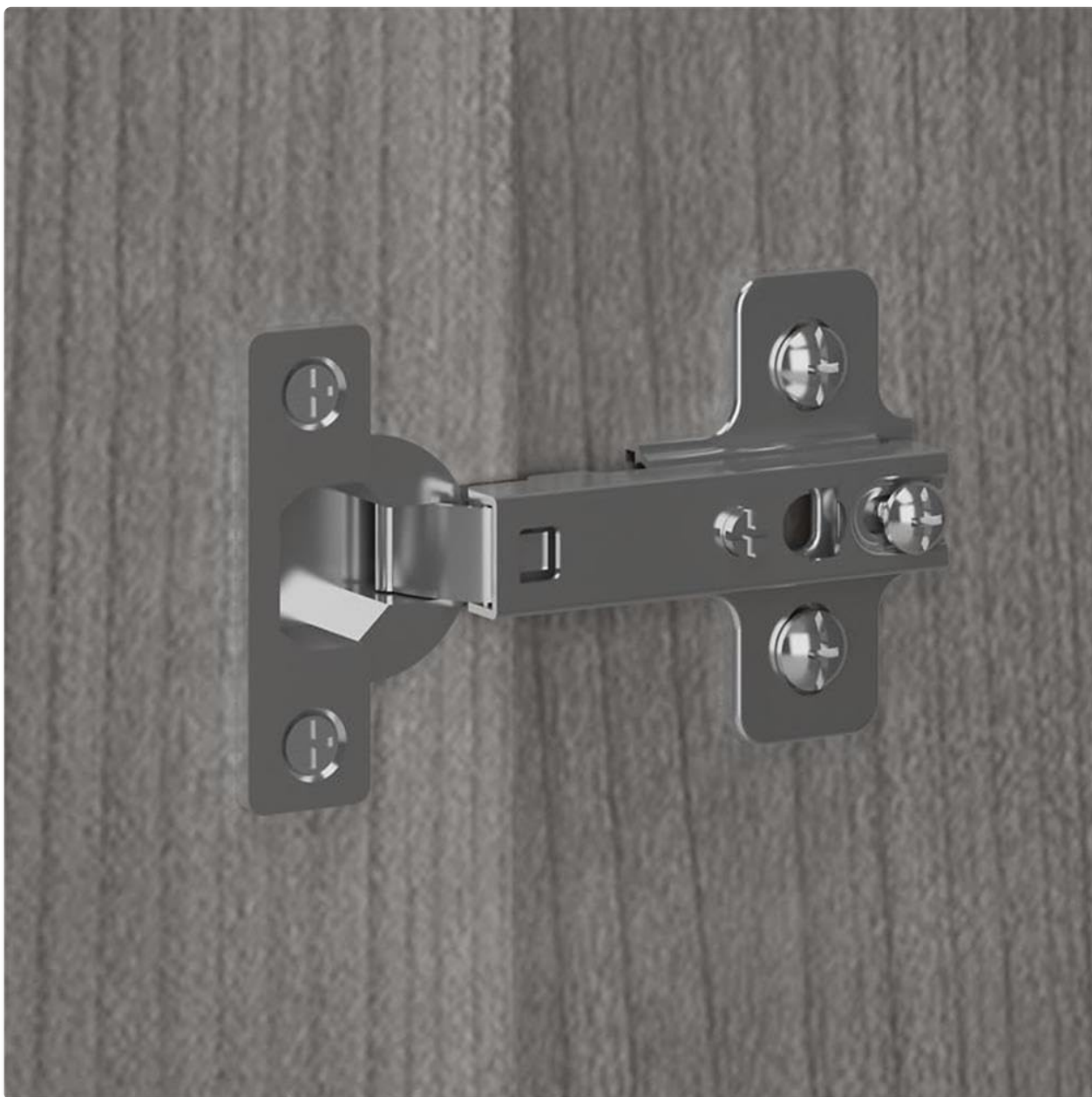
Image: Close-up of a smooth Euro-style hinge used on the cabinet doors.