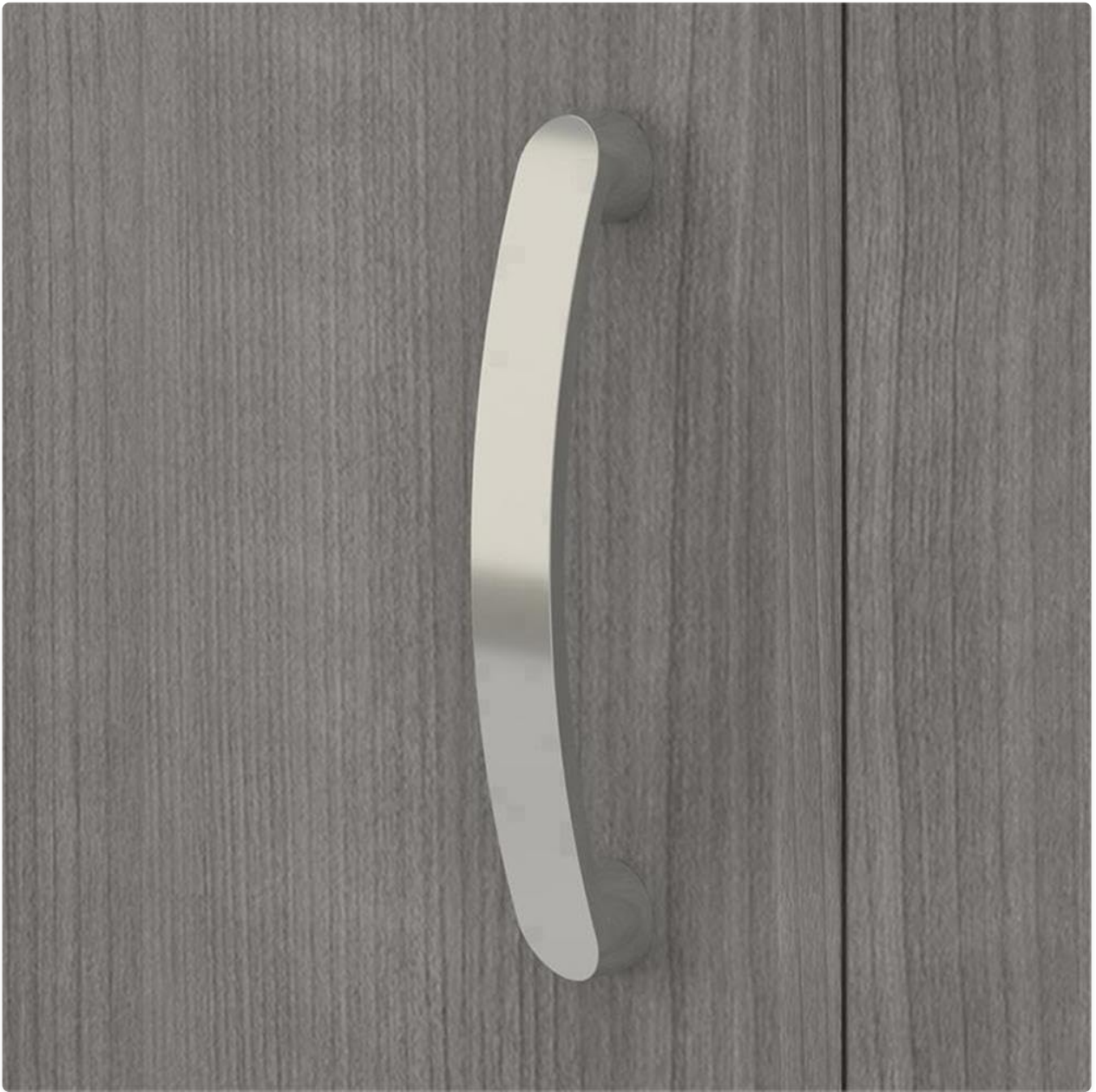
Image: Close-up of the Brushed Nickel handle on the cabinet door.