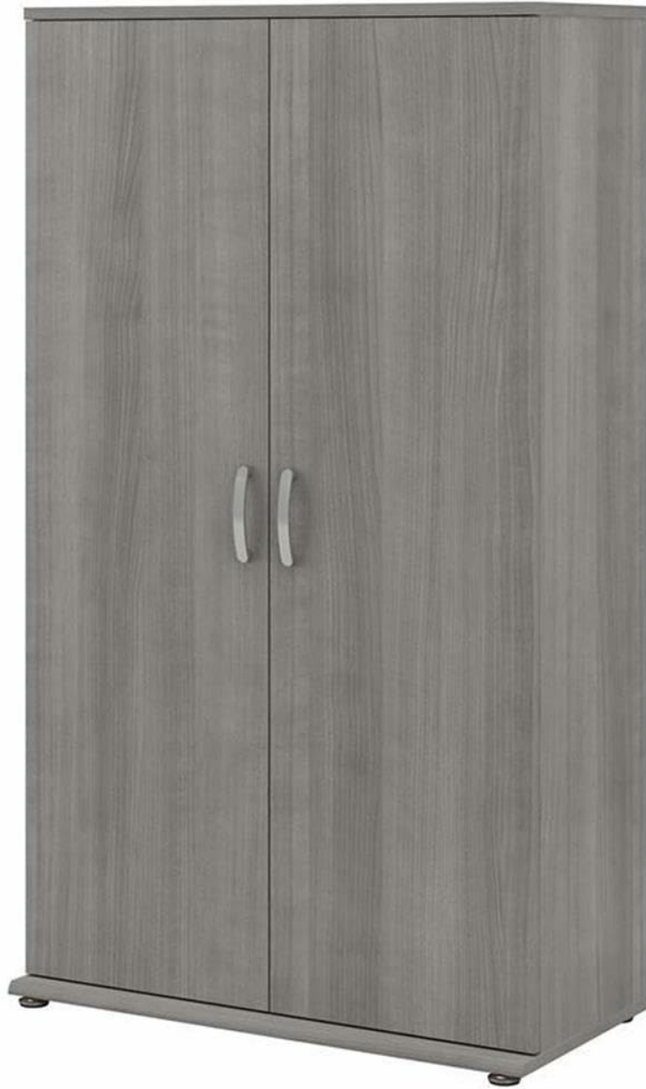
Image: The Universal Tall Storage Cabinet in a modern office setting.