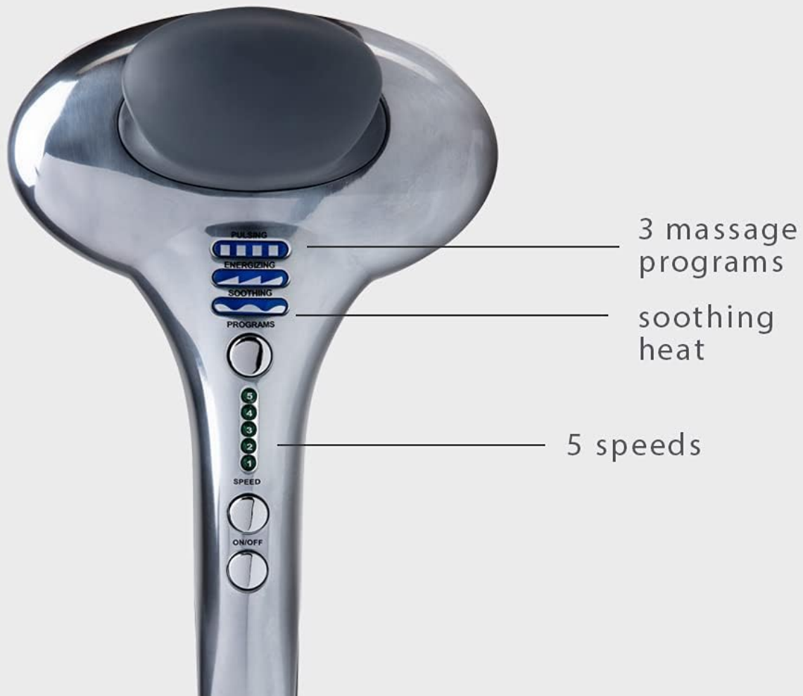
Image: The control panel features buttons for selecting massage programs and adjusting speed, along with indicator lights.

On/Off Button: Press to power the device on or off.