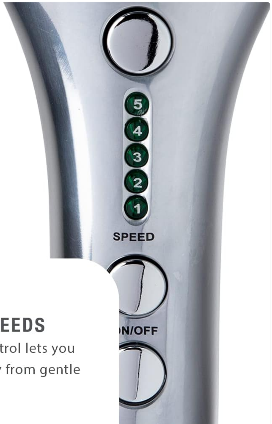
Image: The massager's speed indicator lights, allowing users to easily see and adjust the intensity from 1 to 5.

Variable speed control lets you adjust the intensity from gentle to invigorating