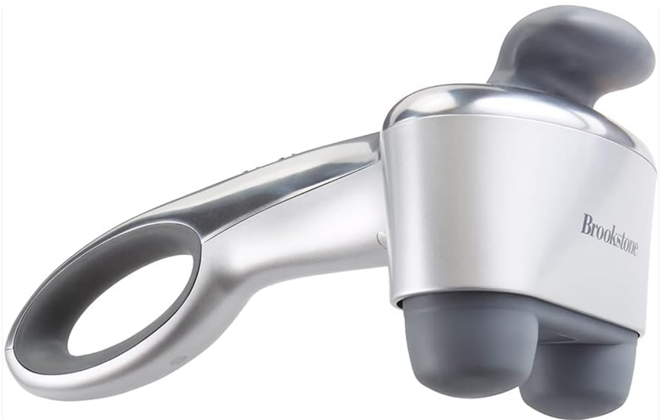
Image: The Brookstone Max 2 Cordless Percussion Massager, showcasing its sleek silver design and dual massage nodes.

The Brookstone Max 2 Cordless Percussion Massager is designed to provide targeted relief and relaxation for various muscle groups. Its lightweight and ergonomic design ensures portability and ease of use, allowing for a customizable massage experience anytime, anywhere.