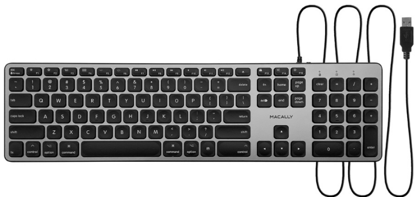
Image: An overhead view of the keyboard with its 5ft USB-A cable, emphasizing the straightforward plug-and-play connection.

Note: If your Mac only has USB-C ports, a USB-C to USB-A adapter (not included) will be required.