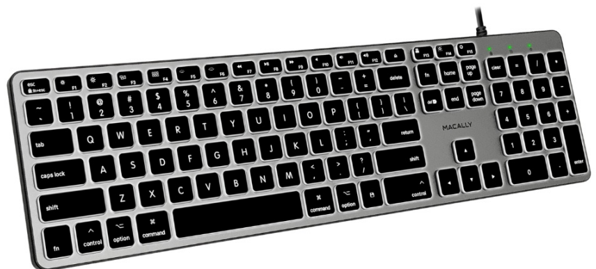
Image: The keyboard in Space Gray, designed to complement Apple devices, shown in a clean desktop setup.

Compliment your favorite Apple accessories