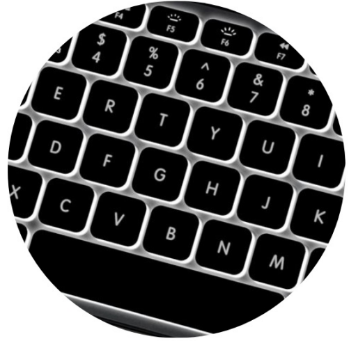
Image: A close-up of the keyboard's backlit keys, highlighting the crisp white LEDs and the three brightness level indicators.