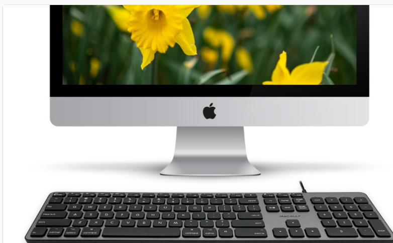
Image: A close-up of the keyboard showing Mac-specific keys and highlighting the scissor switch key mechanism for comfortable typing.

Equipped with a familiar 107-key MacOS layout featuring 16 Apple shortcut keys