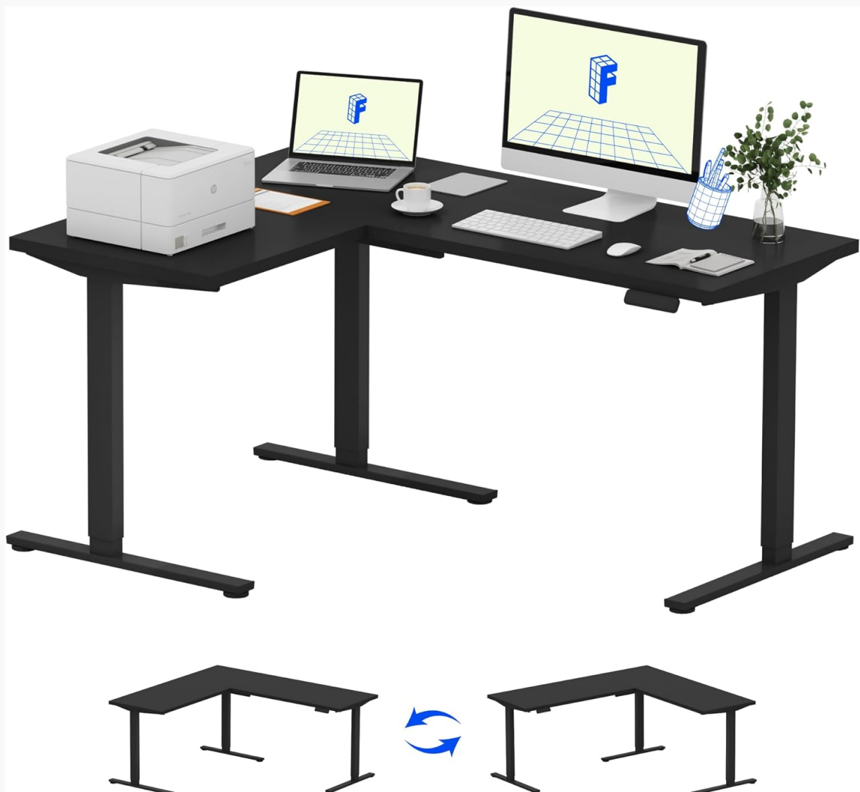
Figure 1: FLEXISPOT L Shaped Standing Desk (Black Frame + Black Top)

This manual provides comprehensive instructions for the assembly, operation, and maintenance of your FLEXISPOT L Shaped Standing Desk. Please read all instructions carefully before assembly and use to ensure safe and proper functionality. This electric height adjustable corner desk is designed to provide a versatile and ergonomic workstation for your home or office.