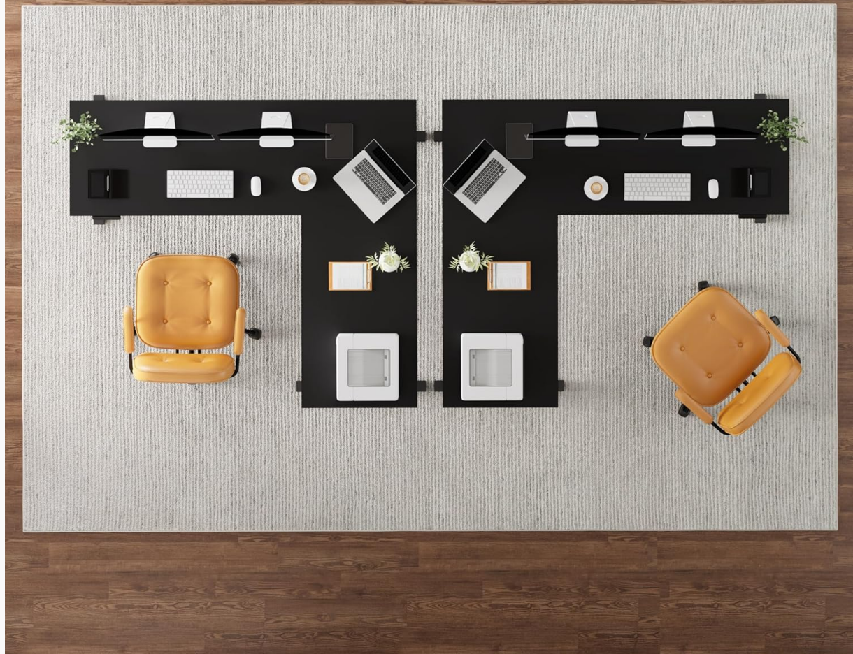
Figure 3: Flexible right/left orientation of the L-shaped desk.

L-shaped standing desk can be left-sided or right-sided, allowing for even more flexibility