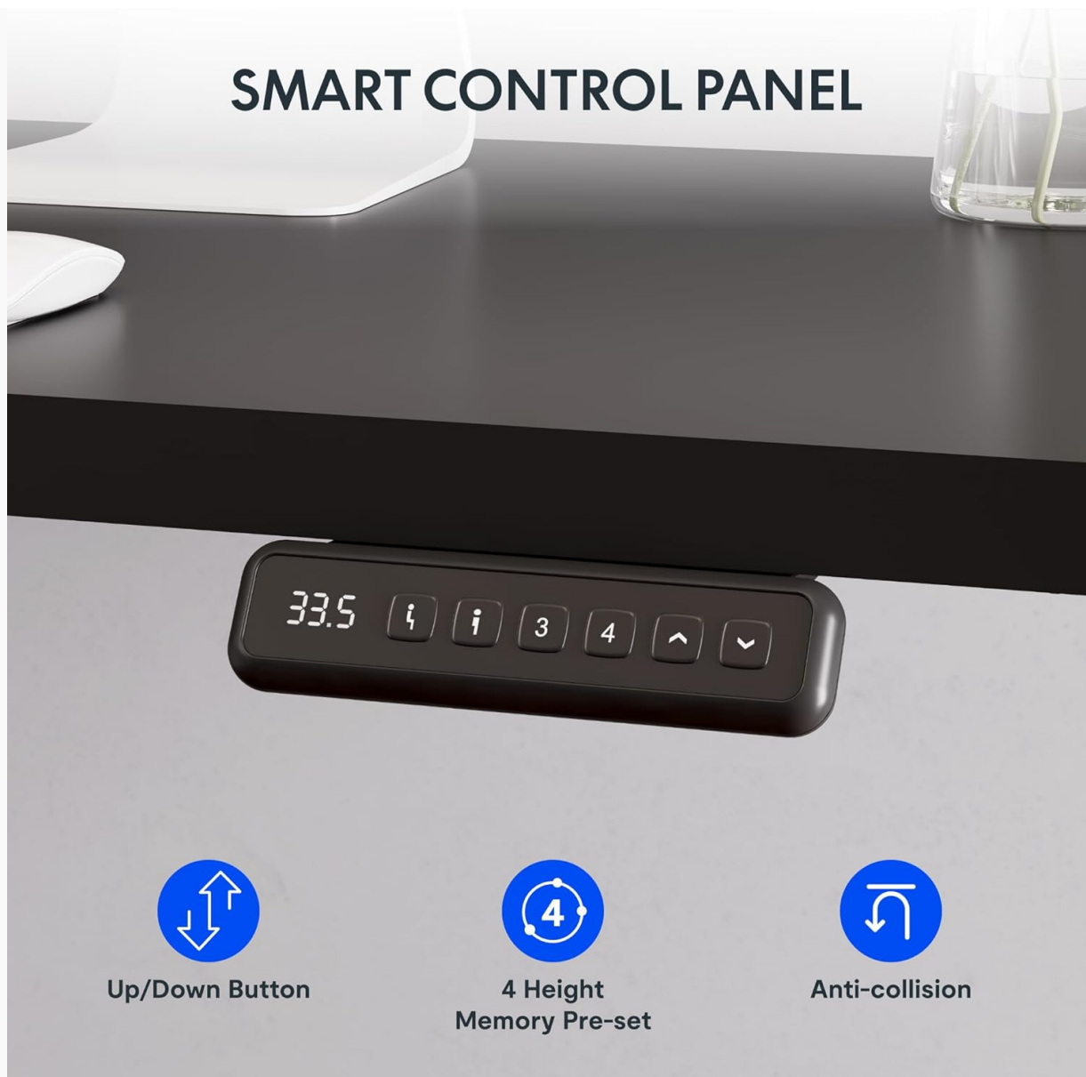
Figure 4: Smart Control Panel for height adjustment and memory presets.