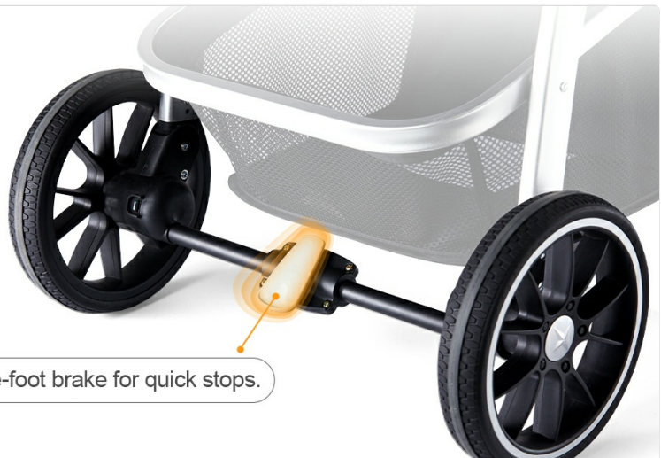
Figure 5.4: Engaging the one-foot brake for secure parking.