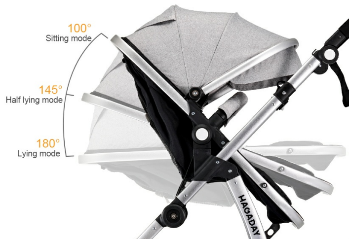
Figure 5.2: Ergonomic seat recline positions for optimal comfort.