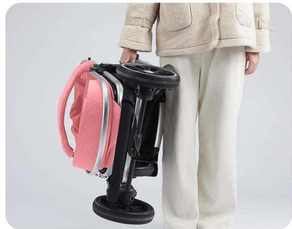
Figure 5.5: Step-by-step guide to folding the stroller for storage.