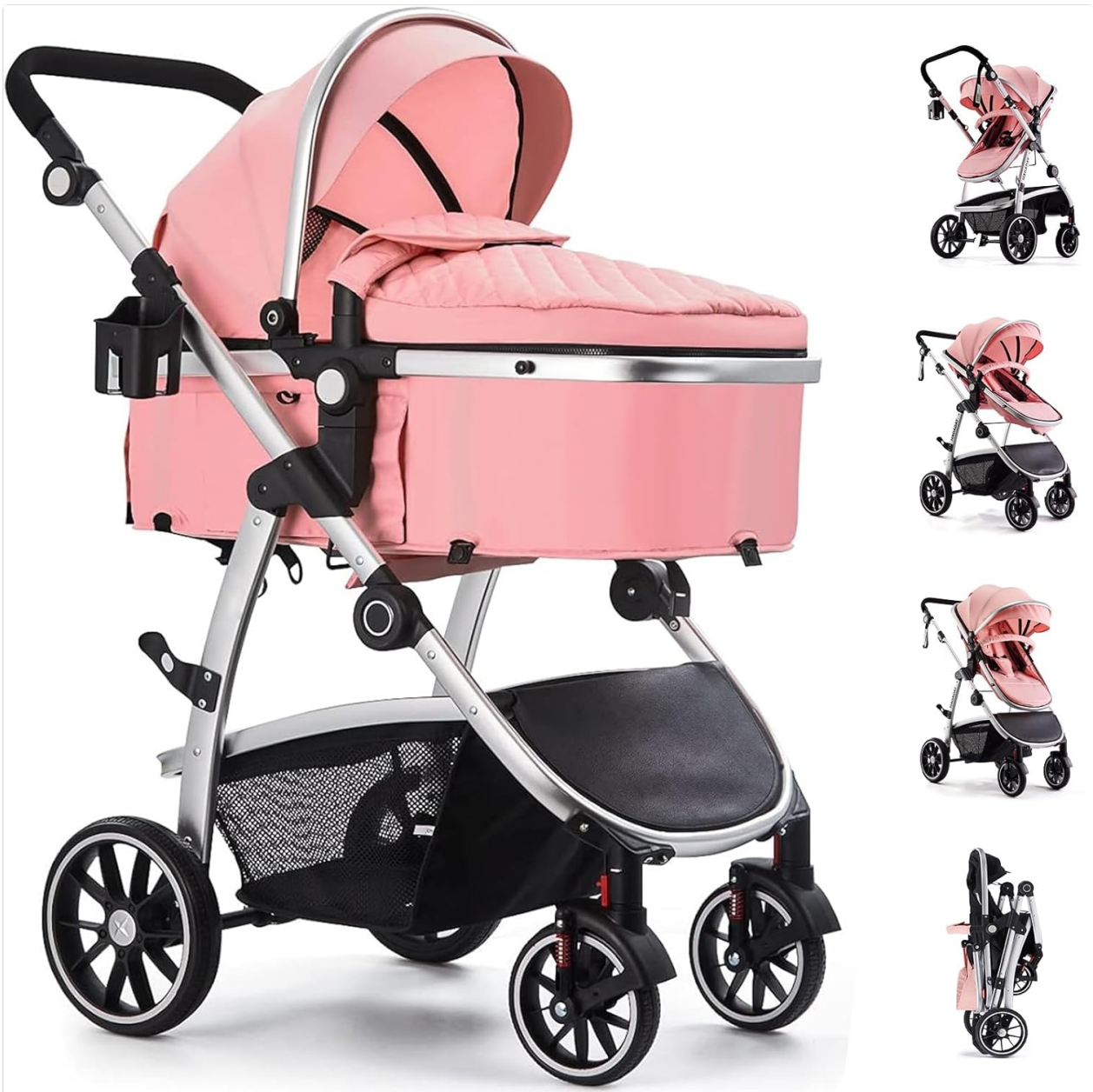
Figure 4.1: Fully assembled Hagaday SK20 Stroller in bassinet mode.