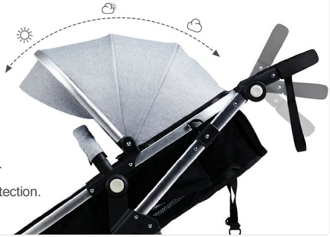
Figure 5.3: Adjustable three-tier sunshade canopy with UPF50+ protection.