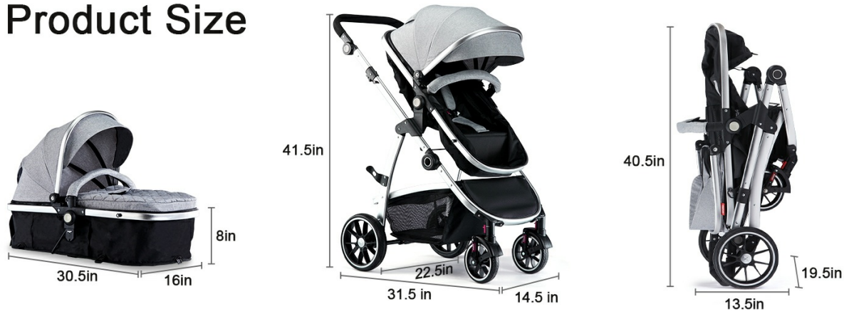
Figure 8.1: Product dimensions in various configurations.