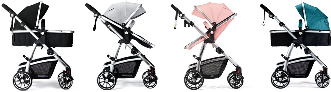
Figure 5.1: Illustration of the 2-in-1 reversible seat functionality.

Easily switch between bassinet and seated modes, facing parents or facing the world.