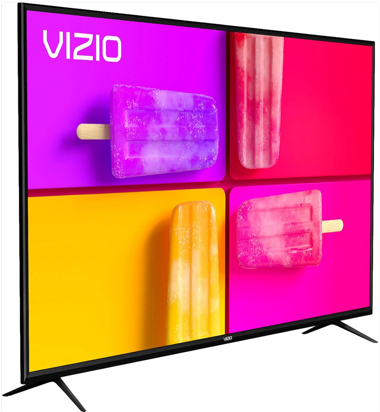
Figure 1: Front view of the VIZIO V-Series Smart TV.