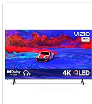
Figure 6: VIZIO TV optimized for gaming, showcasing the IQ Active Processor and V-Gaming Engine.

For an optimized gaming experience, the V-Series TV incorporates the V-Gaming Engine. This feature provides sub 10ms input lag, 4K 48-60 fps Variable Refresh Rate (VRR), and Auto Game Mode. Access the dedicated gaming menu for quick adjustments to settings that enhance gameplay.