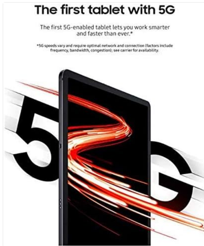
Image: Front view of the Samsung Galaxy Tab S7 tablet.