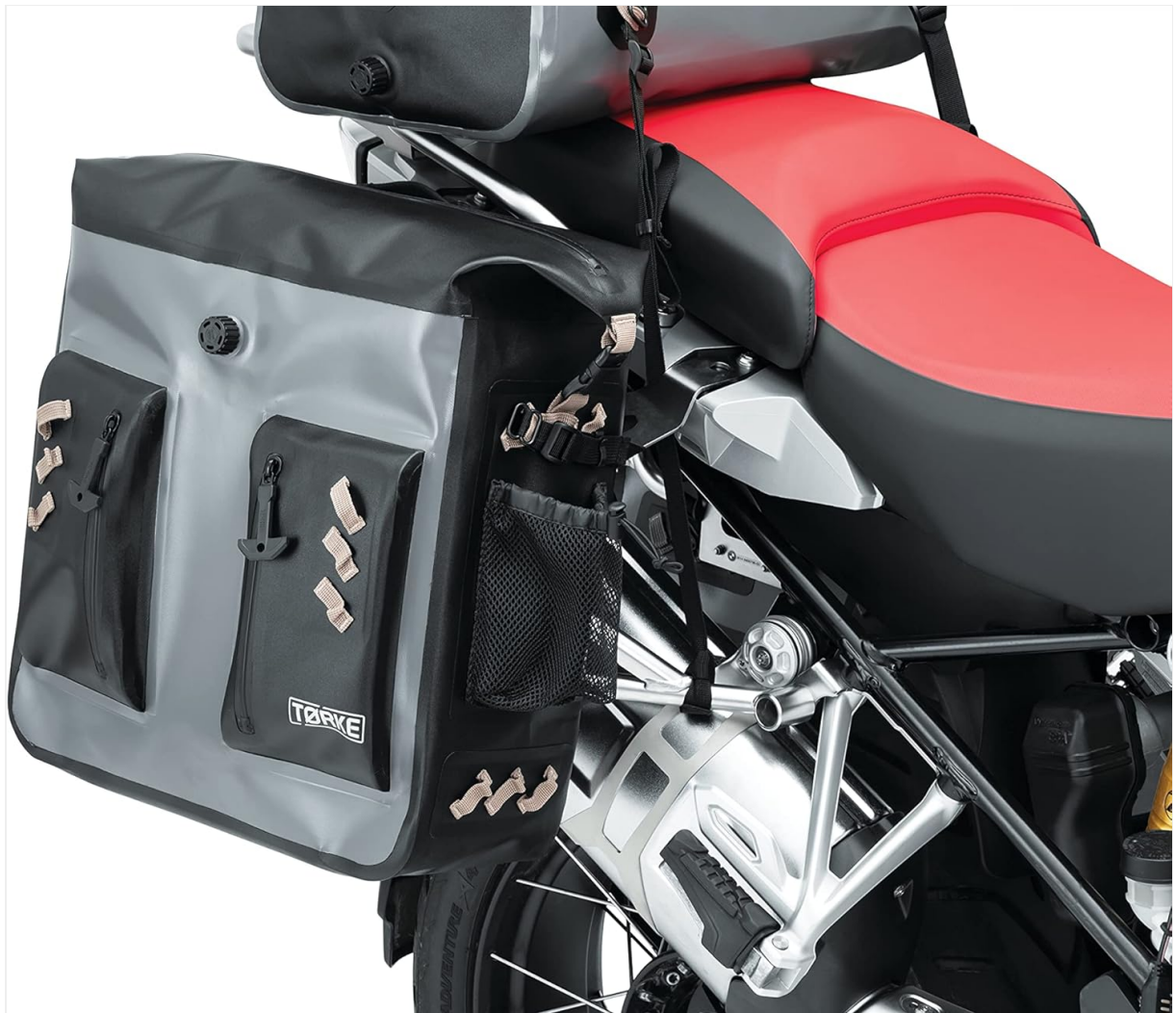
Figure 5: Pannier mounted with external cargo net.