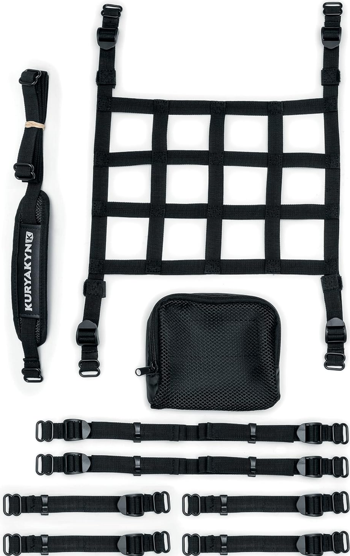
Figure 1: Included accessories for the Tørke 24L Solo Dry Pannier.