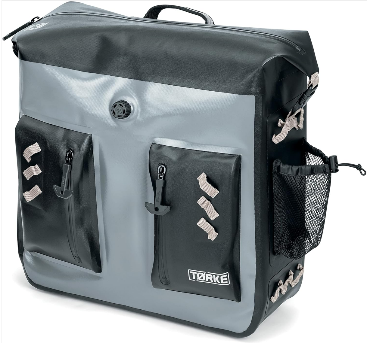
Figure 2: Kuryakyn Tørke 24L Solo Dry Pannier.