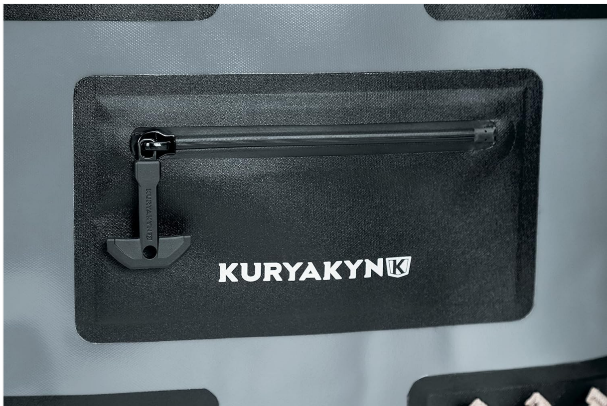
Figure 6: Waterproof zipper detail.