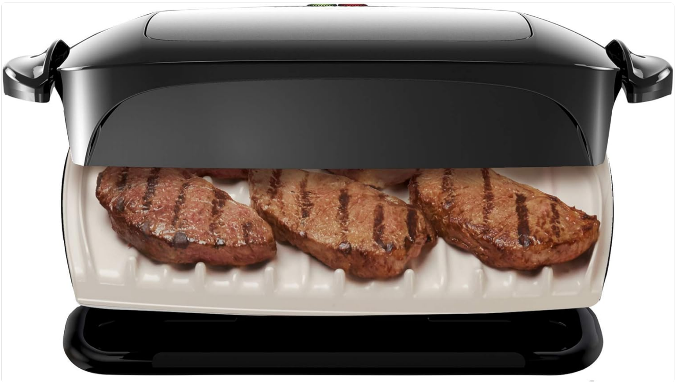
Image: The George Foreman Grill open, showing three steaks cooking on the grill plates, with fat dripping into the tray below.