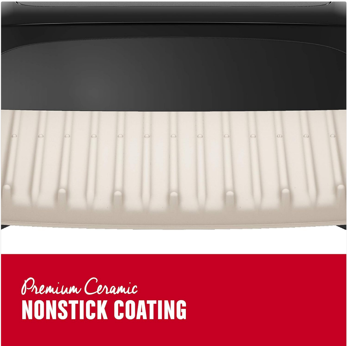
Image: A close-up view of the grill plate, highlighting the premium ceramic nonstick coating and ribbed design.