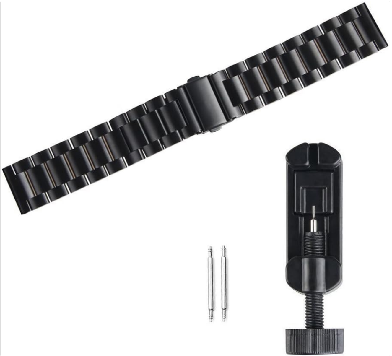
Image: The band, quick-release pins, and the link removal tool.