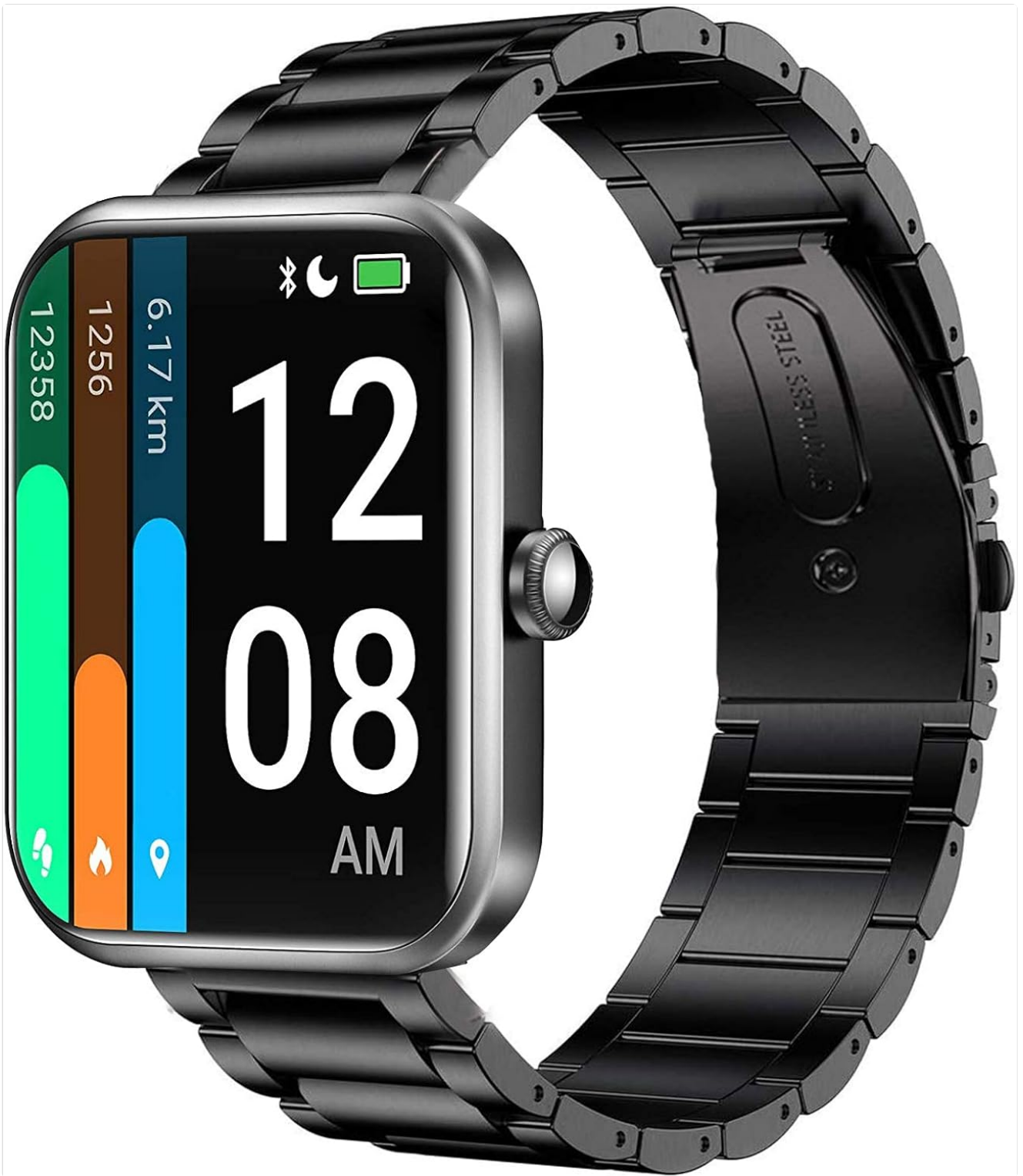
Image: The YOUkei ID206 stainless steel band shown attached to a compatible smartwatch.