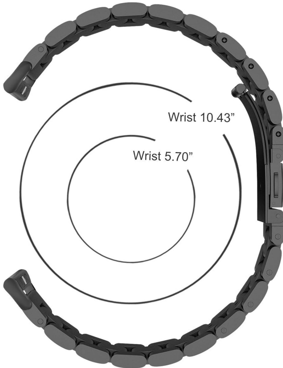
Wrist circumference range for band adjustment.

Fit 145-265mm(5.70"-10.43") wrist with adjustable magnetic clasp