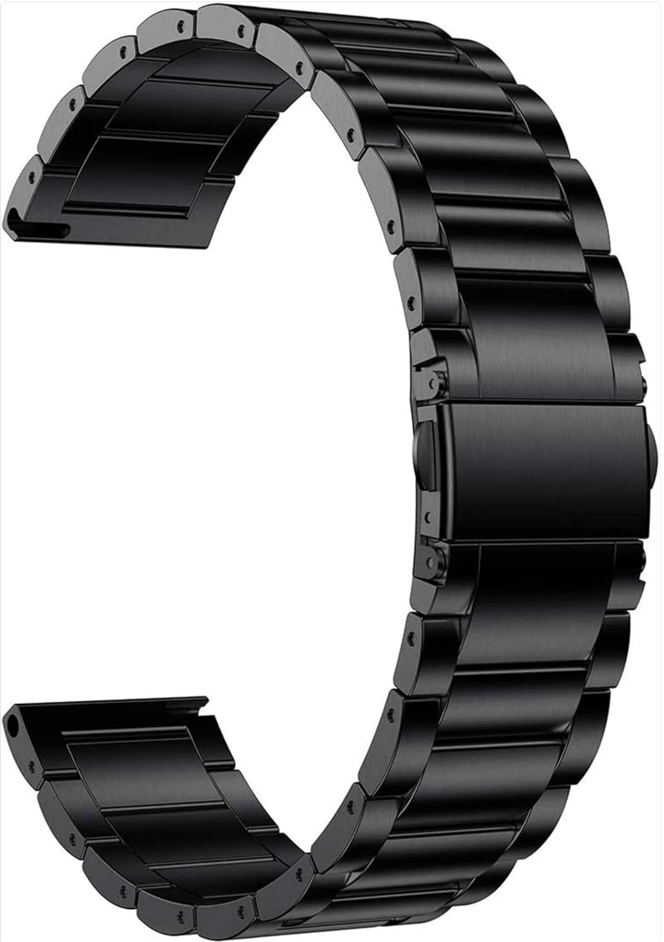
Image: Detailed view of the stainless steel replacement band.