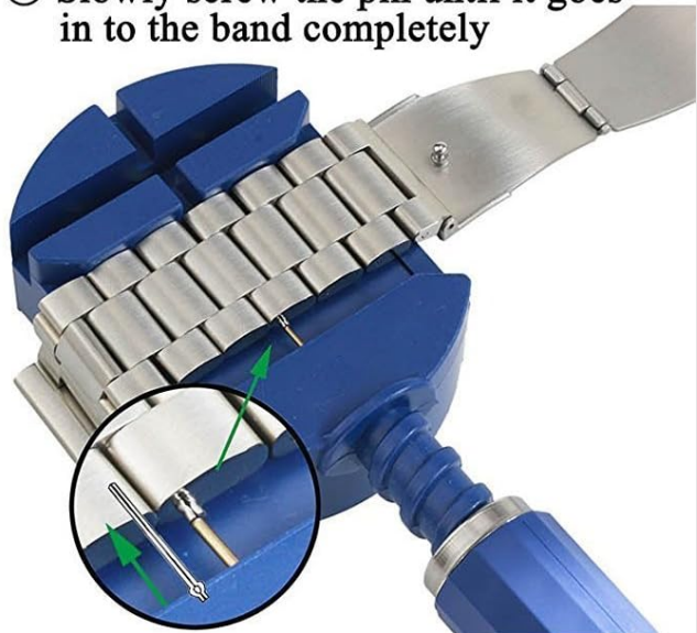
Image: The quick-release pins for easy band attachment.

④ Slowly screw the pin until it goes in to the band completely