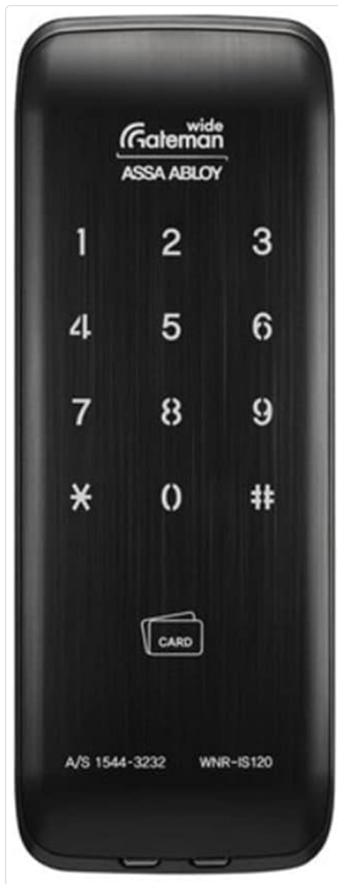
Figure 5.1: Front view of the Gateman WNR-IS120 Digital Door Lock, showing the numeric keypad (1-9, *, 0, #) and the 'CARD' icon for card key authentication. The model number WNR-IS120 is visible at the bottom right.