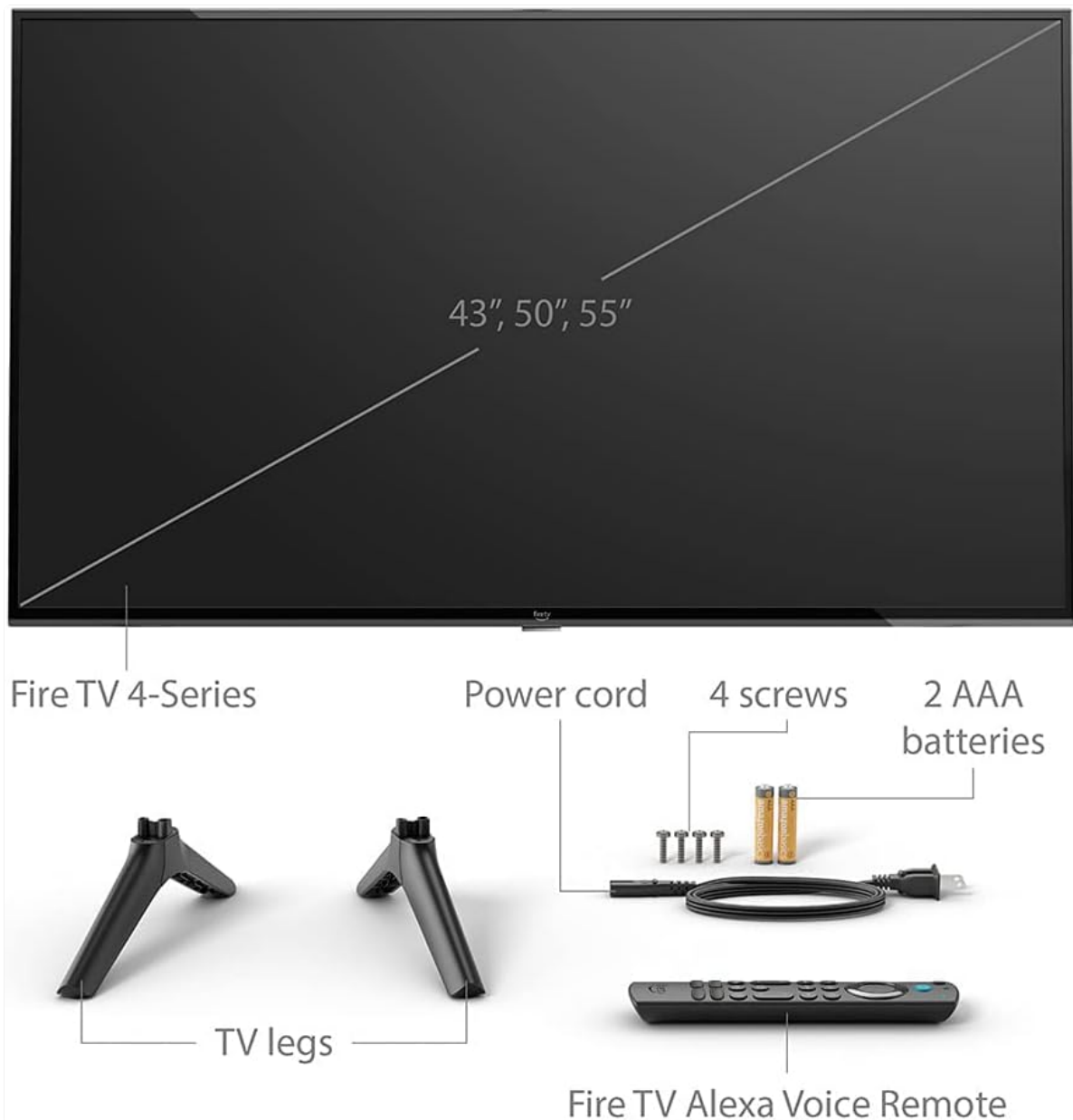
Image: All components included in the Amazon Fire TV 4-Series package.