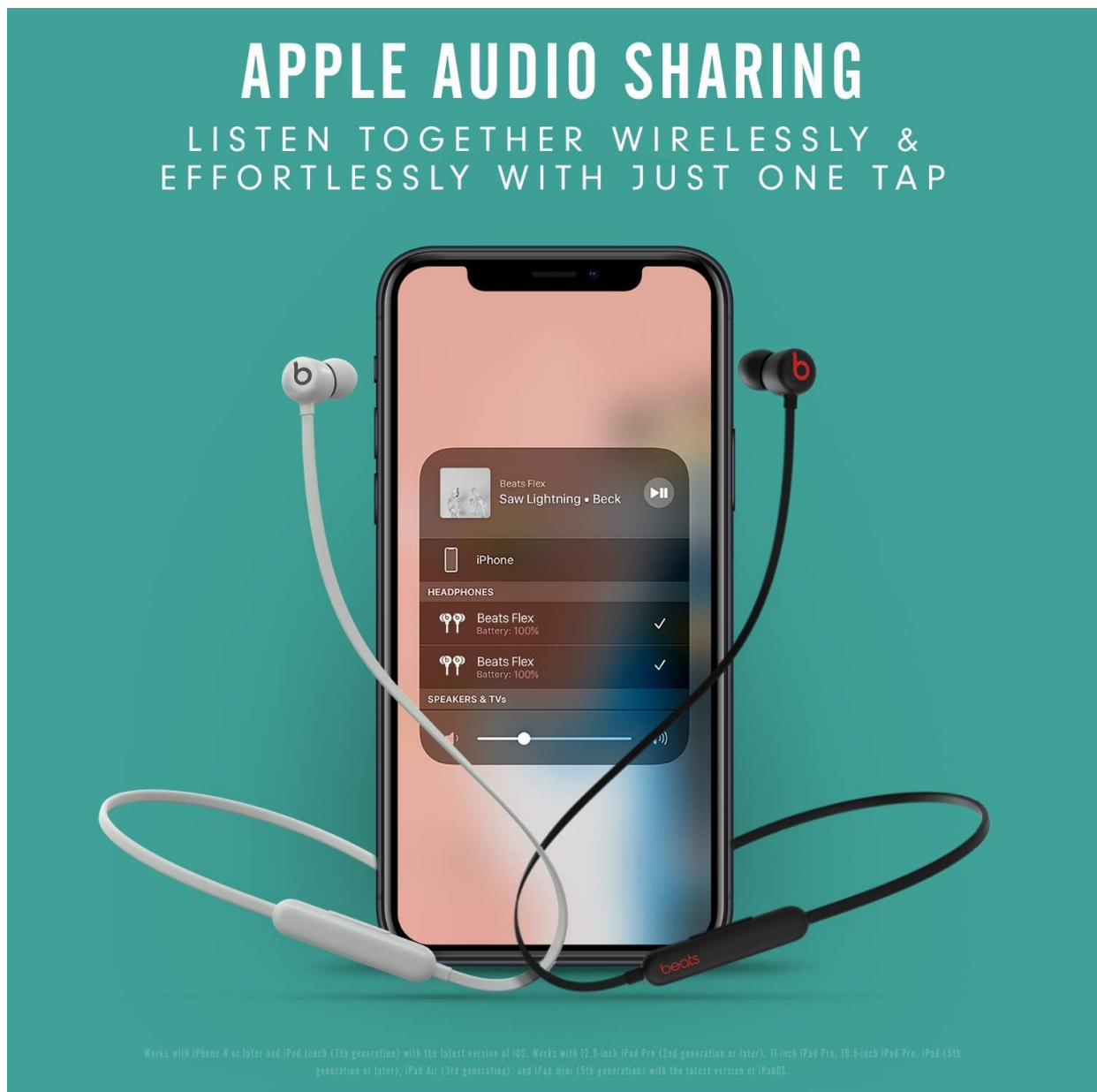
Image: Demonstrates the Apple Audio Sharing feature with Beats Flex.