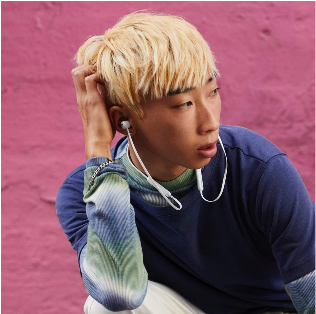
Image: A user wearing Beats Flex, illustrating the design and fit.