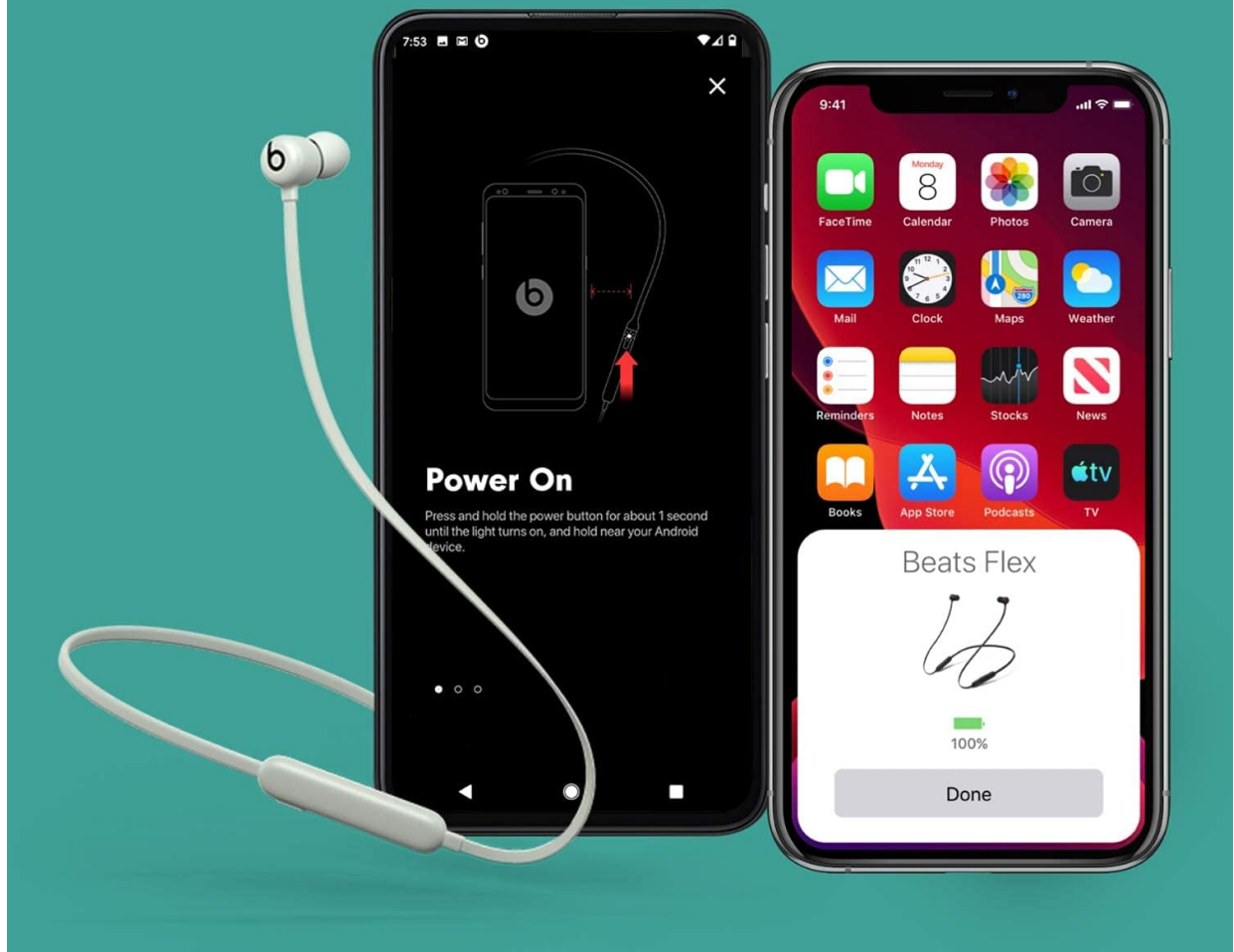
Image: Demonstrates the pairing process for Beats Flex with both Apple and Android devices.