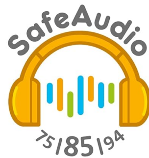
Image: A close-up view of the white BuddyPhones Play Plus earcup, highlighting the volume control buttons and the 'SafeAudio 75/85/94' logo, indicating the volume limiting feature.