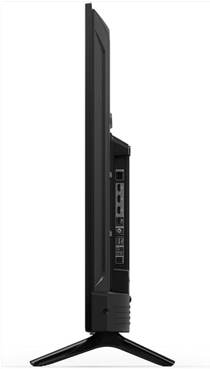
Figure 1.2: Side view of the Amazon Fire TV 4-Series smart TV, illustrating its slim profile.