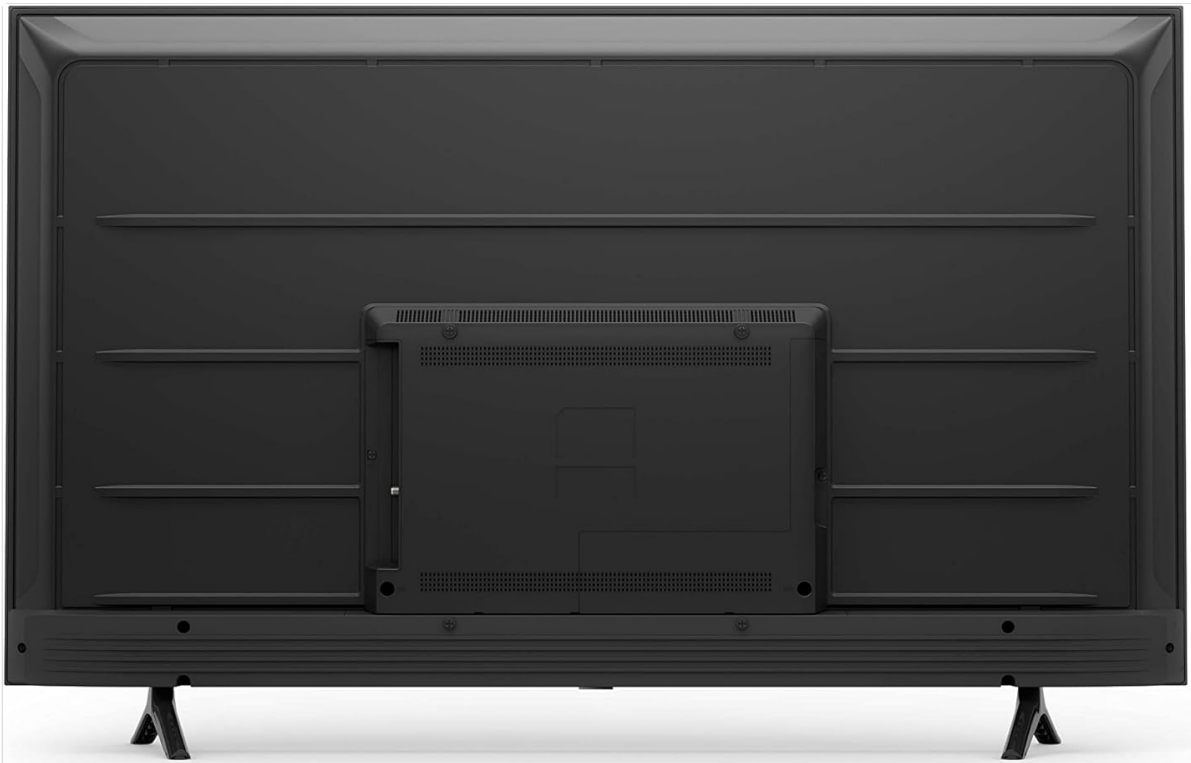
Figure 2.2: Rear view of the Fire TV, indicating VESA mounting points.