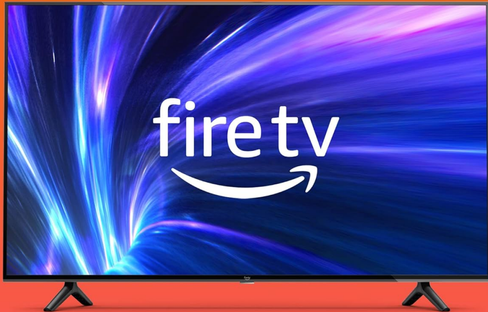
Figure 1.1: Front view of the Amazon Fire TV 4-Series 55-inch smart TV.

A TV experience that's always getting smarter