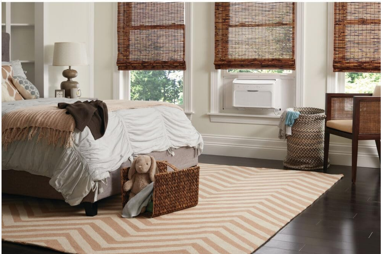
The air conditioner properly installed in a window opening.

This window air conditioner is designed for standard window installation. Ensure your window dimensions meet the requirements for secure placement. The unit requires a 115V power outlet. For optimal performance and safety, follow the detailed installation instructions provided in the packaging.