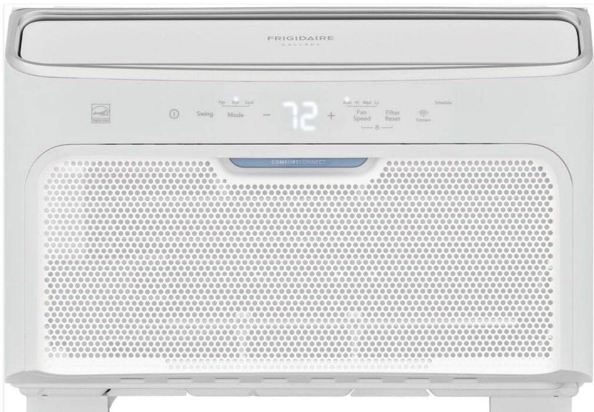
The Frigidaire Gallery 10,000 BTU Smart Inverter Window Air Conditioner.

This manual provides essential information for the safe and efficient operation of your Frigidaire Gallery 10,000 BTU Smart Inverter Window Air Conditioner and Dehumidifier. Please read all instructions carefully before installation and use. This appliance is designed to provide consistent, energy-efficient cooling and dehumidification for rooms up to 450 sq. ft.