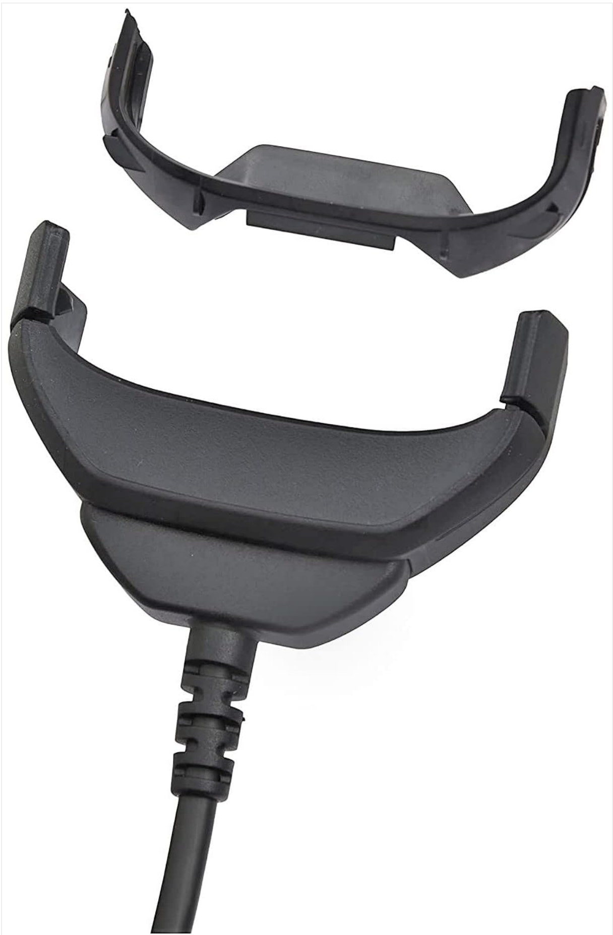
Image: A close-up view of the removable insert, highlighting its design and how it fits into the charging cradle.