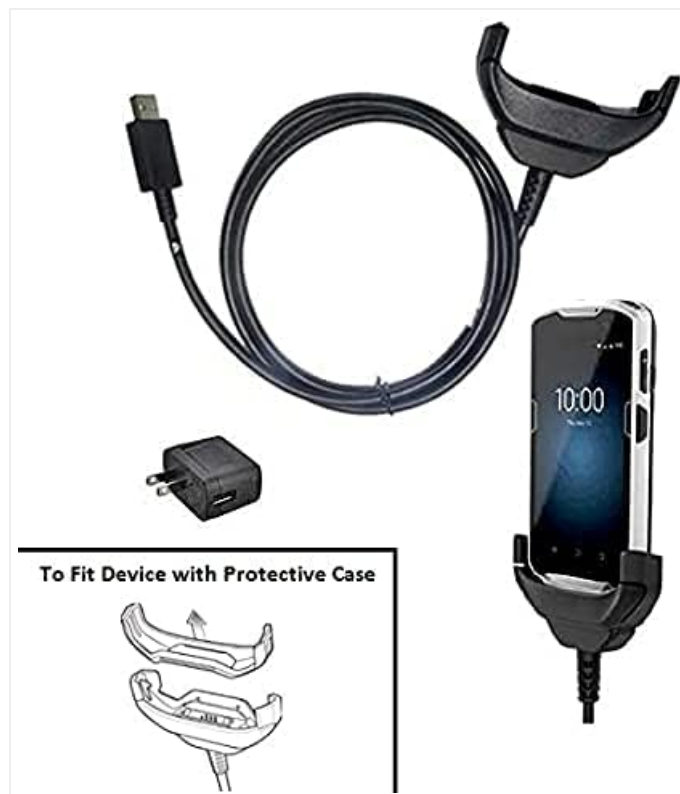
Image: A detailed view of the Generic charger cradle, highlighting its design.

The Generic charger is designed to provide reliable power to your Zebra TC51, TC52, TC56, TC57, TC52x, and TC57x Android Scanners. It features a removable insert to accommodate devices with or without a protective boot/case.