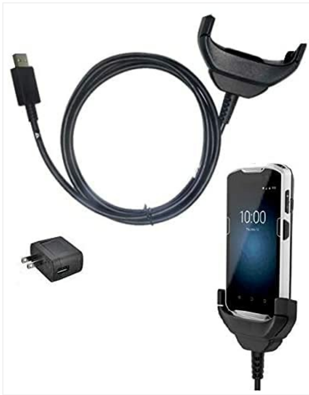
Image: The Generic charging cradle and power supply, shown with a compatible Zebra scanner for illustration.