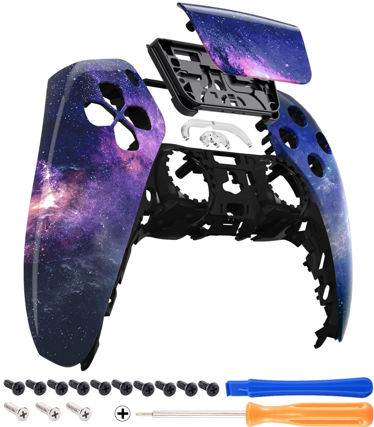
Image: Exploded view of the eXtremeRate Nebula Galaxy replacement shell components and the tools provided for installation.

Note: The PS5 controller and any other internal parts are not included.