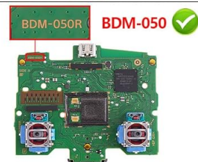
Image: Visual guide for distinguishing PS5 controller BDM models by R2 trigger components.