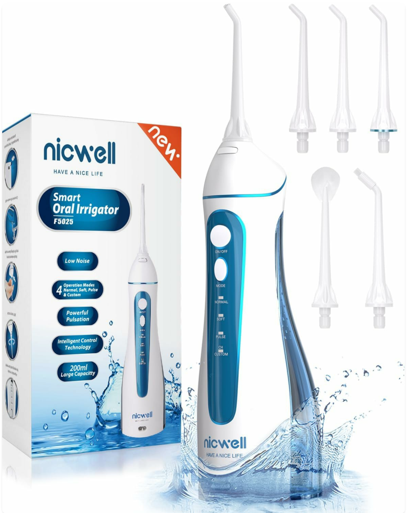
Figure 1: Nicwell W01/F5025 Cordless Water Dental Flosser (White model shown).