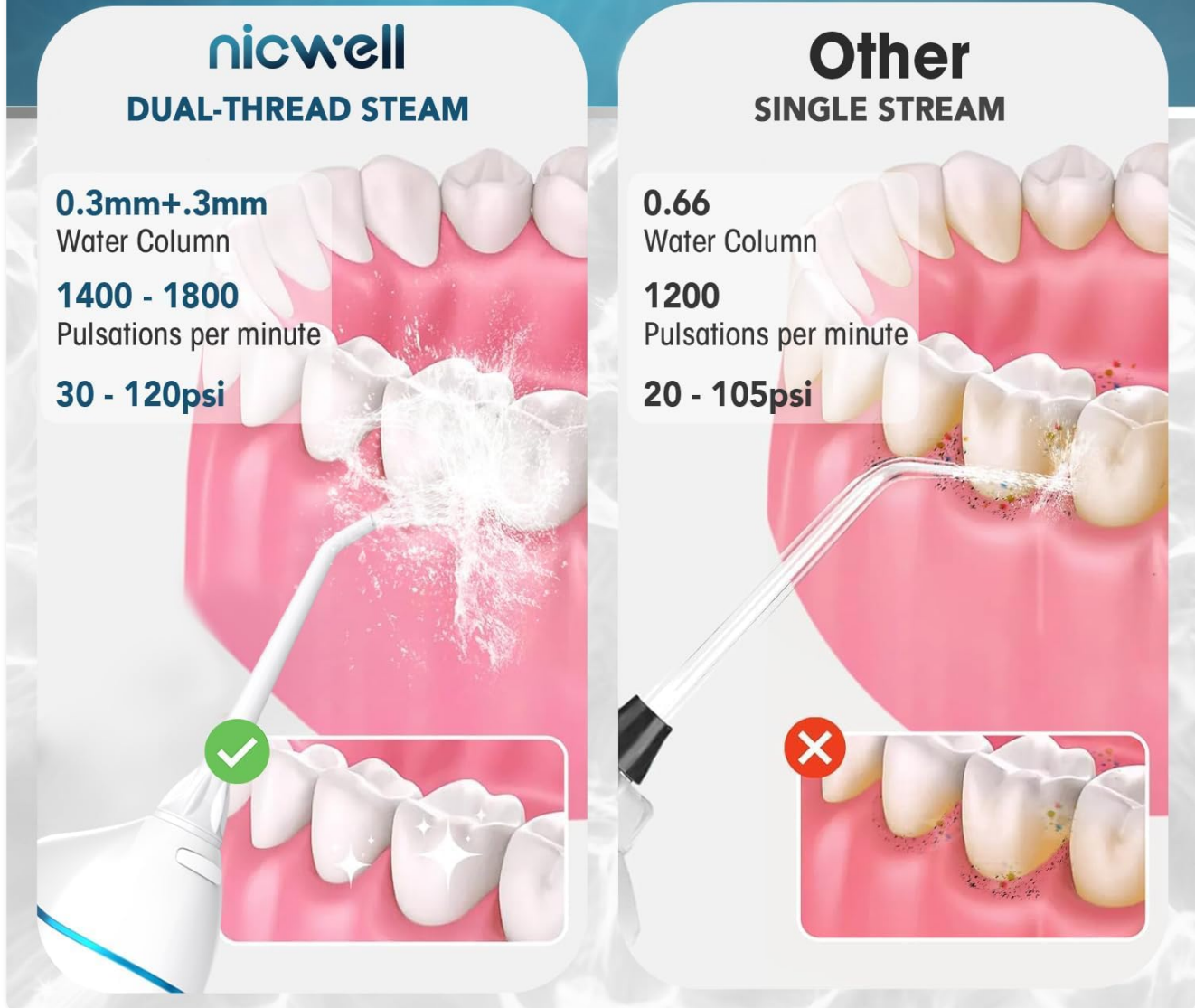
Figure 3: The Nicwell Water Dental Flosser comes with multiple interchangeable jet tips for different oral care needs.