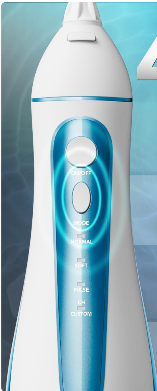
Figure 5: The control panel displays the four operation modes: Normal, Soft, Pulse, and Custom.