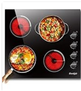
Figure 6: An image of the cooktop with a pot of pasta, showing the "H" indicator lit on one of the burners. This signifies the "Anti-Scald" feature, reminding users not to touch the hot surface to avoid burns.