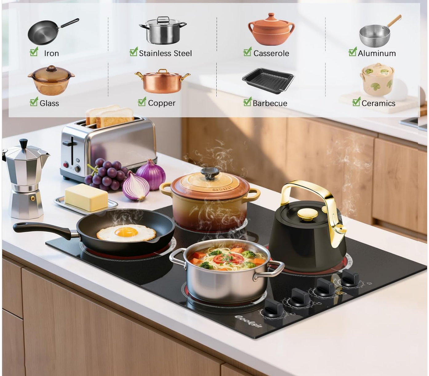
Figure 7: An image displaying a variety of cookware types, such as iron, stainless steel, casserole, aluminum, copper, glass, and ceramic, all marked as suitable for use with the Cooksirr electric stovetop.