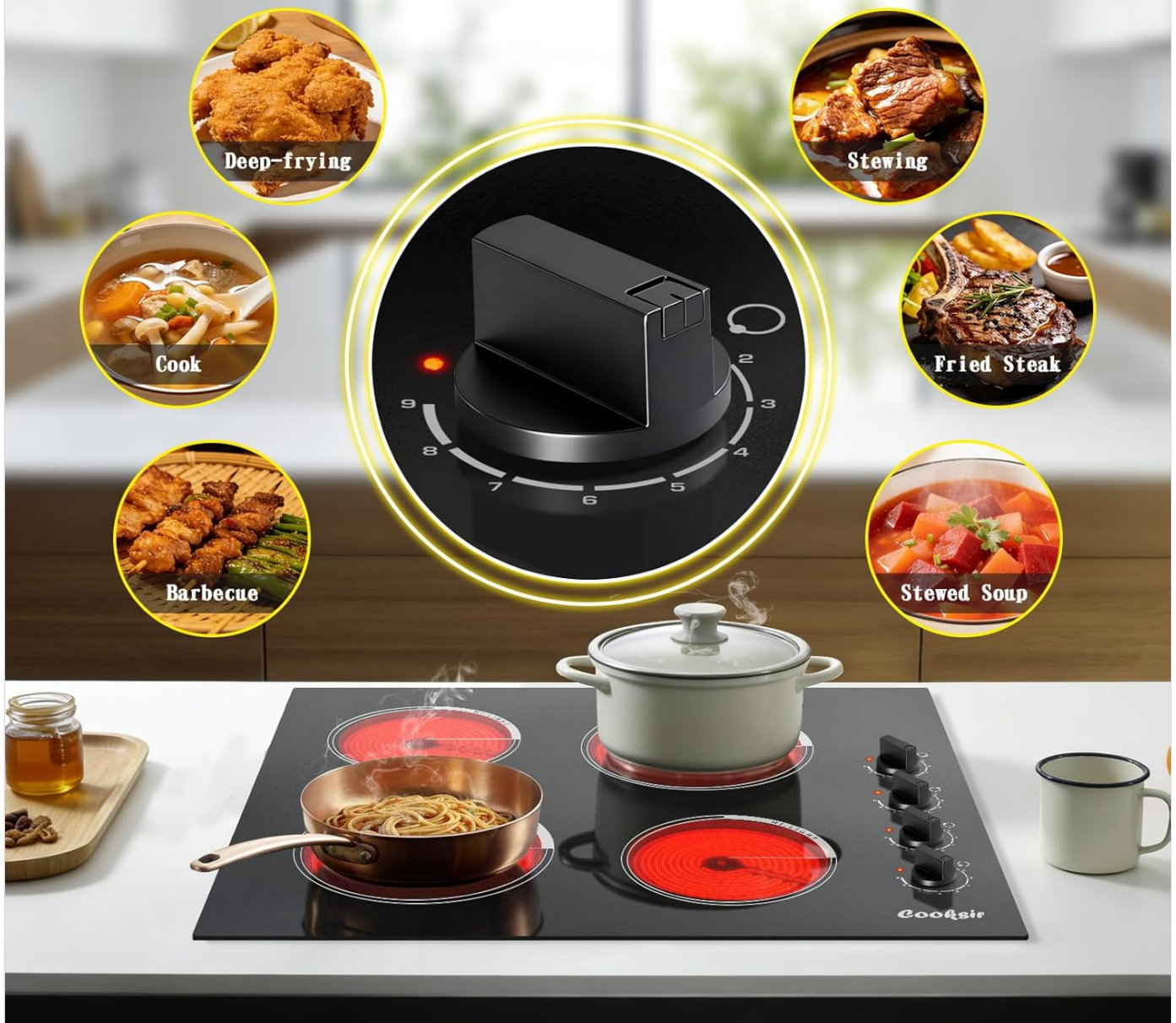
Figure 4: A detailed view of the cooktop's knob controls, highlighting their simple operation. Surrounding the central knob are images of different cooking methods like deep-frying, stewing, cooking, fried steak, barbecue, and stewed soup, indicating the versatility of the cooktop.

Easily control the power, cook more delicious meal for your family