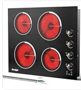
Figure 3: An illustration showing the various components included in the product package: the electric cooktop, sealing tape, four mounting brackets, and the user manual.