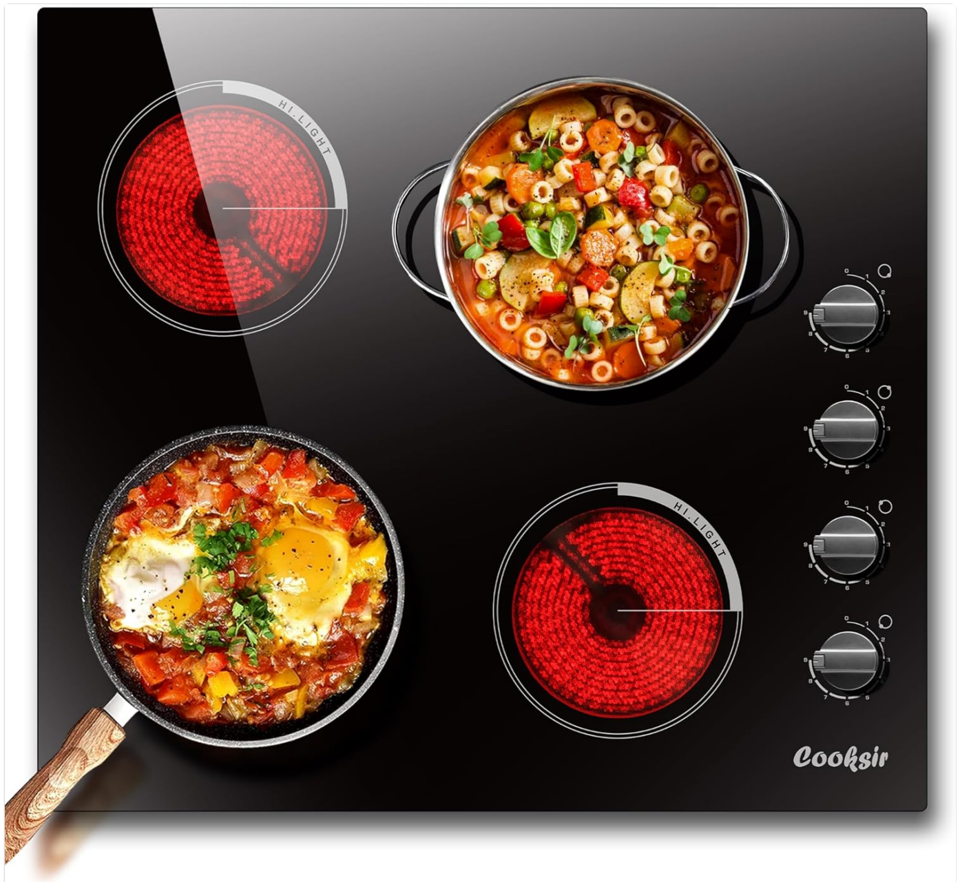
Figure 1: Top view of the Cooksir 24 Inch Electric Cooktop, showcasing its sleek black glass surface, four circular heating elements, and four control knobs located on the right side. Two pots are shown on the active burners, illustrating its use.