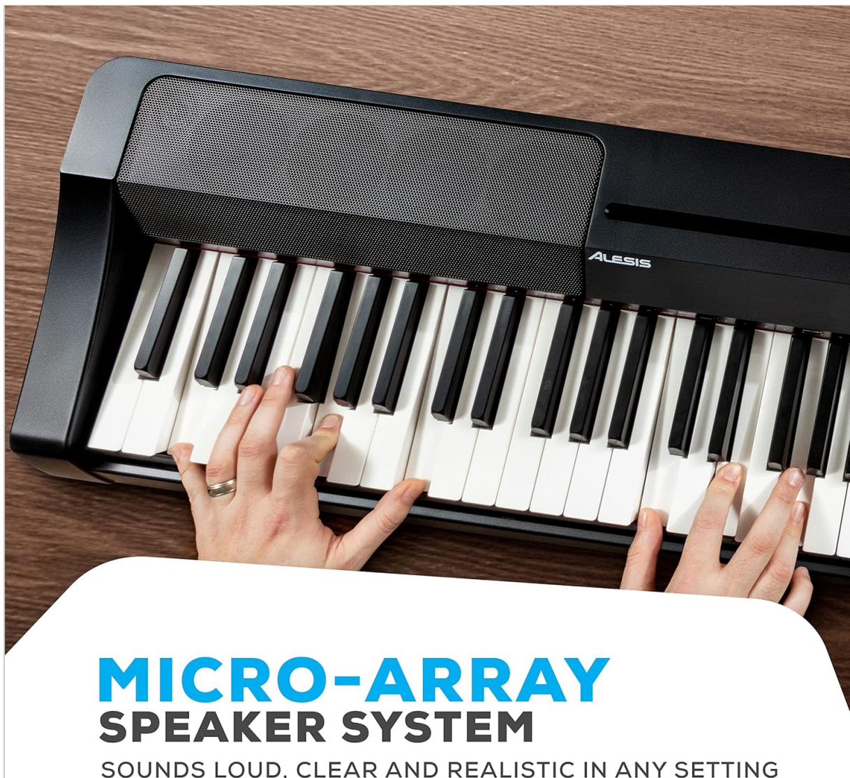
Image: A detailed view of the Alesis Recital Grand's micro-array speaker system, designed to deliver clear and powerful audio output.