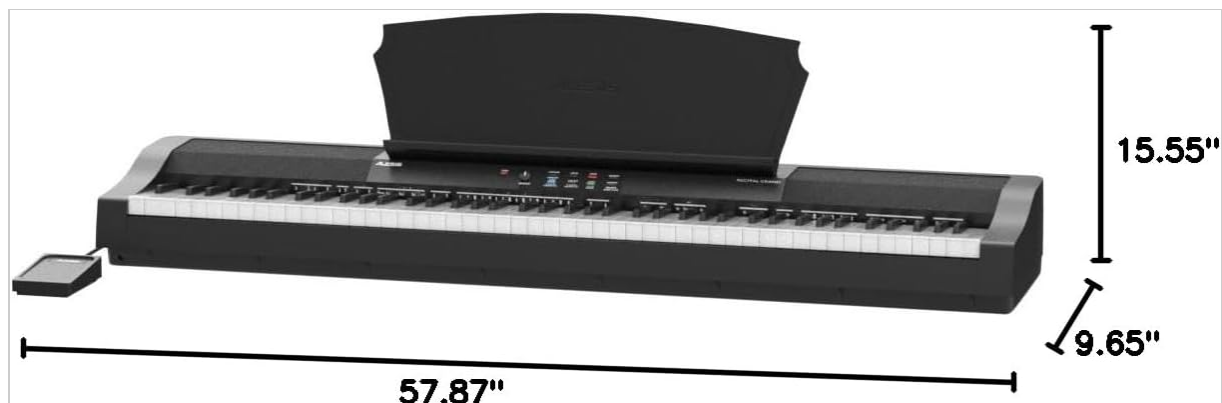
Image: A diagram illustrating the physical dimensions of the Alesis Recital Grand digital piano, including its length, width, and height.