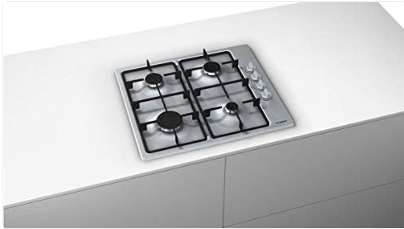
Figure 1: Overview of the Bosch PBP6C5B60Q Gas Hob installed in a kitchen countertop.