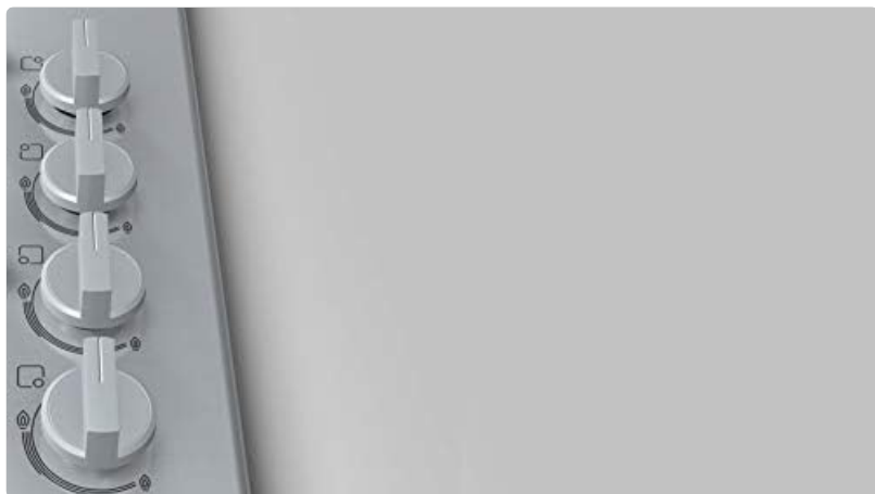
Figure 3: Integrated control knobs for burner control.