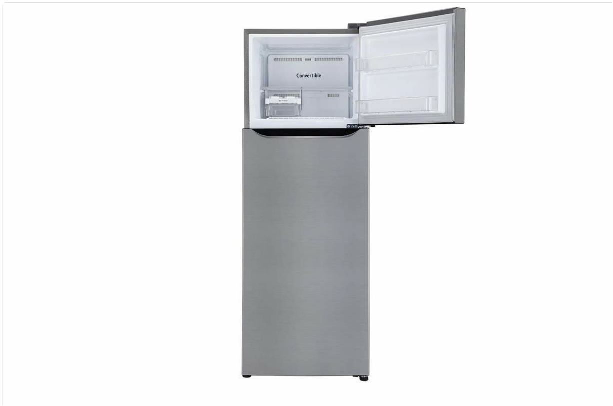
Figure 3.3: Interior view of the freezer compartment, including the Convertible box and ice tray.