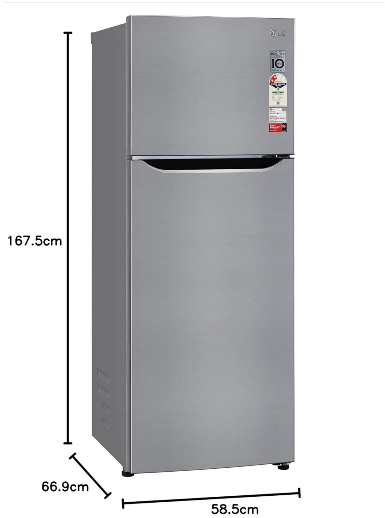
Figure 8.1: Product dimensions (Depth x Width x Height).