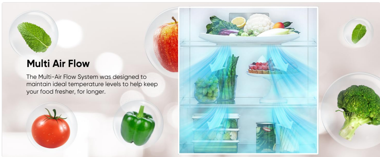
Figure 5.2: Multi Air Flow system distributes cool air evenly to maintain optimal freshness.