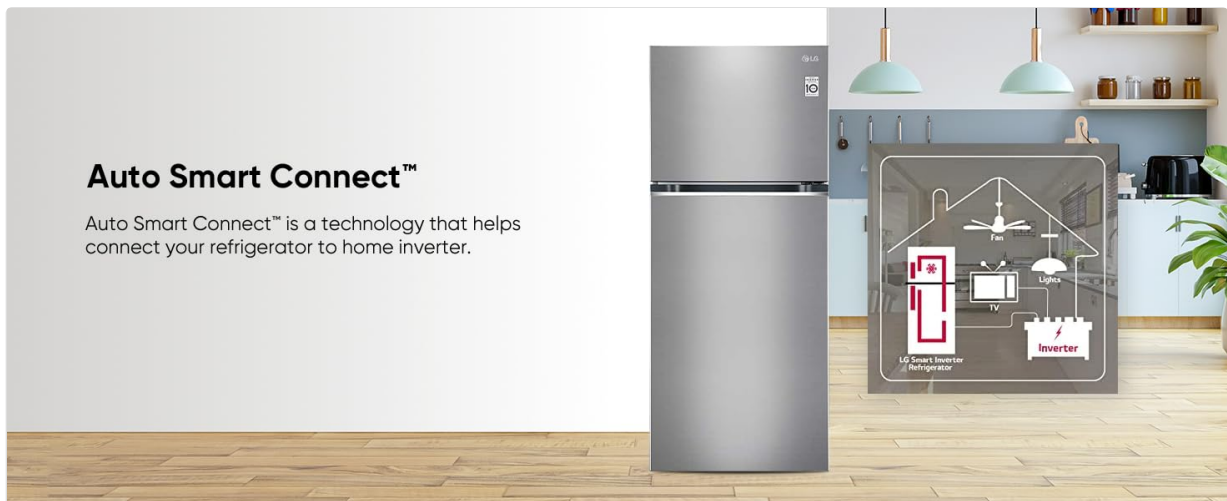
Figure 5.3: Smart Connect enables the refrigerator to run on a home inverter during power outages.

The Smart Connect feature allows your refrigerator to operate on a home inverter during power cuts. Connect the refrigerator to your home inverter system as per the inverter manufacturer's guidelines. This ensures continuous cooling and food preservation.