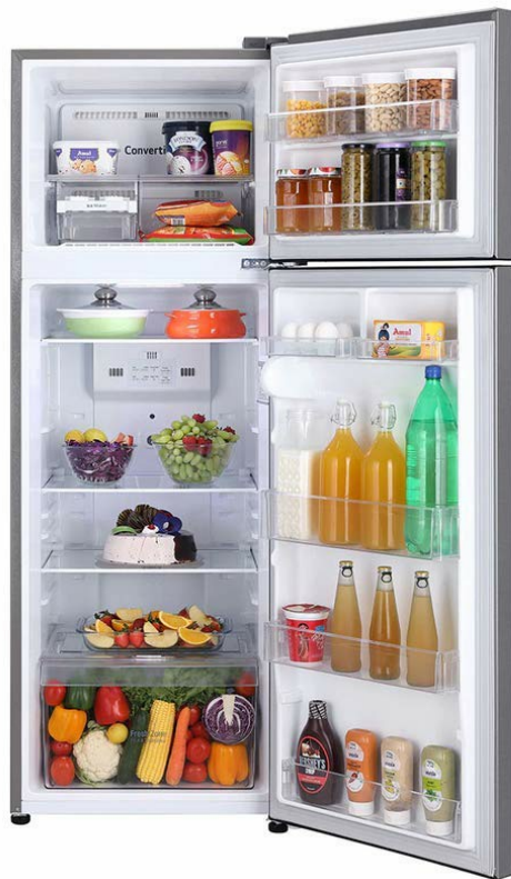
Figure 3.2: Interior view of the fresh food compartment, showing adjustable shelves, vegetable tray, and door bins.