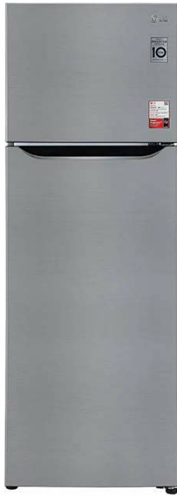
Figure 3.1: Front view of the LG GL-S322SPZY refrigerator in Shiny Steel finish.