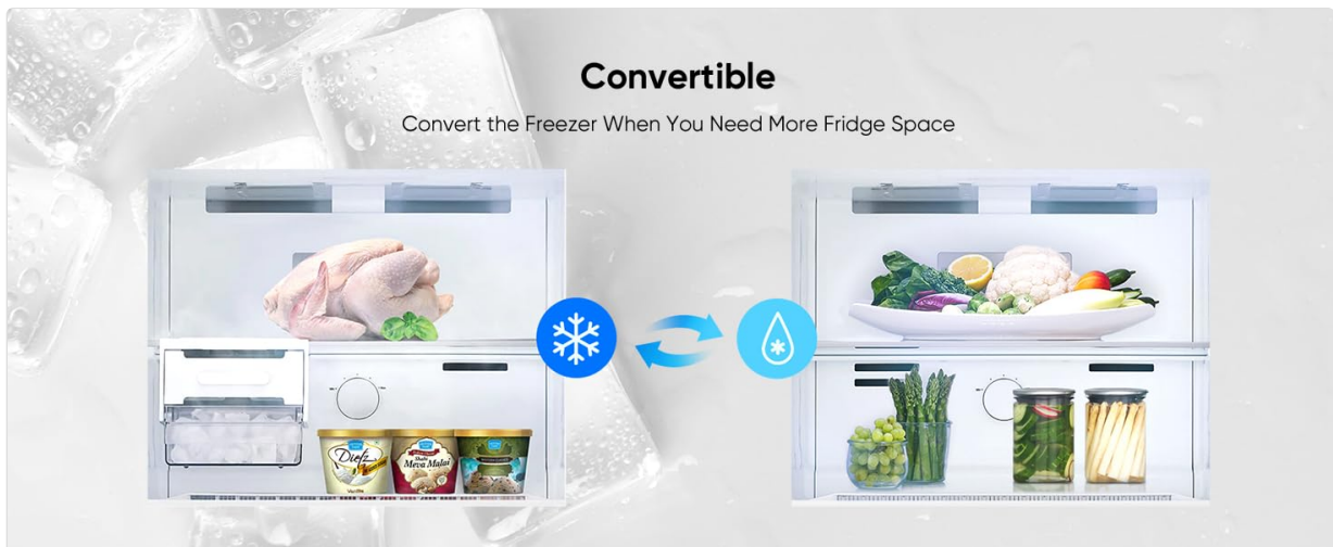
Figure 5.1: The convertible feature allows the freezer to switch between freezing and refrigerating modes.

This refrigerator offers a convertible function, allowing you to switch the freezer compartment to function as a refrigerator when more fresh food storage is needed.