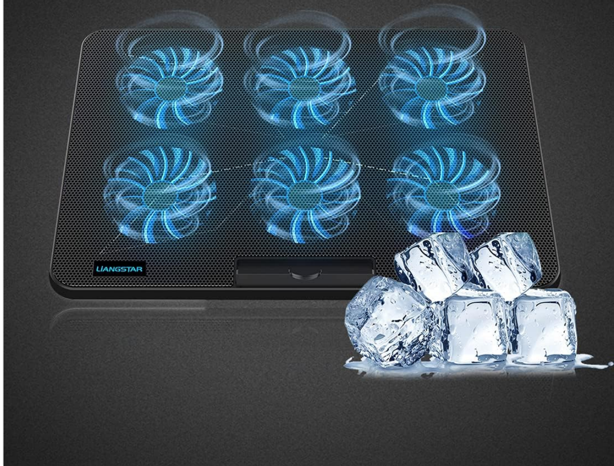
Image: The top surface of the LIANGSTAR Laptop Cooling Pad, showcasing its six blue LED cooling fans. Ice cubes are placed on the mesh to visually represent the strong airflow and cooling capability of the fans.

Your browser does not support the video tag.