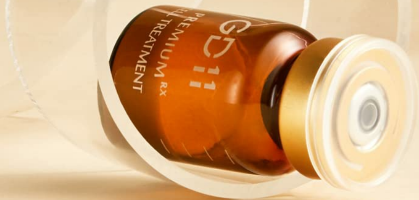
Image: Visual representation of key product benefits and features, including skin condition recovery and peptide complex.