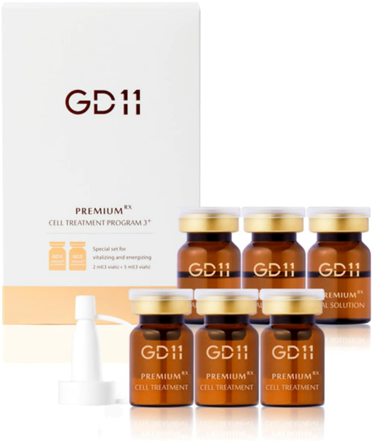
Image: The GD11 Premium Rx Cell Exosome Treatment Program packaging, showing the main box and individual treatment vials.