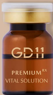
PREMIUM RX VITAL SOLUTION