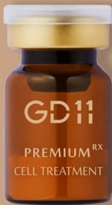
PREMIUM RX CELL TREATMENT