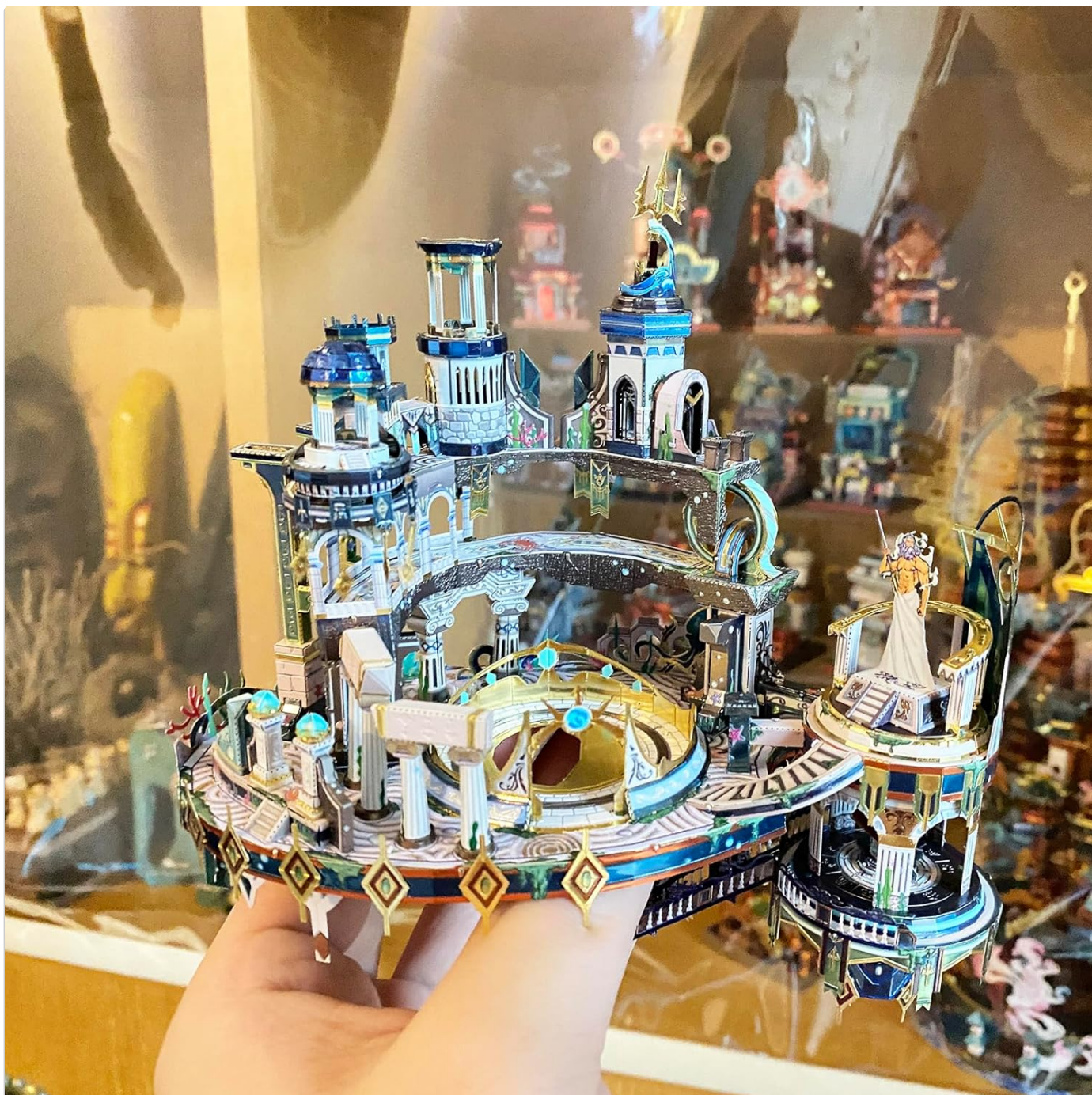
Image: A close-up of a hand holding a section of the Atlantis Palace model during assembly, highlighting the small, detailed components.