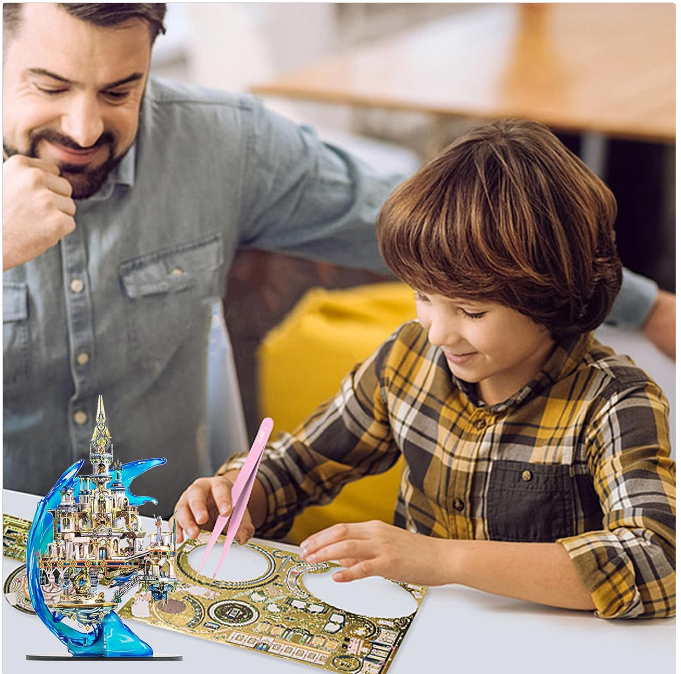
Image: A child and adult working together to assemble the intricate metal puzzle, demonstrating the detailed nature of the kit.