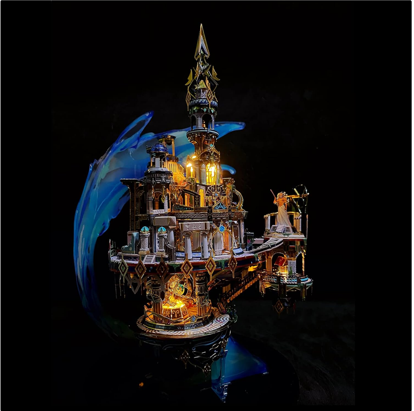
Image: The finished Atlantis Palace model with its internal lights activated, highlighting the architectural features.

The lighting adds a captivating effect to the finished model, illuminating its intricate details.