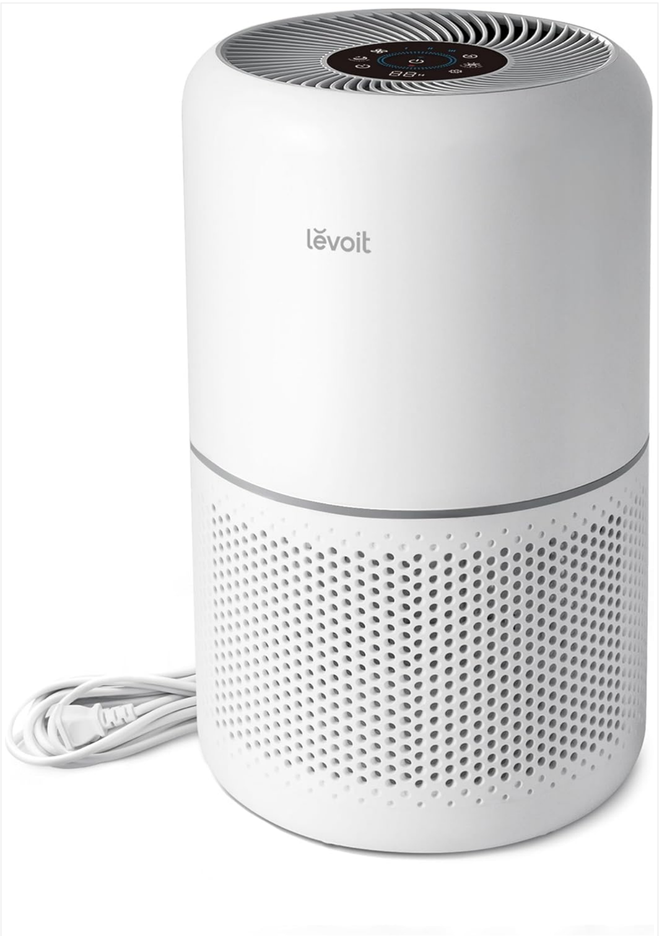
Figure 6: The air purifier operates quietly in sleep mode, ideal for bedrooms.