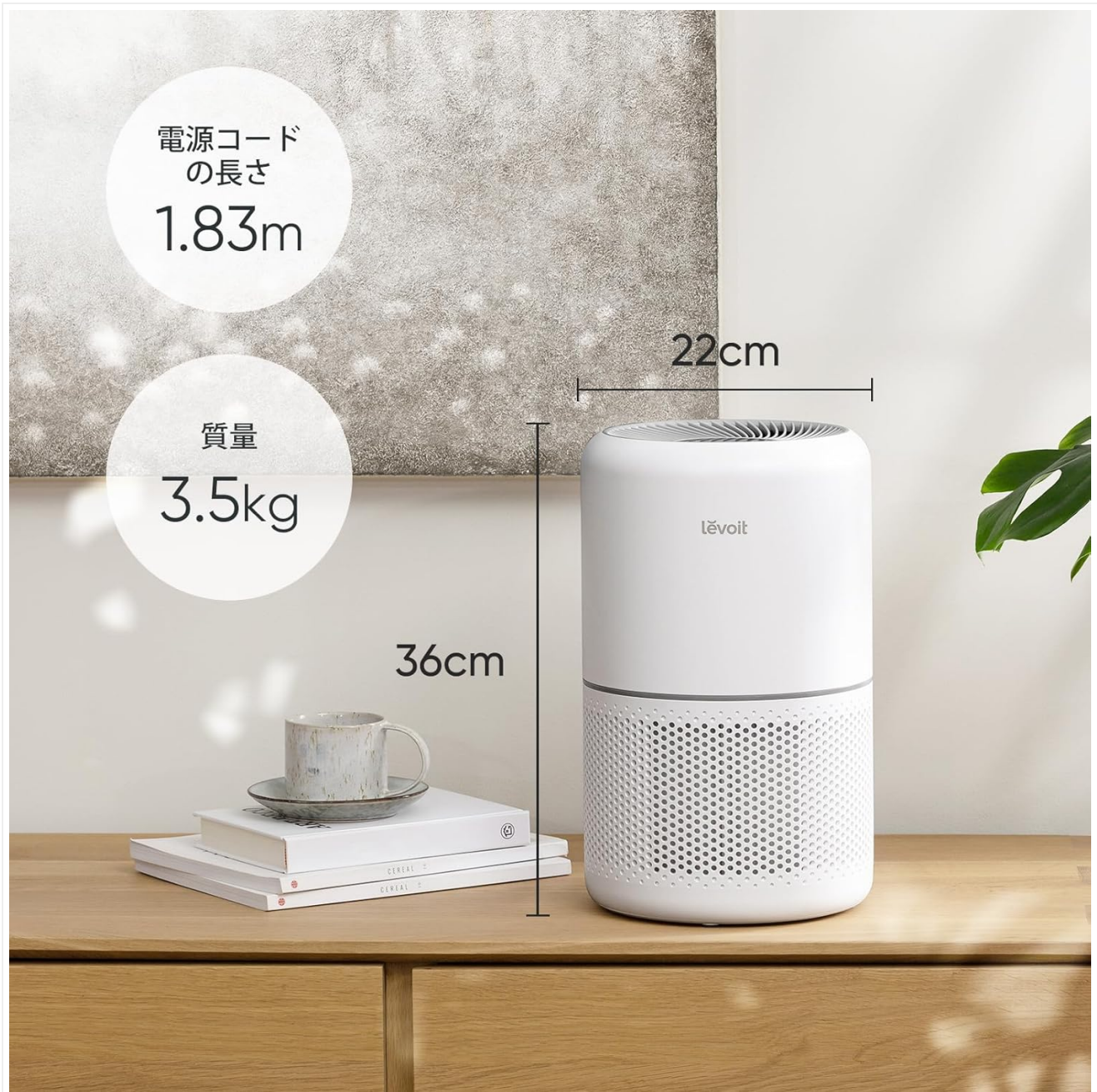
Figure 11: Product dimensions and weight.

Note: Product specifications may be updated due to performance improvements. Refer to the Amazon product page for the latest information.