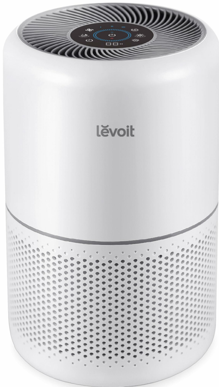
Figure 1: Levoit Core 300S Smart Air Purifier.