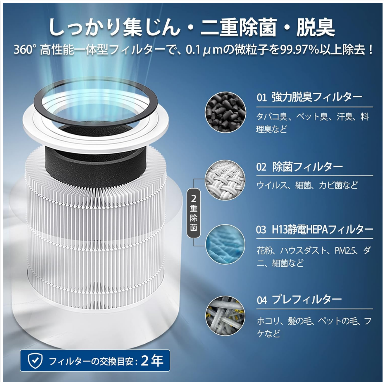
Figure 9: The 4-layer filtration system for comprehensive air purification.

4. Activated Carbon Filter: Effectively removes odors from tobacco smoke, pets, cooking, and mold.