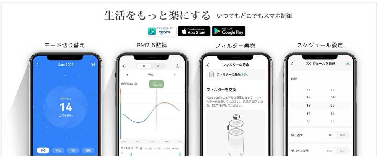
Figure 7: Control your air purifier from anywhere using the VeSync app.