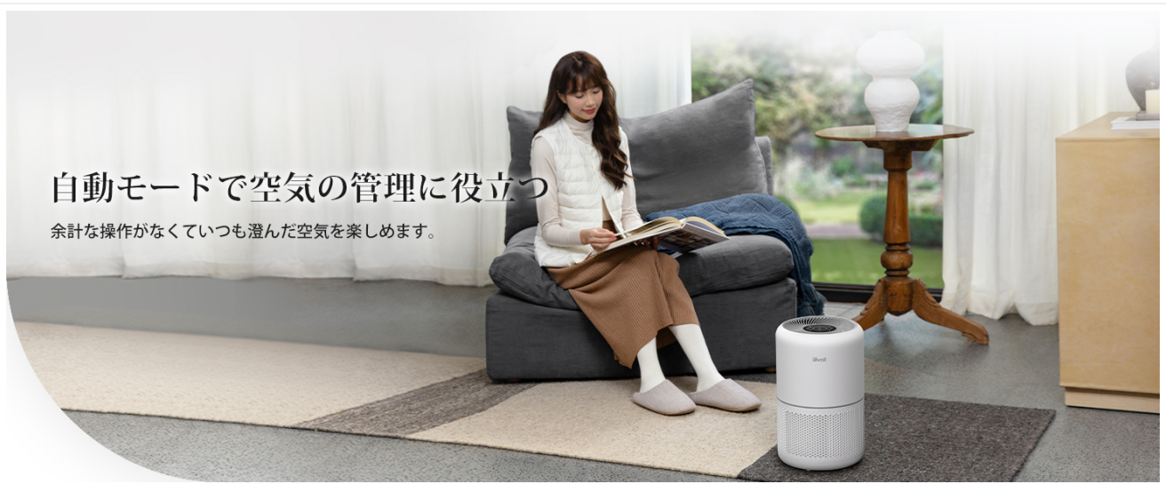
Figure 5: Automatic mode adjusts fan speed based on detected air quality.