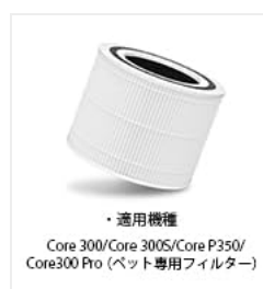
Figure 10: Original replacement filter for Core 300/300S/P350/300 Pro.

The filter has a lifespan of approximately 2 years, but it is recommended to replace it every 6 to 12 months, depending on usage and air quality. The VeSync app will notify you when a filter replacement is due.