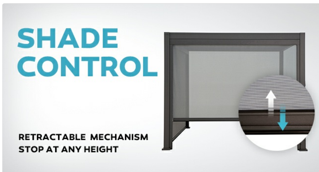
Image: A graphic demonstrating the retractable mechanism, showing how the screen can be stopped at any height for shade control.