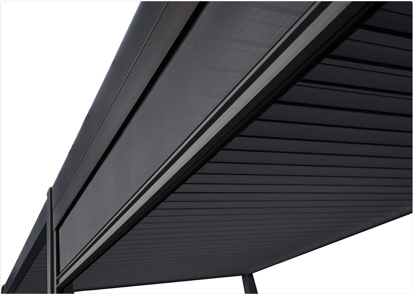
Image: A close-up view of the top mechanism where the fixed base is attached to the pergola's horizontal pipe.

Carefully lift the main body of the curtain and position it onto the fixed base from the outside. Lift it up until it aligns with the inner top of the fixed base. Secure the fixed base and the main body of the curtain together using the provided screws.