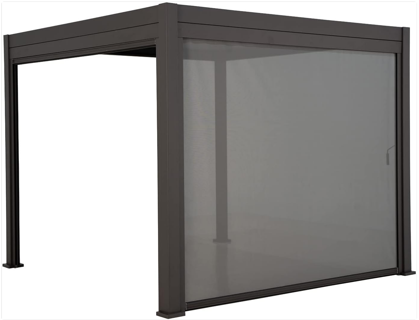
Image: The Sorara Privacy Screen Panel shown installed on a pergola structure, providing a shaded and private area.