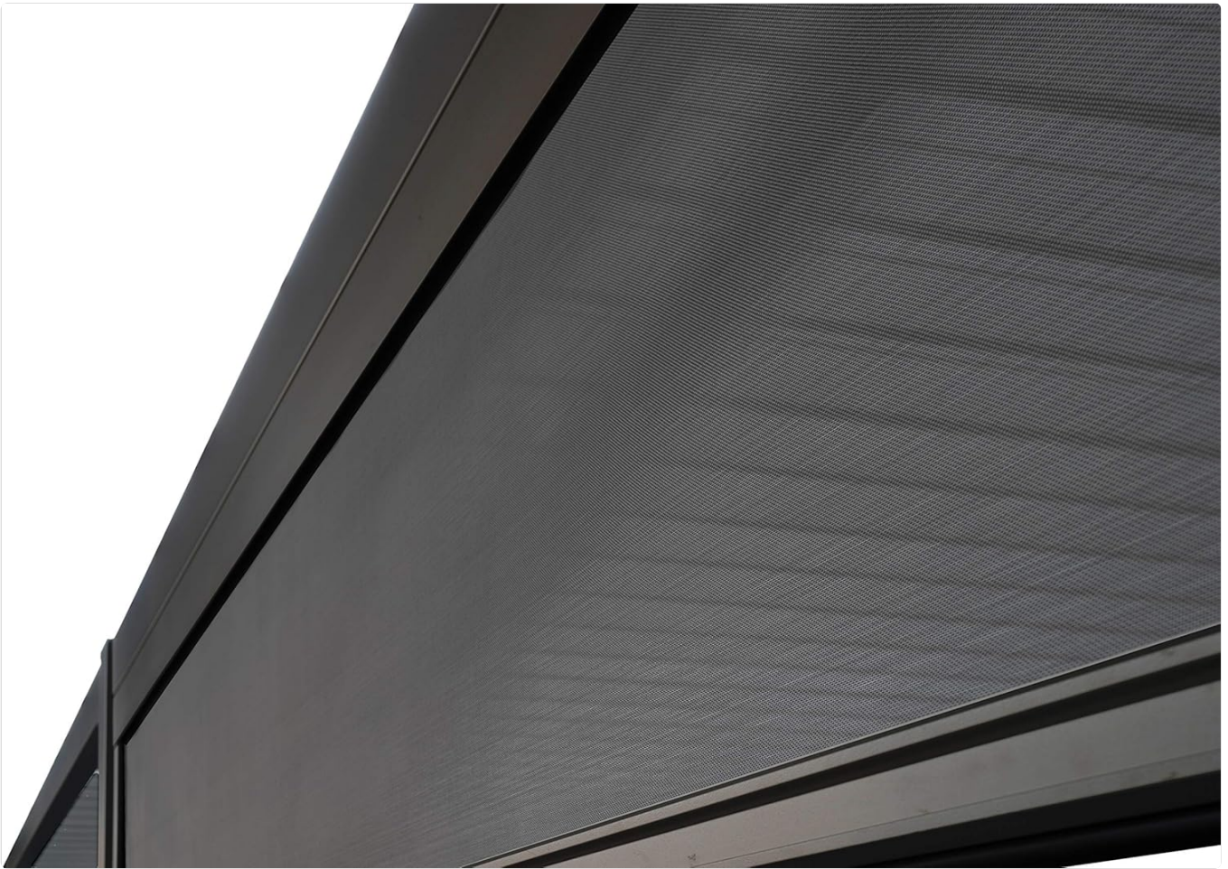
Image: A close-up of the 400g/m² Textilene fabric, highlighting its breathable and durable texture.