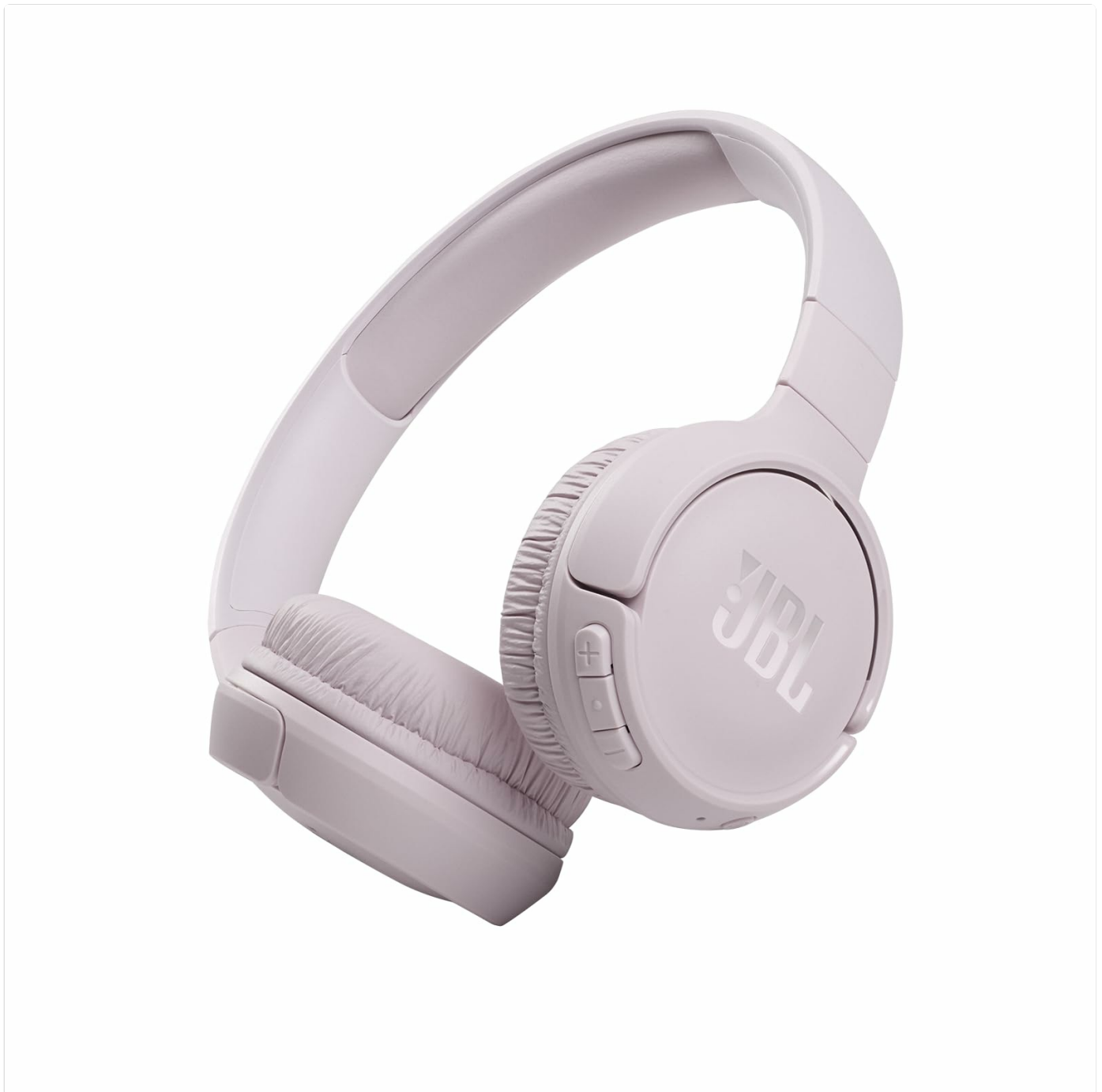
Image: JBL Tune 510BT headphones in Rose color, showcasing the overall design.