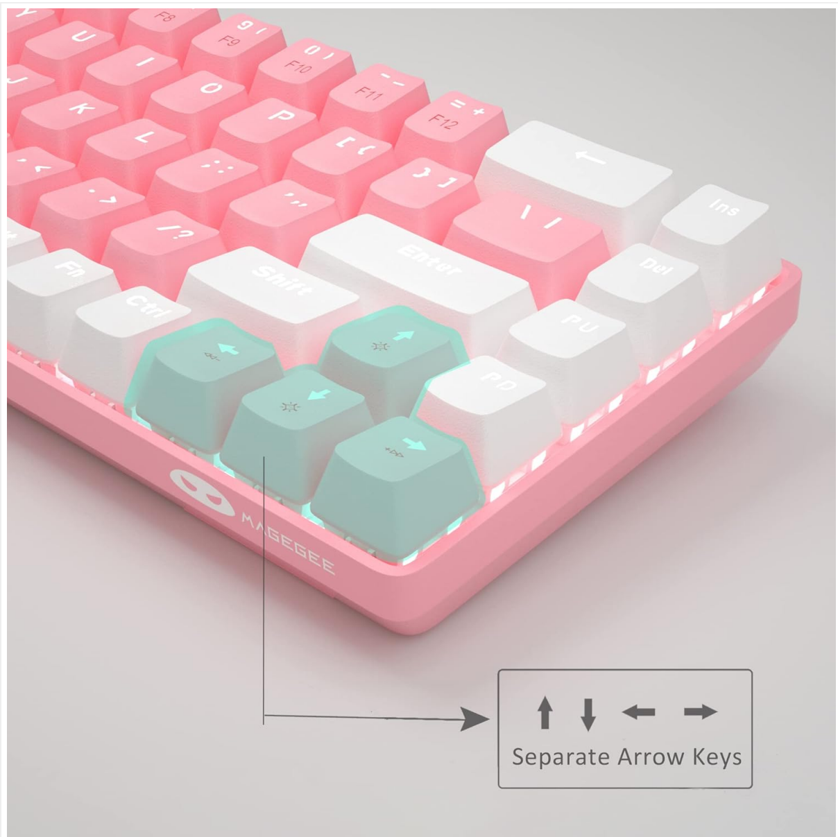
Image 4.2: A detailed view of the keyboard's dedicated arrow keys, providing convenient navigation.