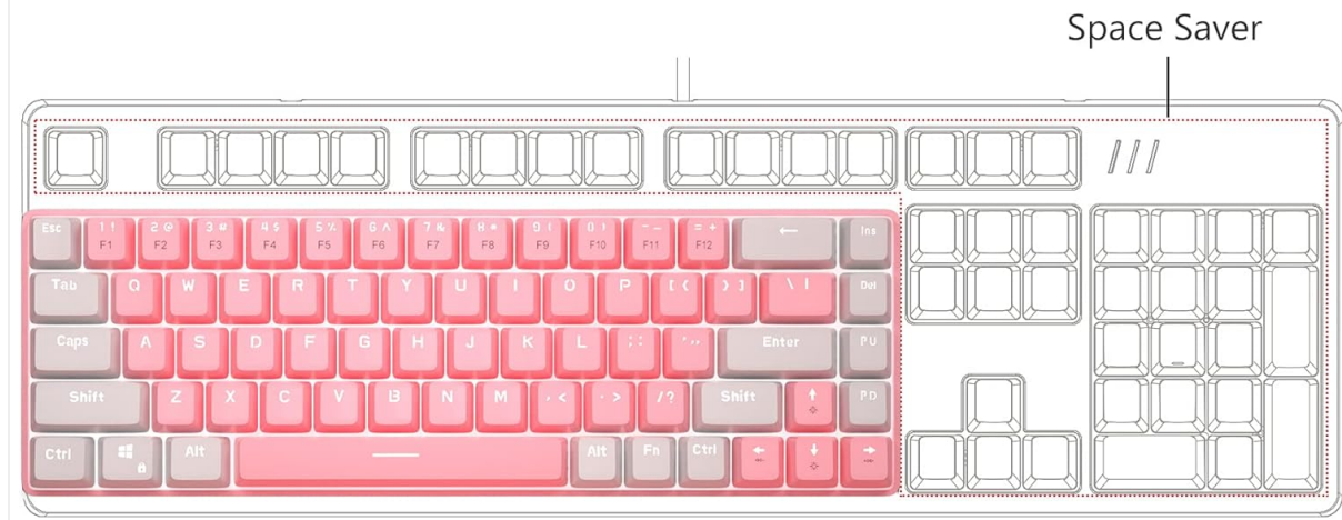
Image 4.1: A visual representation of the keyboard's compact 60% layout, highlighting its 68-key configuration.