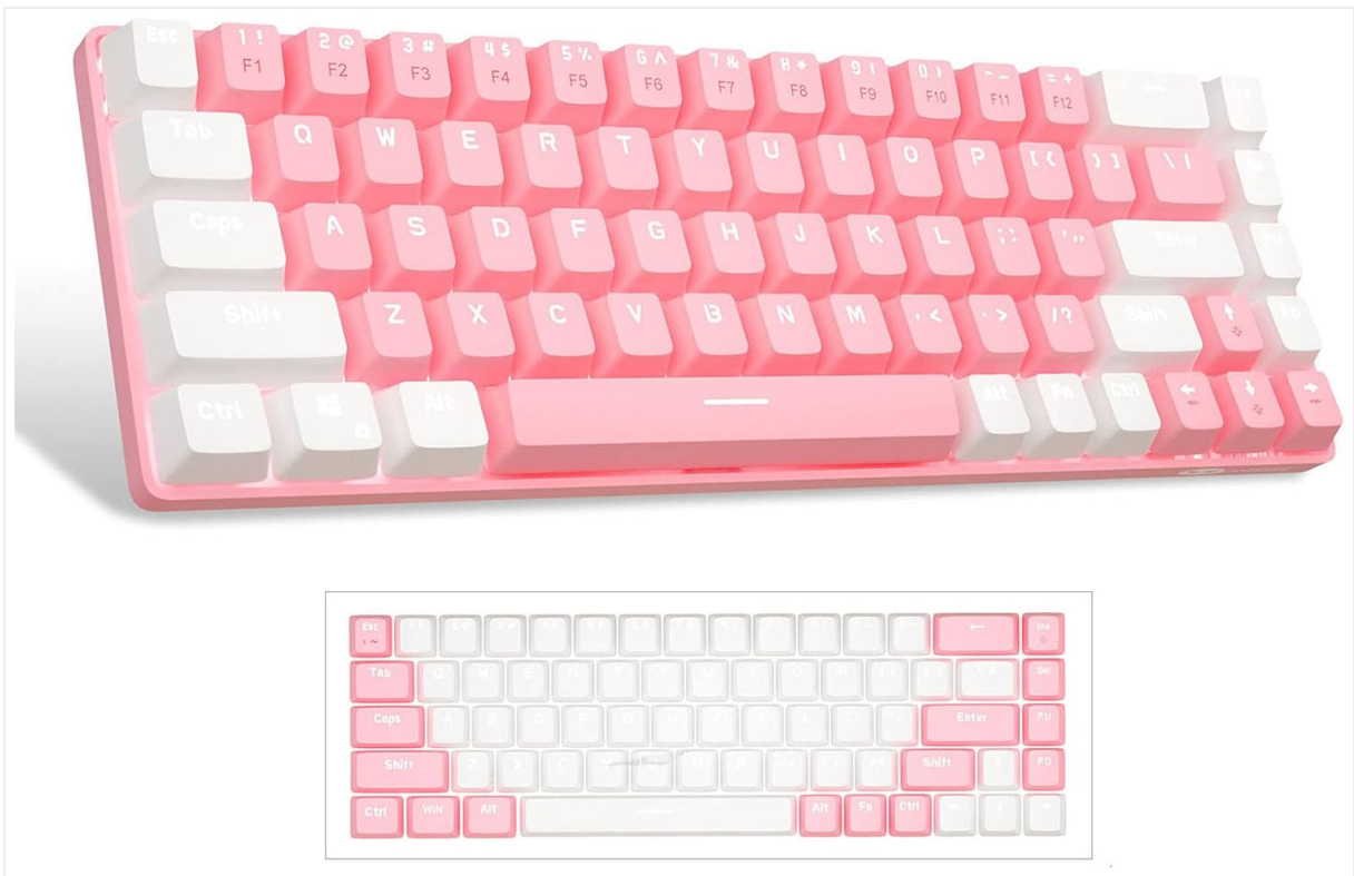
Image 1.1: The MageGee MK-Box 60% Mechanical Gaming Keyboard, featuring a pink and white color scheme and LED backlighting.

Thank you for purchasing the MageGee MK-Box 60% Mechanical Gaming Keyboard. This compact and versatile keyboard is designed for both gaming and office use, offering a comfortable typing experience with its blue mechanical switches and customizable LED backlighting. This manual provides detailed instructions for setup, operation, maintenance, and troubleshooting to ensure optimal performance.