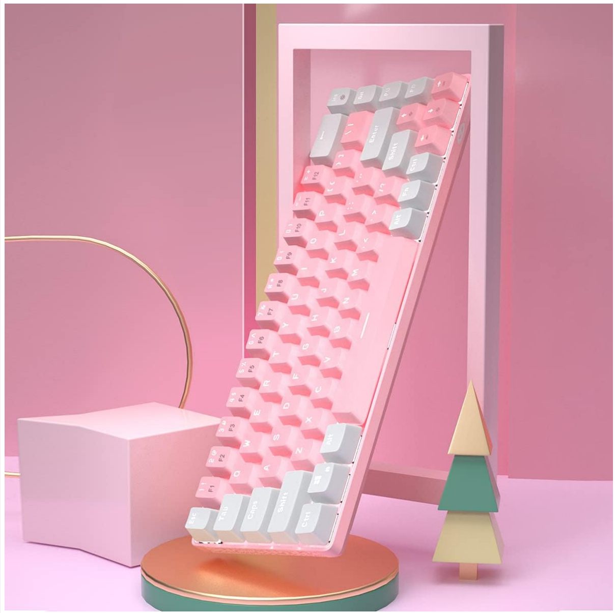
Image 3.2: The keyboard with its adjustable feet extended, demonstrating the ergonomic tilt feature.