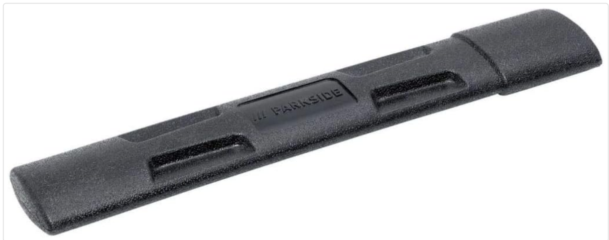
Figure 4: The included blade guard ensures safe storage and transport of the hedge trimmer.