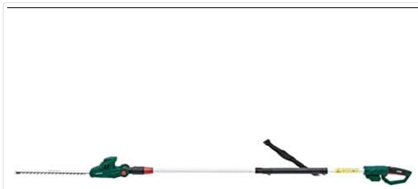
Figure 1: Overview of the Parkside PTHSA 20-Li A2 Cordless Telescopic Hedge Trimmer in its extended configuration.