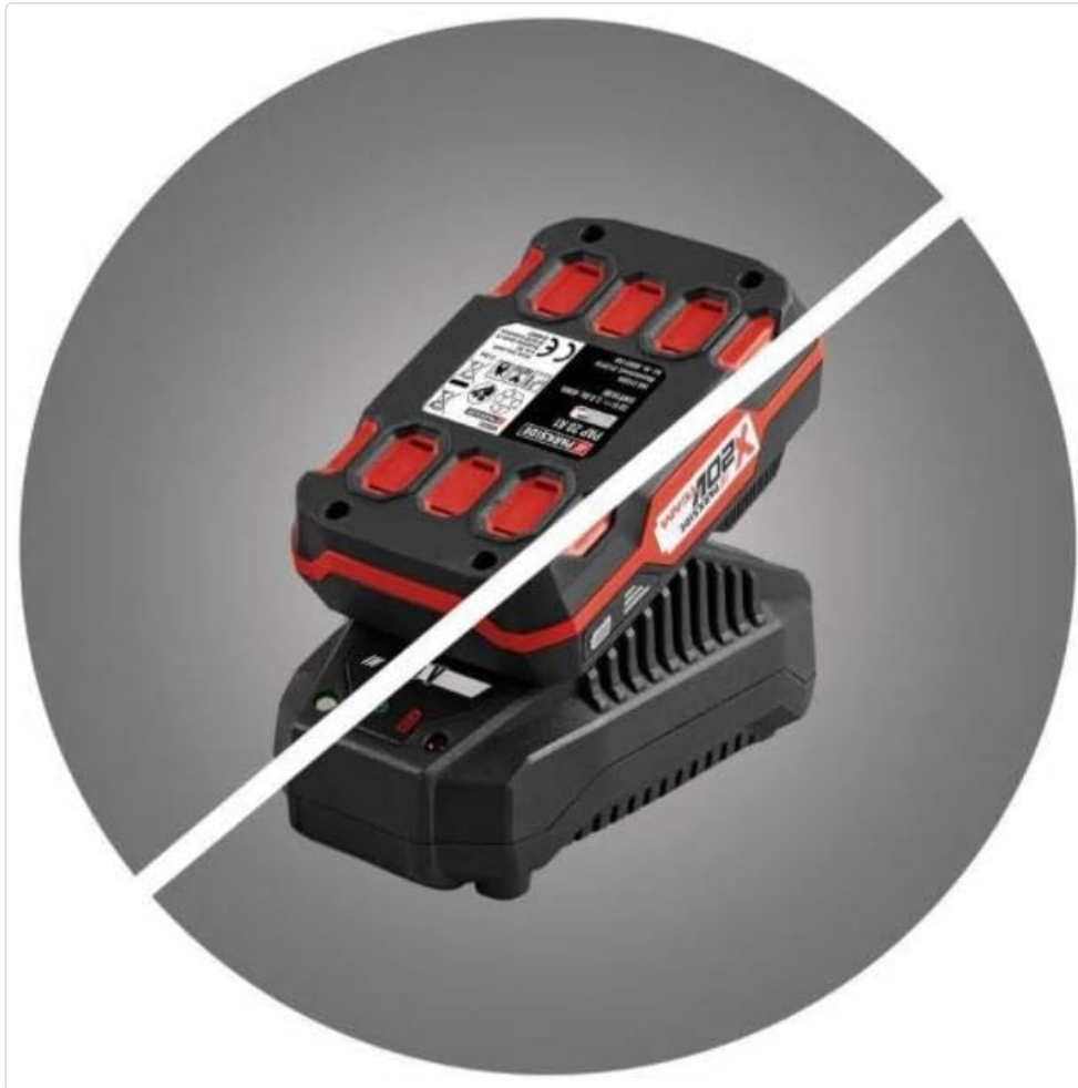
Figure 5: This product does not include the battery or rapid charger. These must be purchased separately.