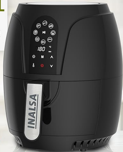
Image: Illustration of AirCrisp Technology circulating hot air for healthy frying.