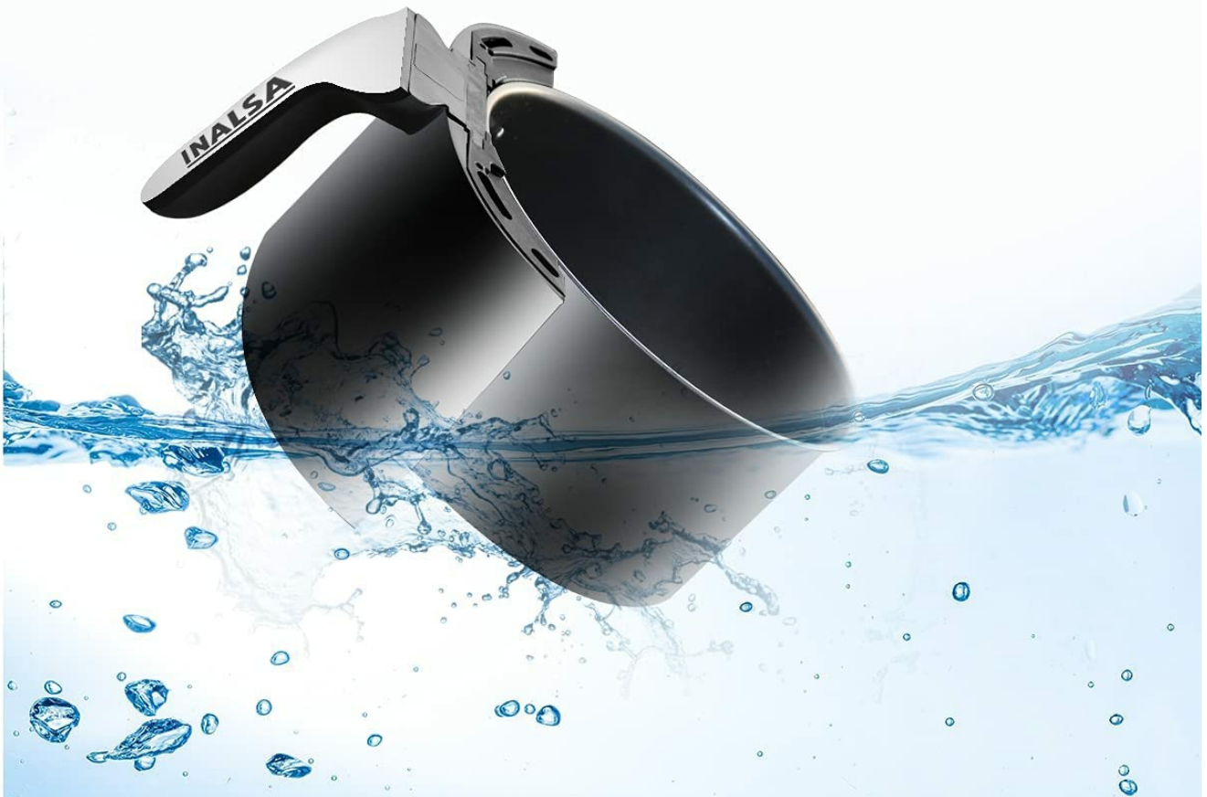
Image: Detachable basket being cleaned in warm water with a soft sponge.

Soak the detachable basket in warm water. Use a soft sponge and wipe it. Dry immediately to protect the non-stick coating