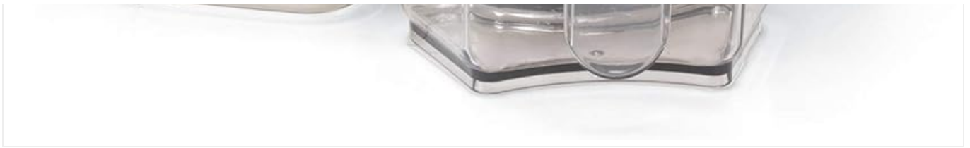
Figure 4: The SIRMAN Ektor 37 juicer actively extracting juice, with the juice flowing into the collection container. This image shows the appliance during its primary function.