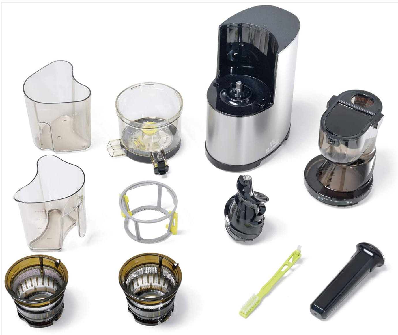
Figure 1: Exploded view of the SIRMEN Ektor 37 juicer showing all detachable components including the motor base, feeding chute, juice bowl, pulp container, juice container, auger, filter, and cleaning brush. This image helps in identifying each part for assembly and cleaning.