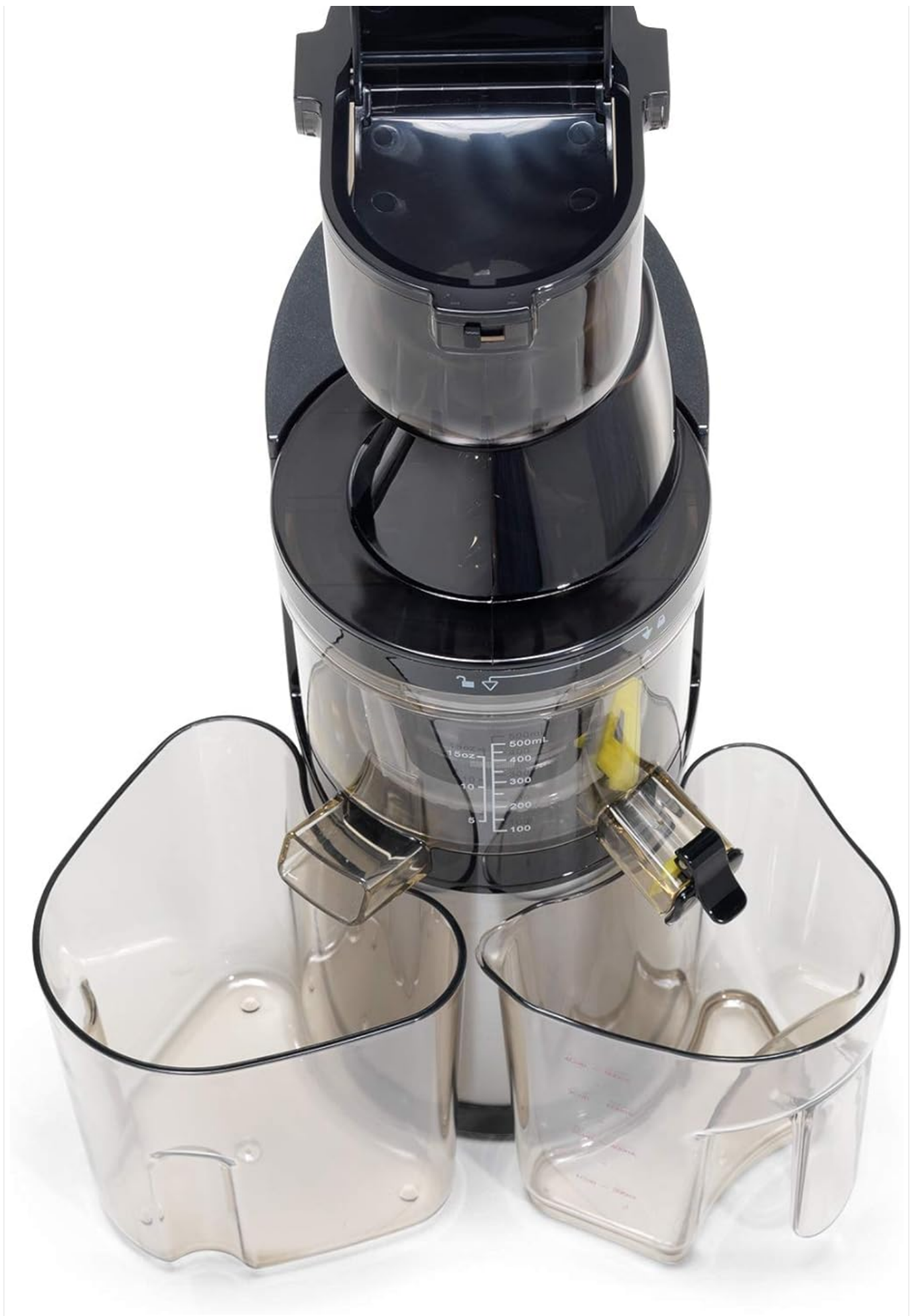
Figure 2: The SIRMEN Ektor 37 juicer fully assembled, showing the main unit with the juice and pulp collection containers placed correctly