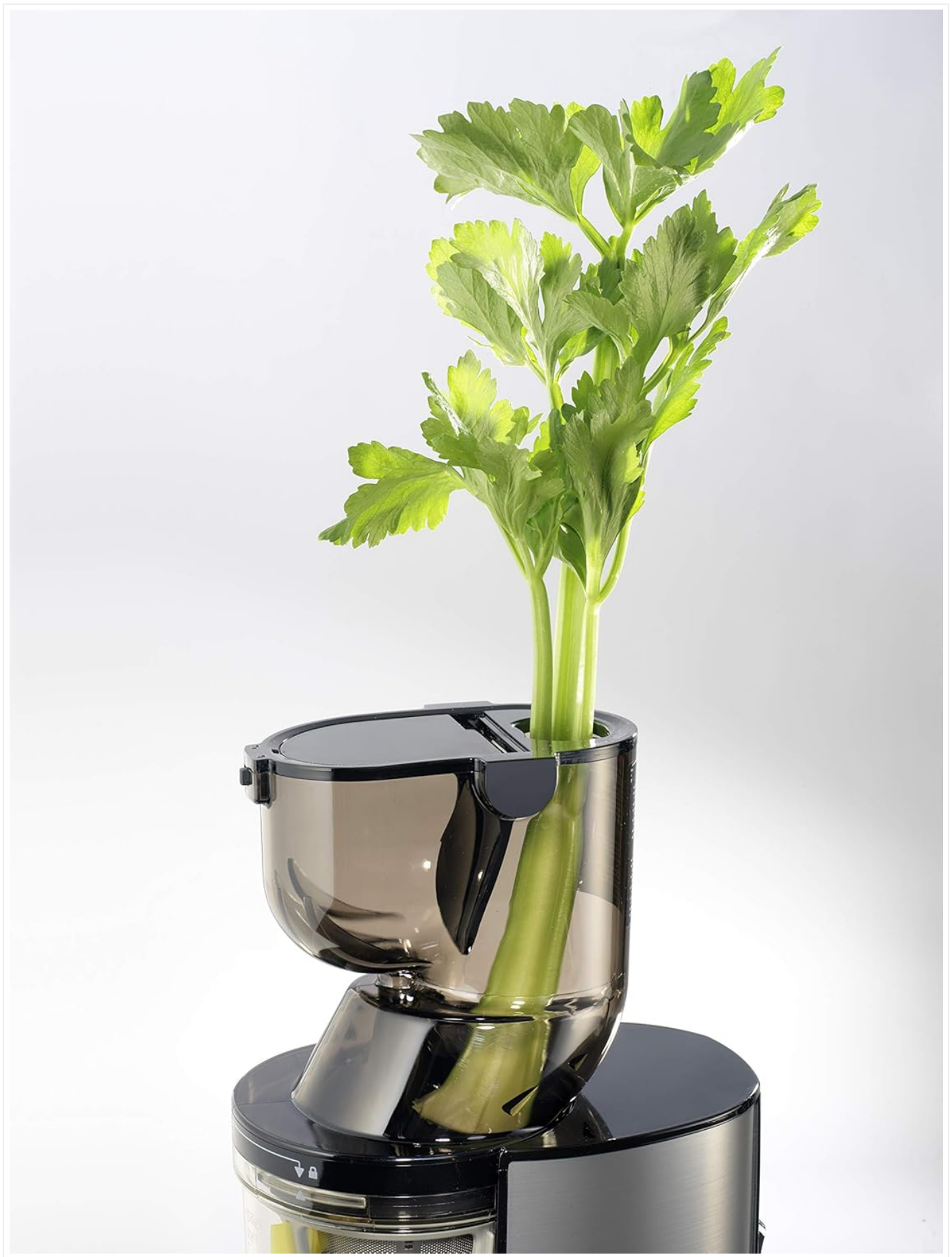
Figure 3: A hand gently pushing celery into the feeding chute of the SIRMEN Ektor 37 juicer. This demonstrates the correct method for introducing produce during operation.