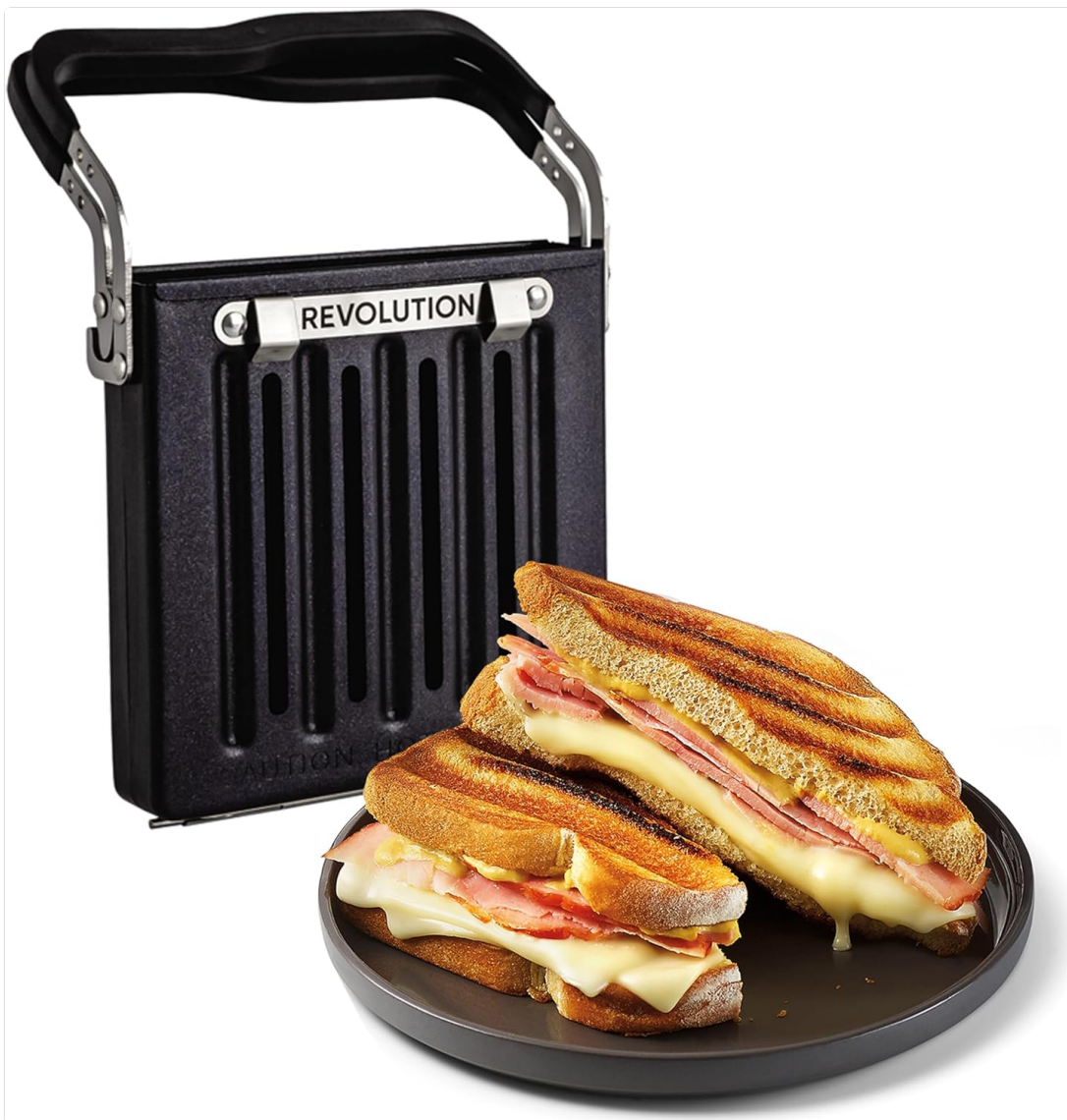
Image: A perfectly grilled sandwich, made using the Revolution Toastie Press, showcasing the golden-brown toast and melted cheese.