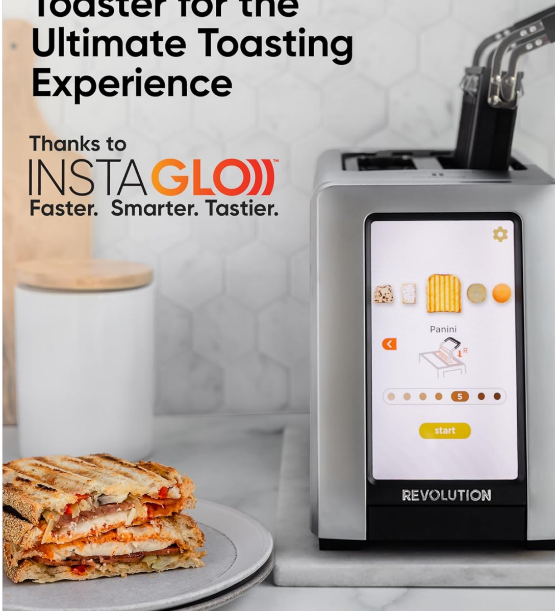
Image: The Revolution Toastie Press placed inside a Revolution toaster, demonstrating how it fits and interacts with the toaster's interface for optimal toasting.

Thanks to INSTAGLO™ Faster. Smarter. Tastier.