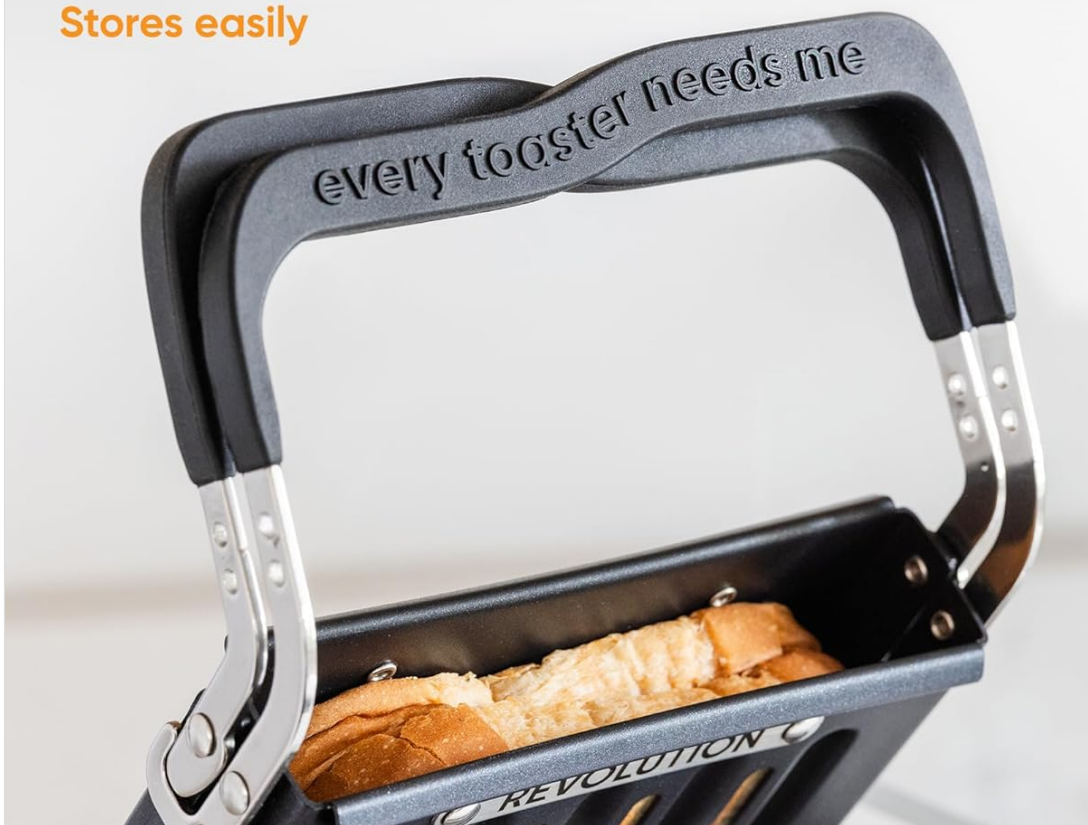
Image: The Revolution Toastie Press with a piece of bread inside, ready to be inserted into a toaster. The handle reads "every toaster needs me".