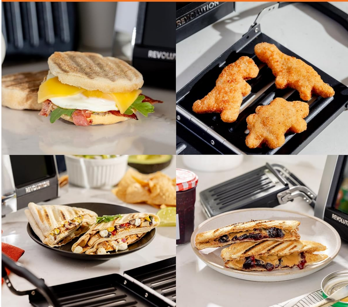
Image: A visual collage showcasing the versatility of the Revolution Toastie Press, featuring an egg sandwich, dinosaur-shaped chicken nuggets, a chicken quesadilla, and a peanut butter and jelly toastie, all prepared using the press.

Turns your toaster into a breakfast, lunch, dinner, and dessert delight.