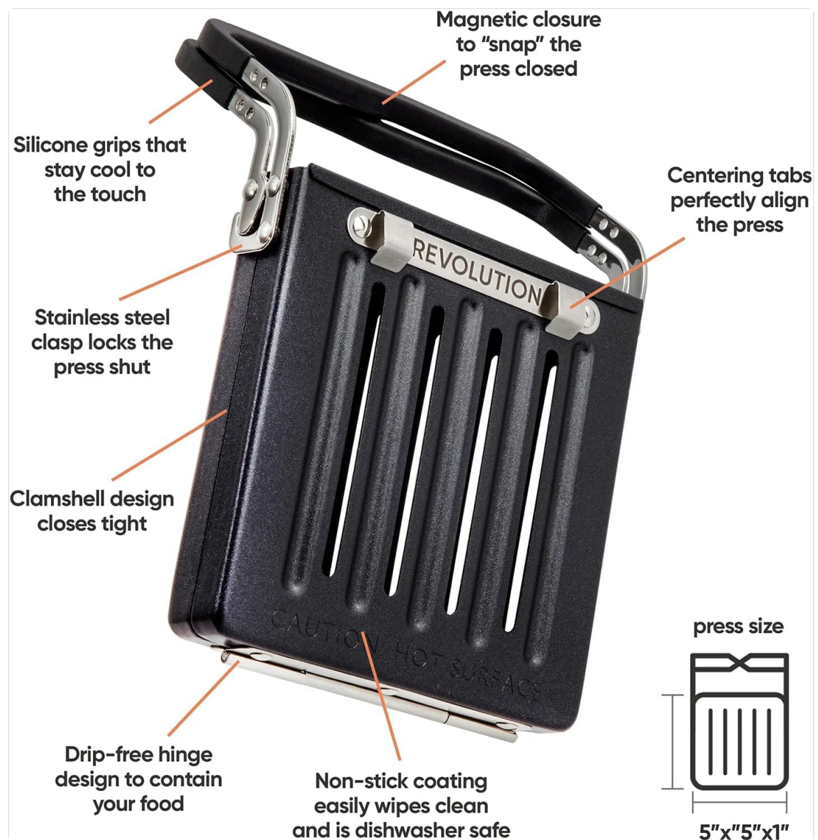
Image: Detailed view of the Revolution Toastie Press highlighting its various components and features, including silicone grips, stainless steel clasp, clamshell design, non-stick coating, drip-free hinge, magnetic closure, and centering tabs.