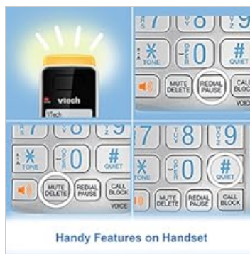
Image: Visual representation of key features on the VTech handset, including the visual ringer, redial, mute, and quiet mode buttons.