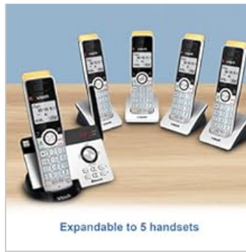
Image: The VTech phone system demonstrating its expandability with multiple handsets.