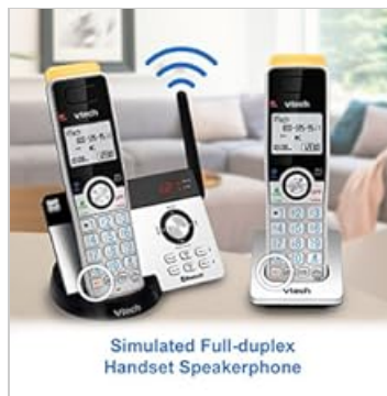
Image: VTech handsets demonstrating the full-duplex speakerphone capability.