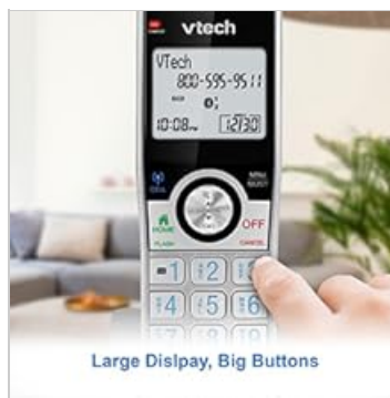
Image: The large display and big, lighted buttons on a VTech handset.

The handsets feature a large, high-contrast 2-inch display with enlarged font for easy reading of caller ID and call history. The illuminated keypad ensures comfortable dialing even in low-light conditions.