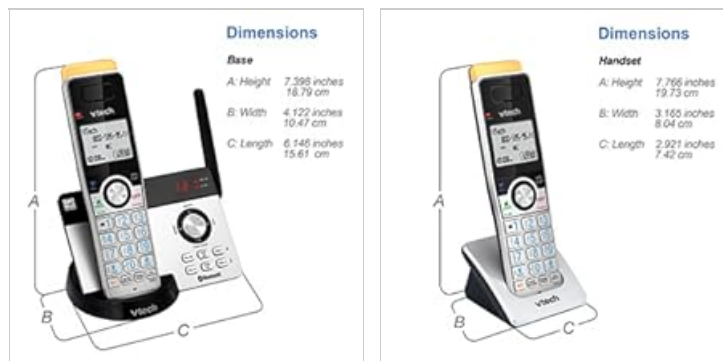
Image: Dimensions of the VTech base unit and handset.