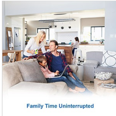
Image: A family enjoying their time at home, illustrating the benefit of uninterrupted communication.

The Smart Call Blocker feature automatically screens and blocks unwanted robocalls and spam calls on your landline. You can permanently blacklist any number with a single touch. The system can store up to 1,000 name/number entries in its directory for allowed callers. This feature helps maintain peace and quiet by preventing disruptive calls.