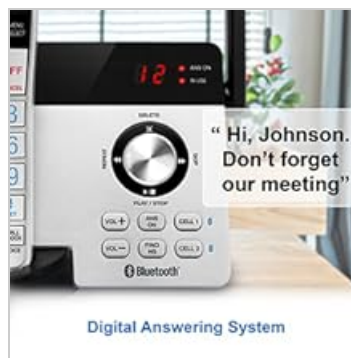
Image: The digital answering system controls on the VTech phone base unit.

The integrated digital answering machine records up to 22 minutes of messages, memos, and outgoing announcements. It features an LED message counter on the base unit. A voice guide simplifies the setup process, and messages can be played back, saved, deleted, skipped, or repeated directly from the handset.