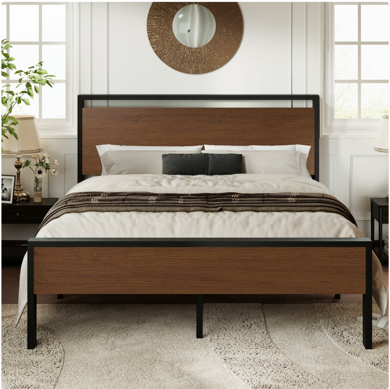
Image 2.1: Fully assembled Allewie Queen Size Platform Bed Frame in Walnut.