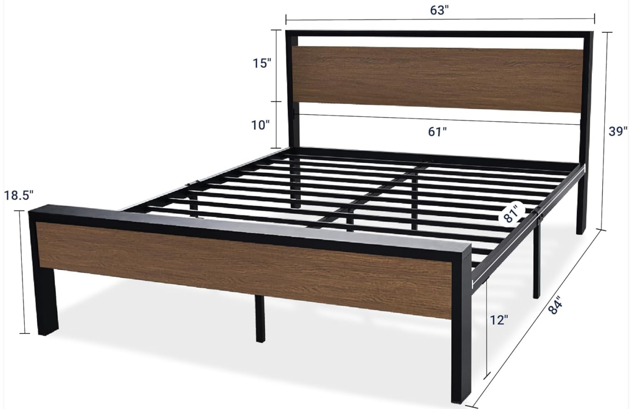
Image 3.2: Dimensional drawing of the Queen size bed frame, showing overall length, width, and height.

Max Capacity: 800 lbs Recommend Mattress Thickness: 10-14 in.