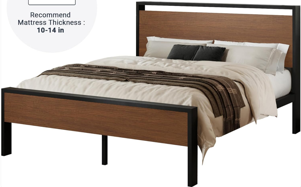
Image 4.1: Recommended mattress thickness for optimal fit and appearance.