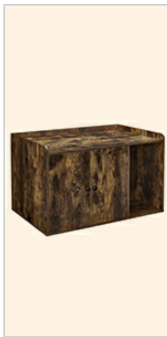
Image 6.1: Key features including ventilation, magnetic locks, and protective feet.