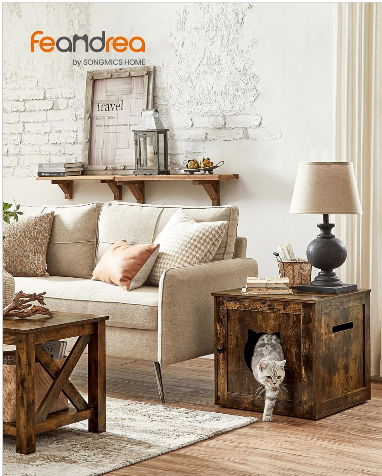
Image 1.1: The FEANDREA Cat Litter Box Furniture in a living room setting.