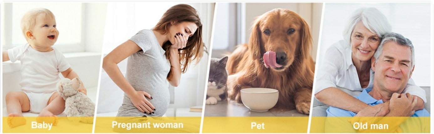
Image: Four panels illustrating different use cases for the monitor: monitoring a baby, a pregnant woman, a pet, and an elderly person.