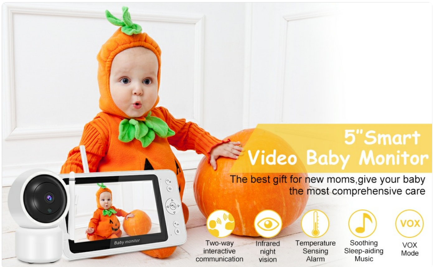
Image: An overview of the SHUMDHA 5-inch Smart Video Baby Monitor highlighting key features like two-way communication, infrared night vision, temperature sensing alarm, soothing sleep-aiding music, and VOX mode.