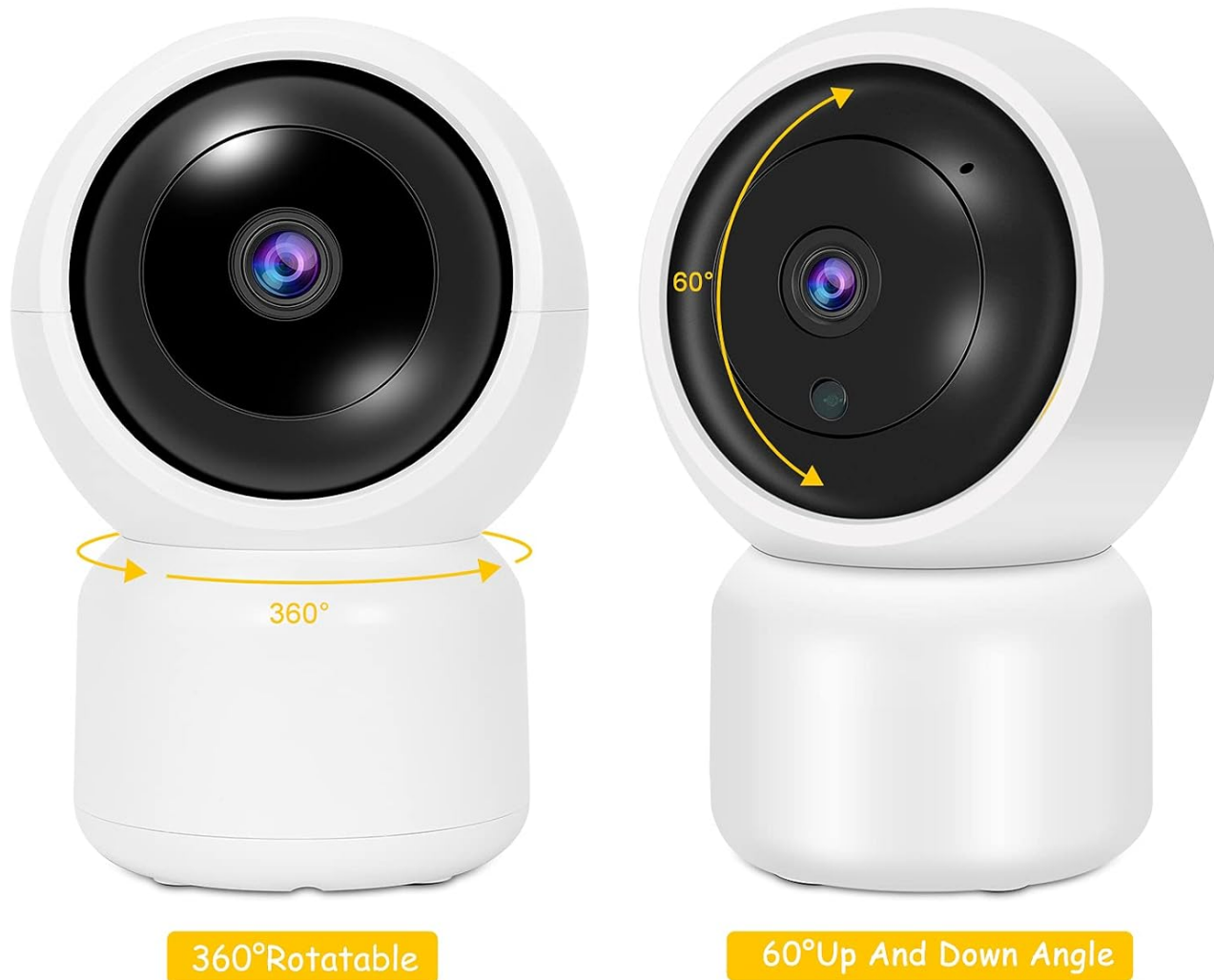
Image: Illustration showing the camera's rotational capabilities: 360-degree horizontal rotation and 60-degree vertical (up and down) angle adjustment.