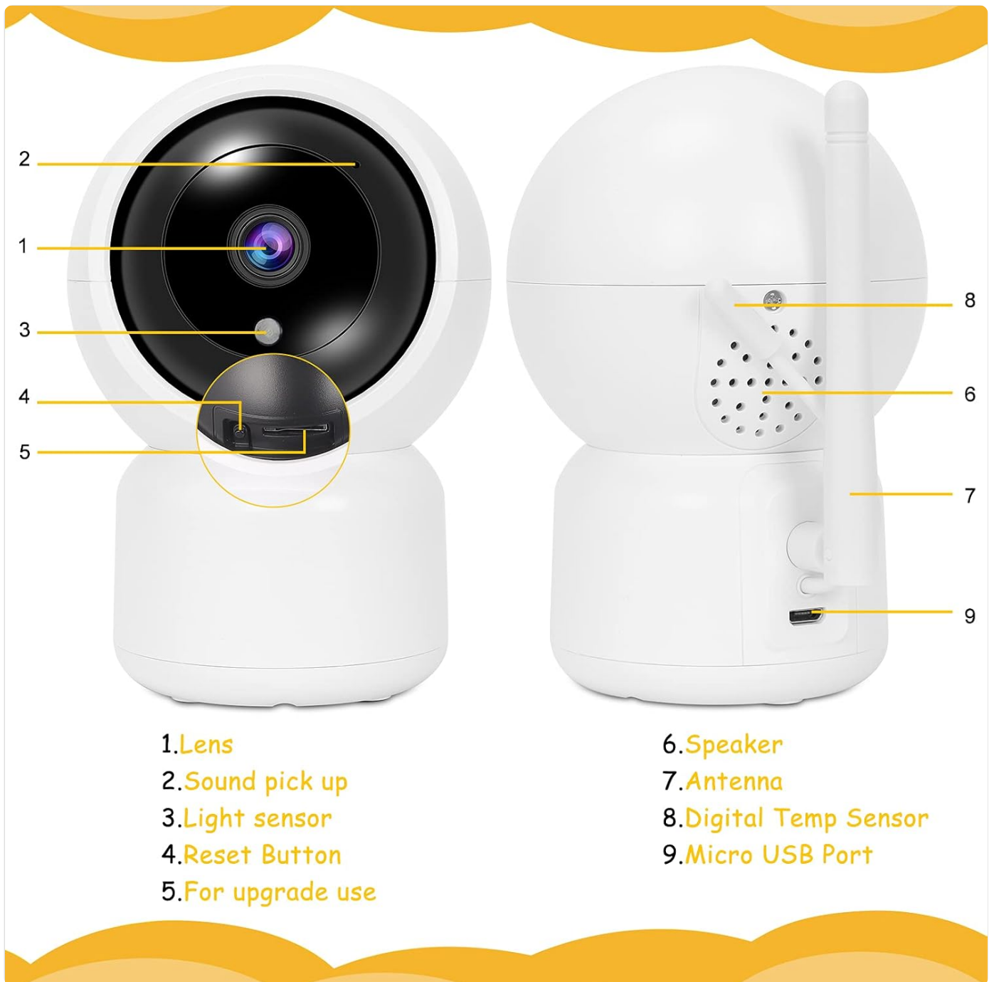
Image: Detailed diagram of the SHUMDHA baby camera, labeling its components such as the lens, sound pickup, light sensor, reset button, speaker, antenna, digital temp sensor, and Micro USB port.