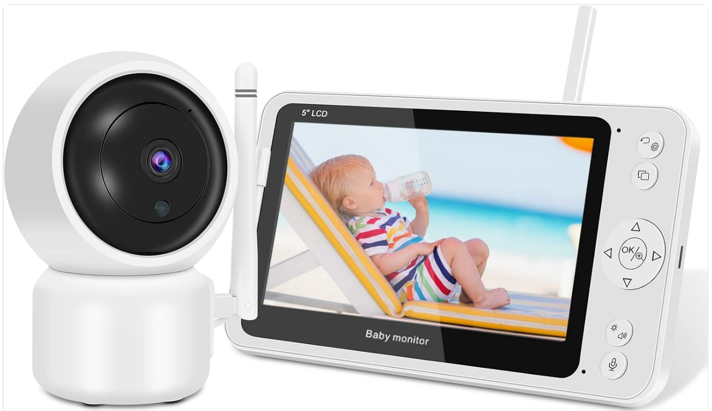
Image: The SHUMDHA 5-inch video baby monitor, showing the camera unit and the portable parent unit with a live feed of a baby.

Thank you for choosing the SHUMDHA 1080P 5-inch 2.4GHz Video Baby Monitor. This manual provides essential information for the safe and effective operation of your new baby monitor. Please read it thoroughly before use and keep it for future reference.