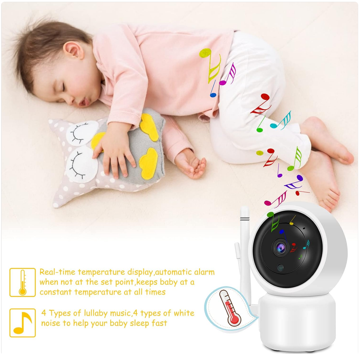
Image: A baby sleeping peacefully, with icons indicating real-time temperature display and automatic alarm, and the availability of 4 types of lullaby music and 4 types of white noise to aid sleep.