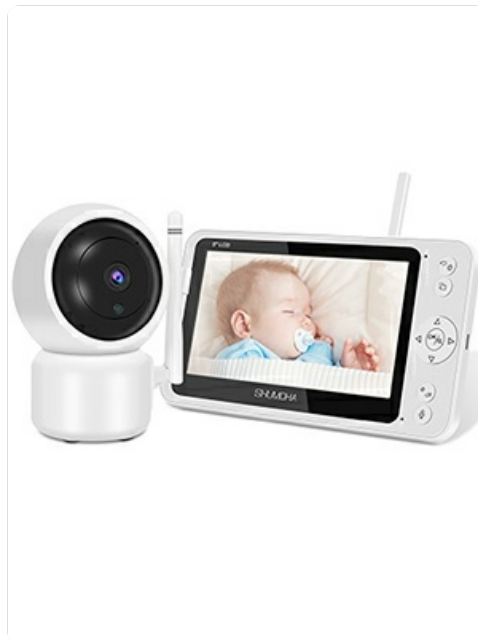
Image: The SHUMDHA baby monitor and camera unit, with the monitor displaying a sleeping baby.